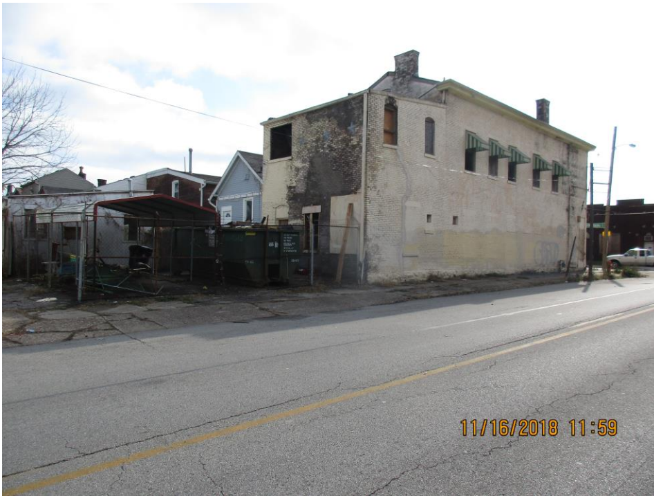
Rear of the subject property