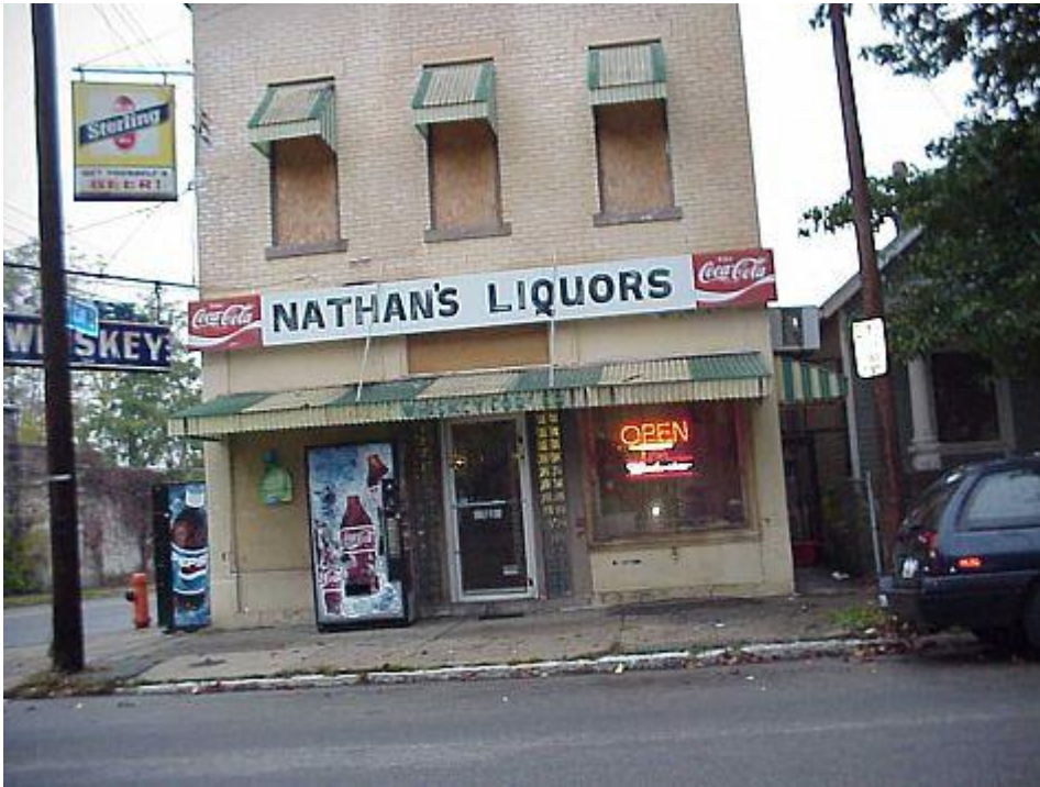
PVA Photo of the site – Photo not dated