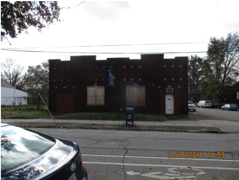
Property across Kentucky St. from subject property