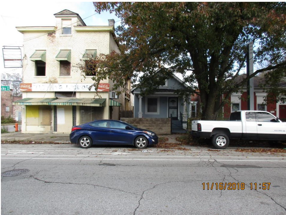
Photo of the site showing adjacent residential property to the east