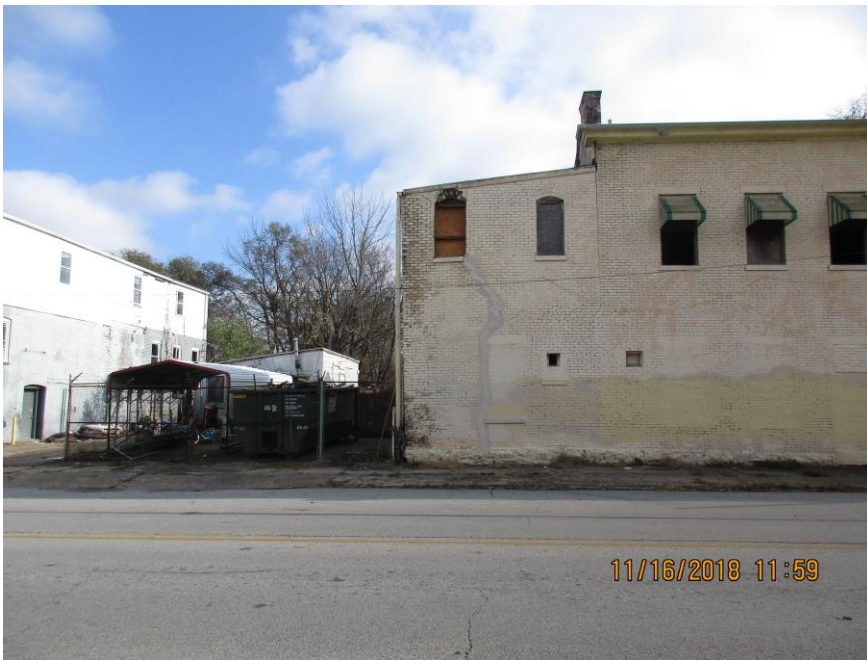
Rear of subject property with adjacent property to the rear visible