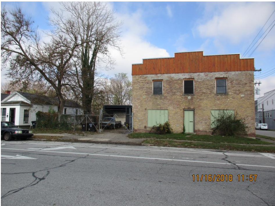
Property across Clay St. from subject property