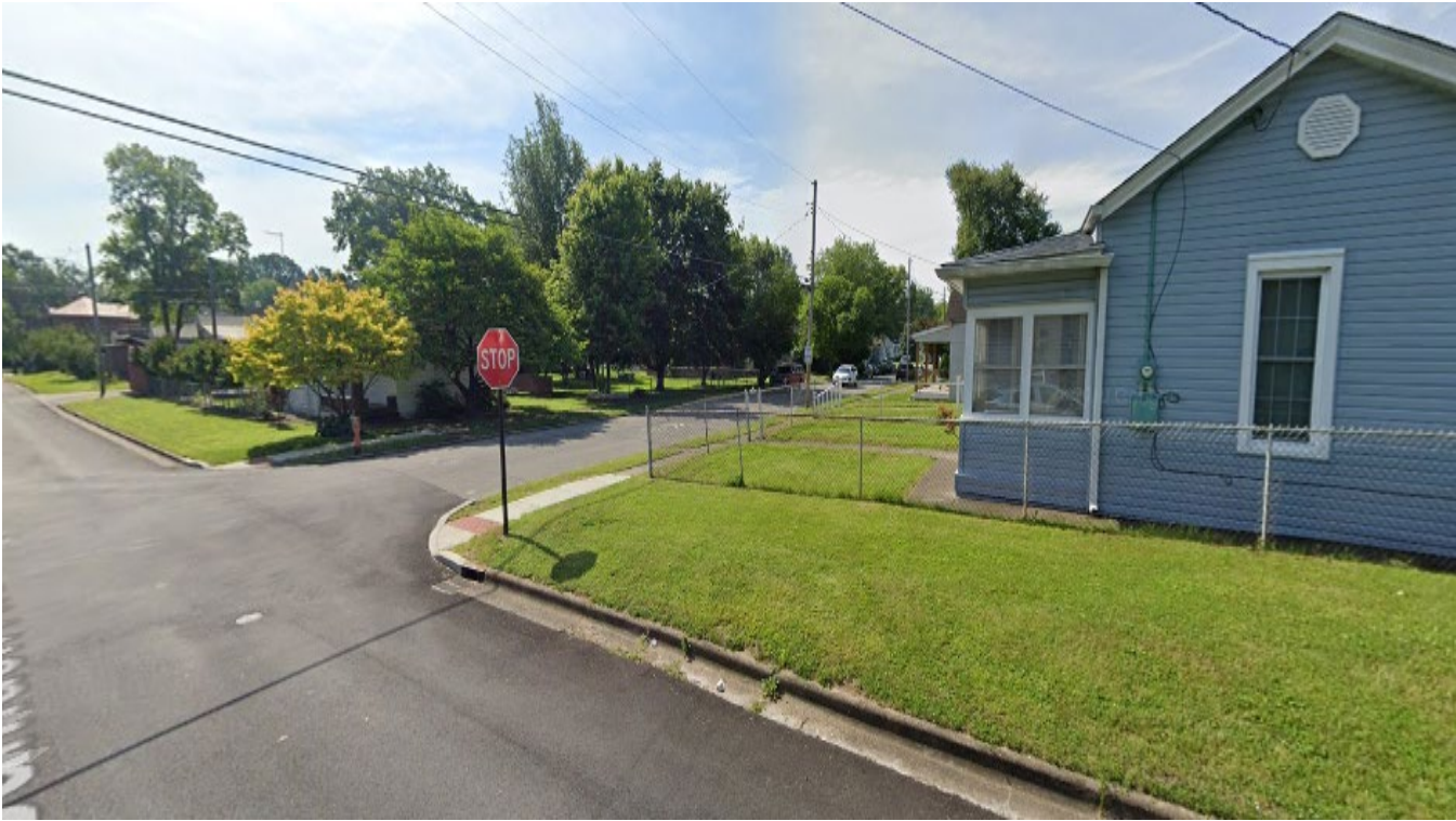
Across Camden Ave