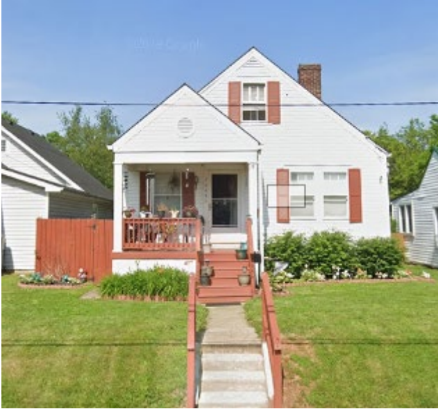
Property to the right.