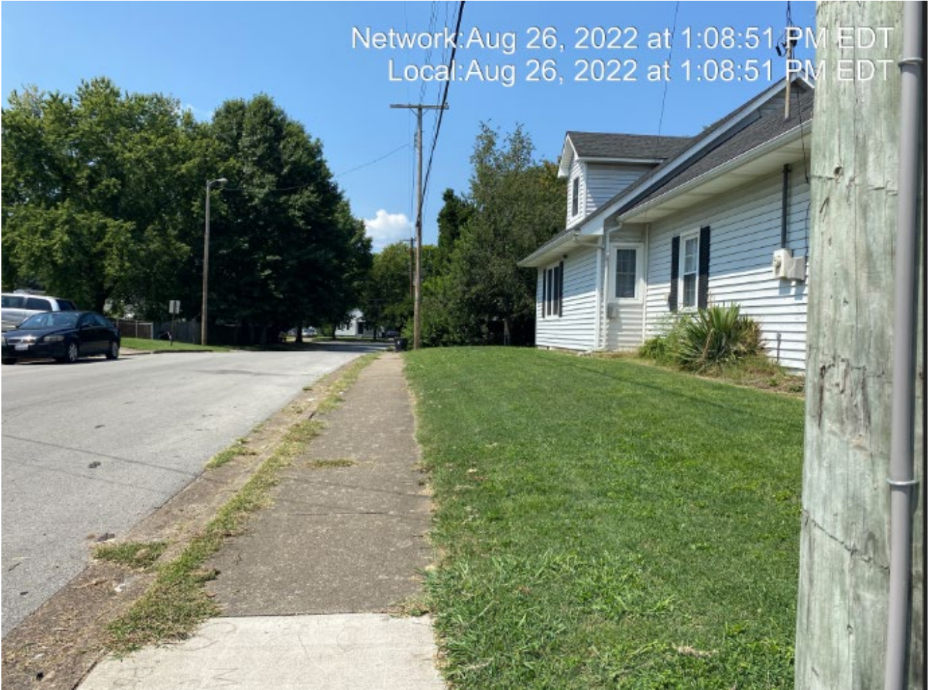
View of variance area from intersection.

Network: Aug 26, 2022 at 1:08:51 PM EDT Local: Aug 26, 2022 at 1:08:51 PM EDT