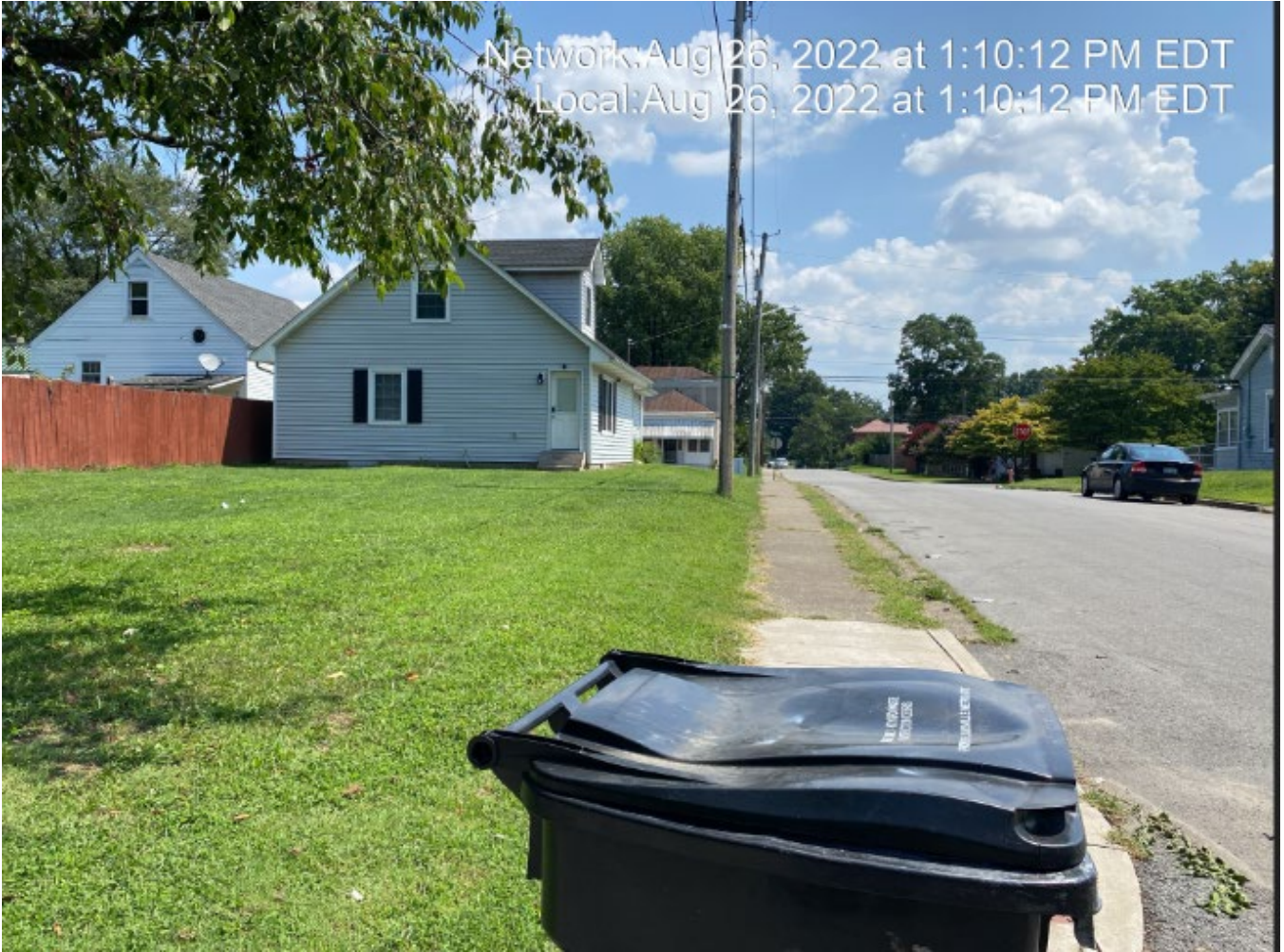
View of variance area from alley and up Camden Ave

Network: Aug 26, 2022 at 1:10:12 PM EDT Local: Aug 26, 2022 at 1:10:12 PM EDT