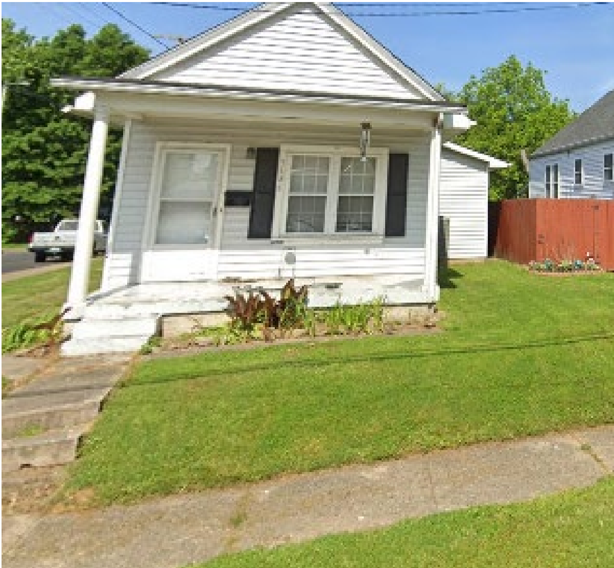
Front of subject property.