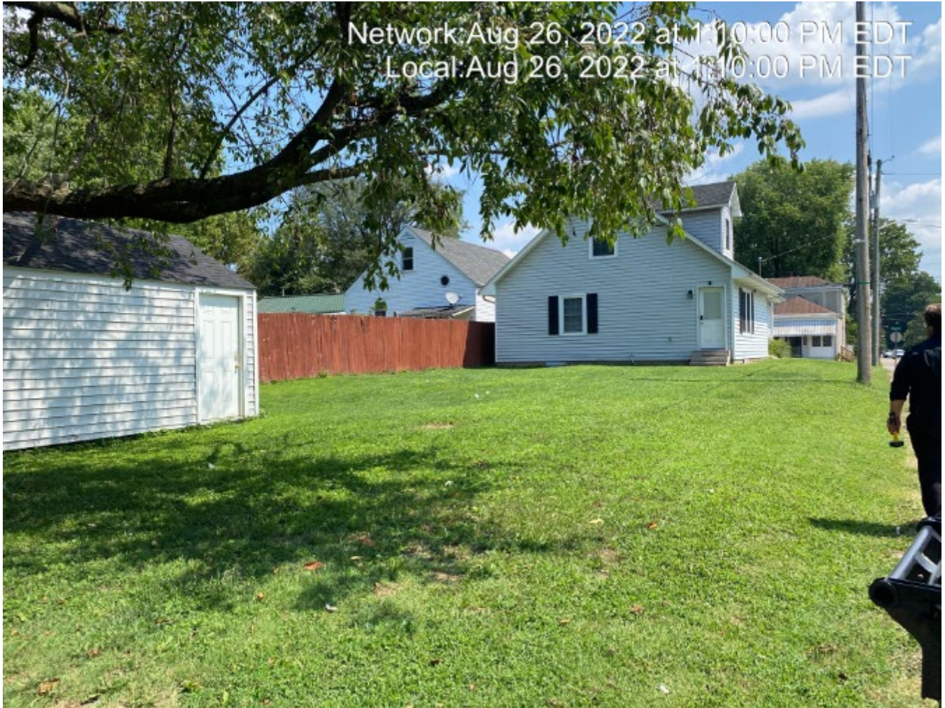
View from Alleyway