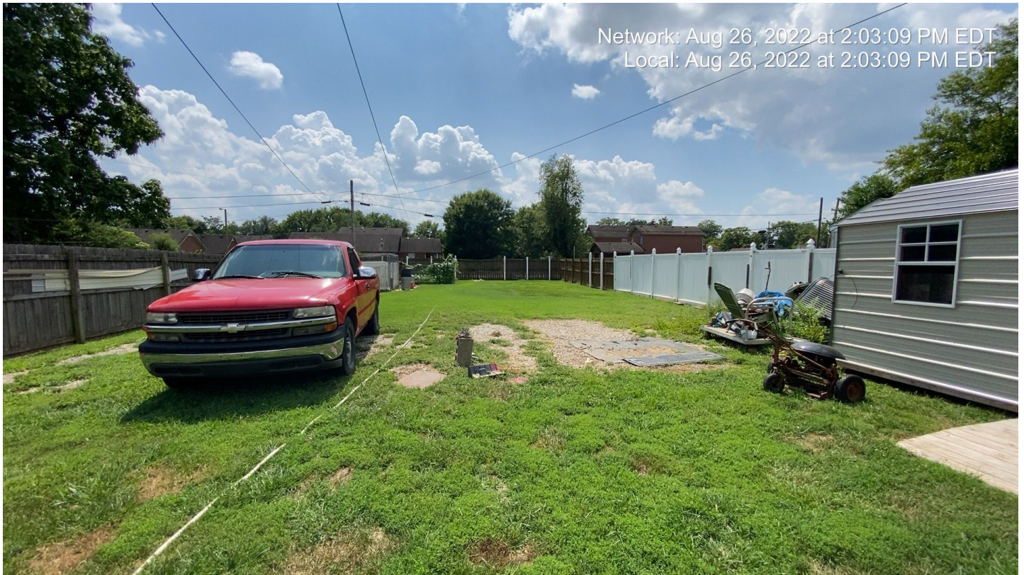
Rear yard and variance area.