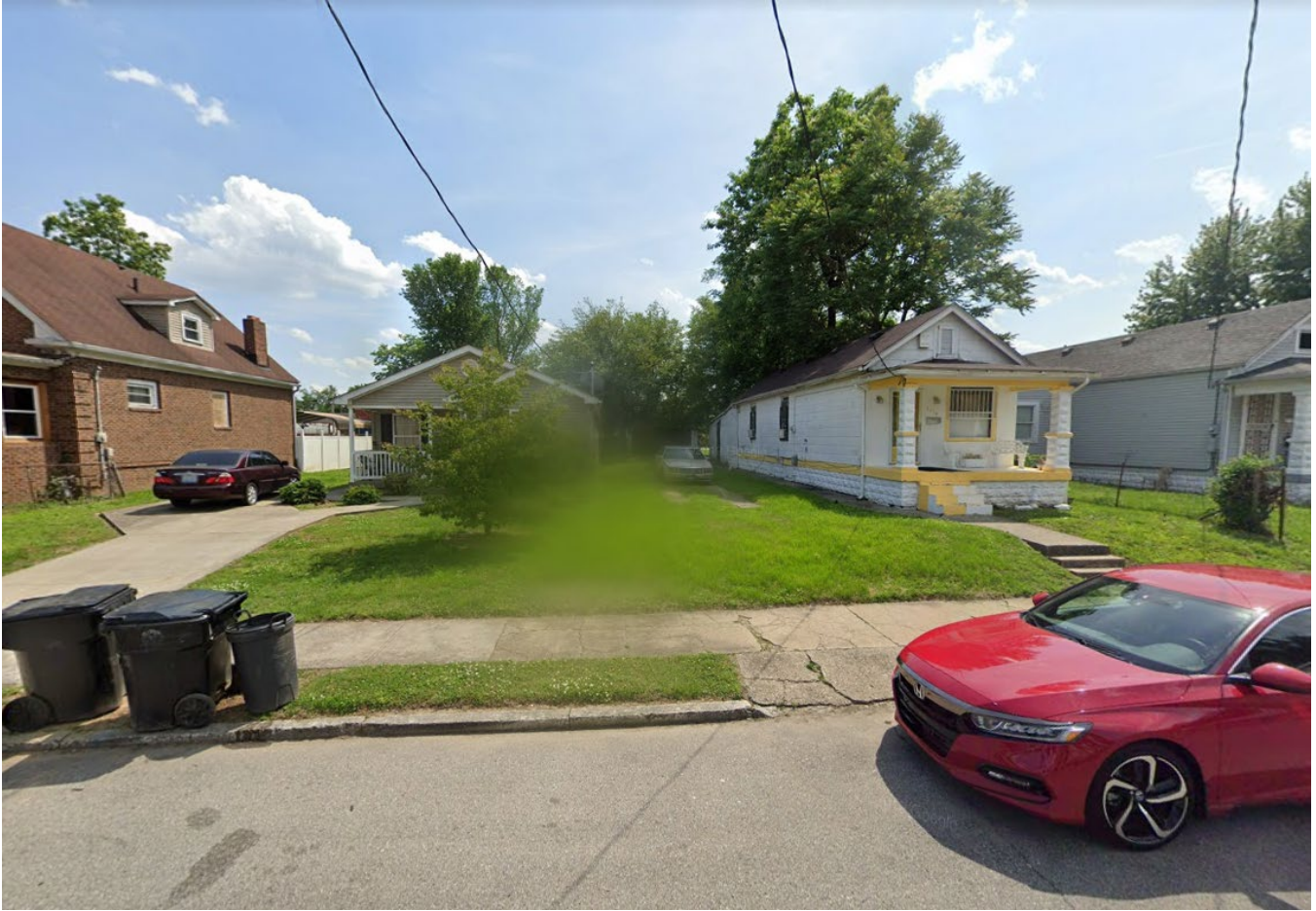
Right of subject property, Google 2019.