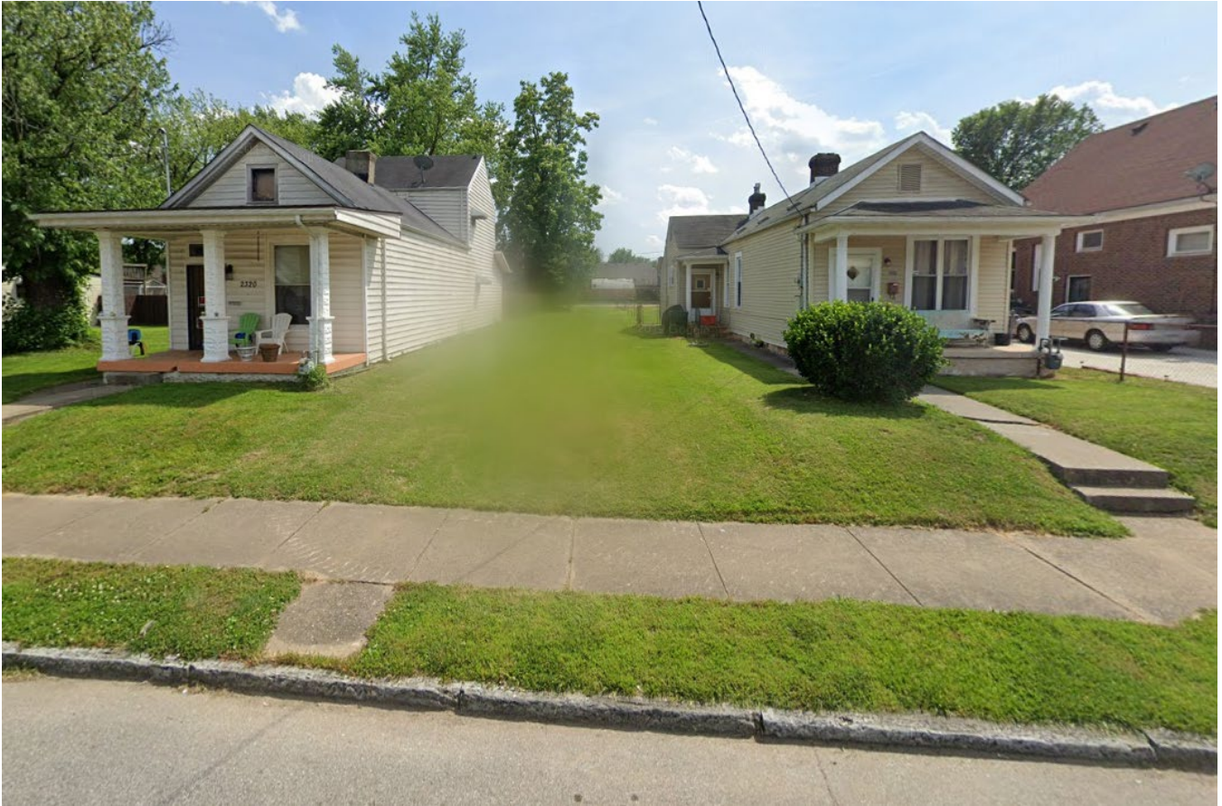
Left of subject property, Google 2019.