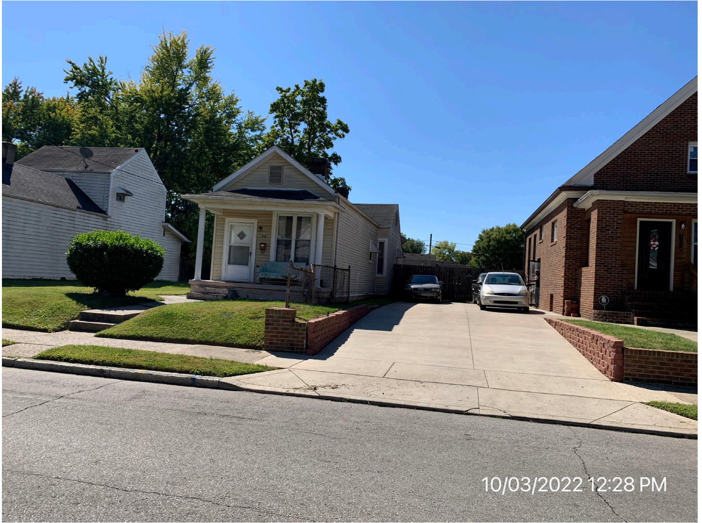
Existing driveway off Woodland Ave.