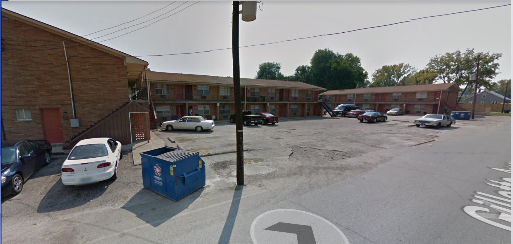
Looking south across Gillette Avenue (multi-family)