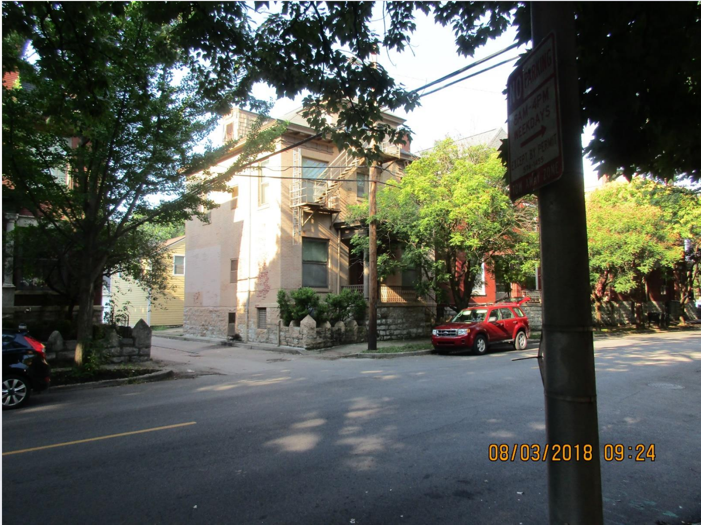
Adjacent to West