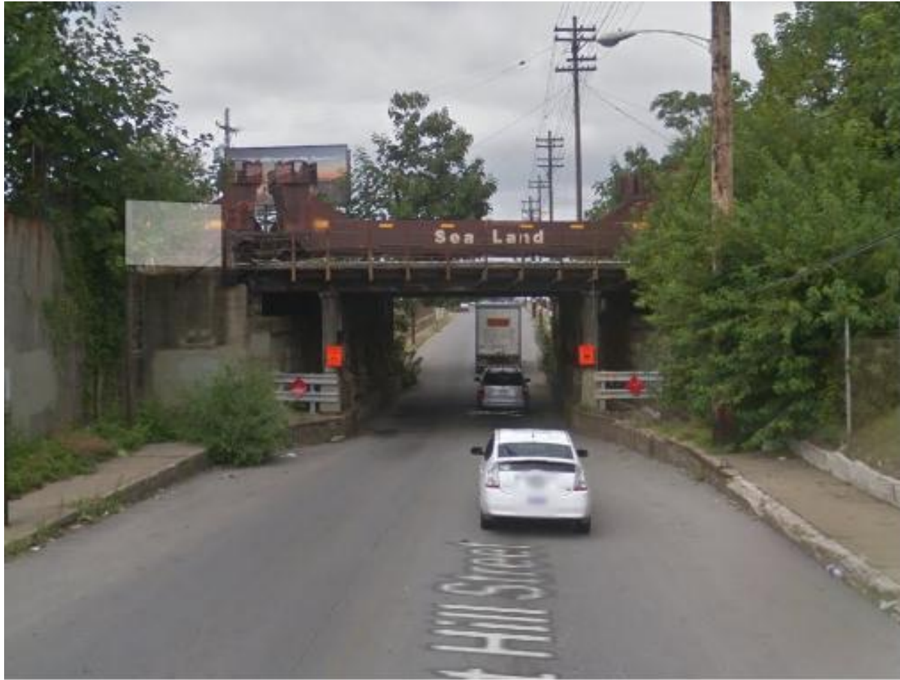
West Hill Street looking toward South 7 th Street