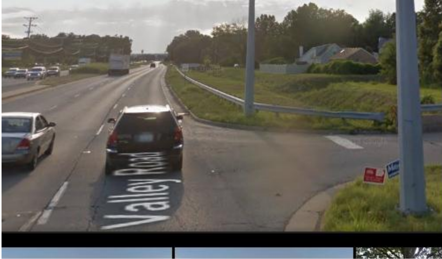
Fern Valley Road (Looking West)