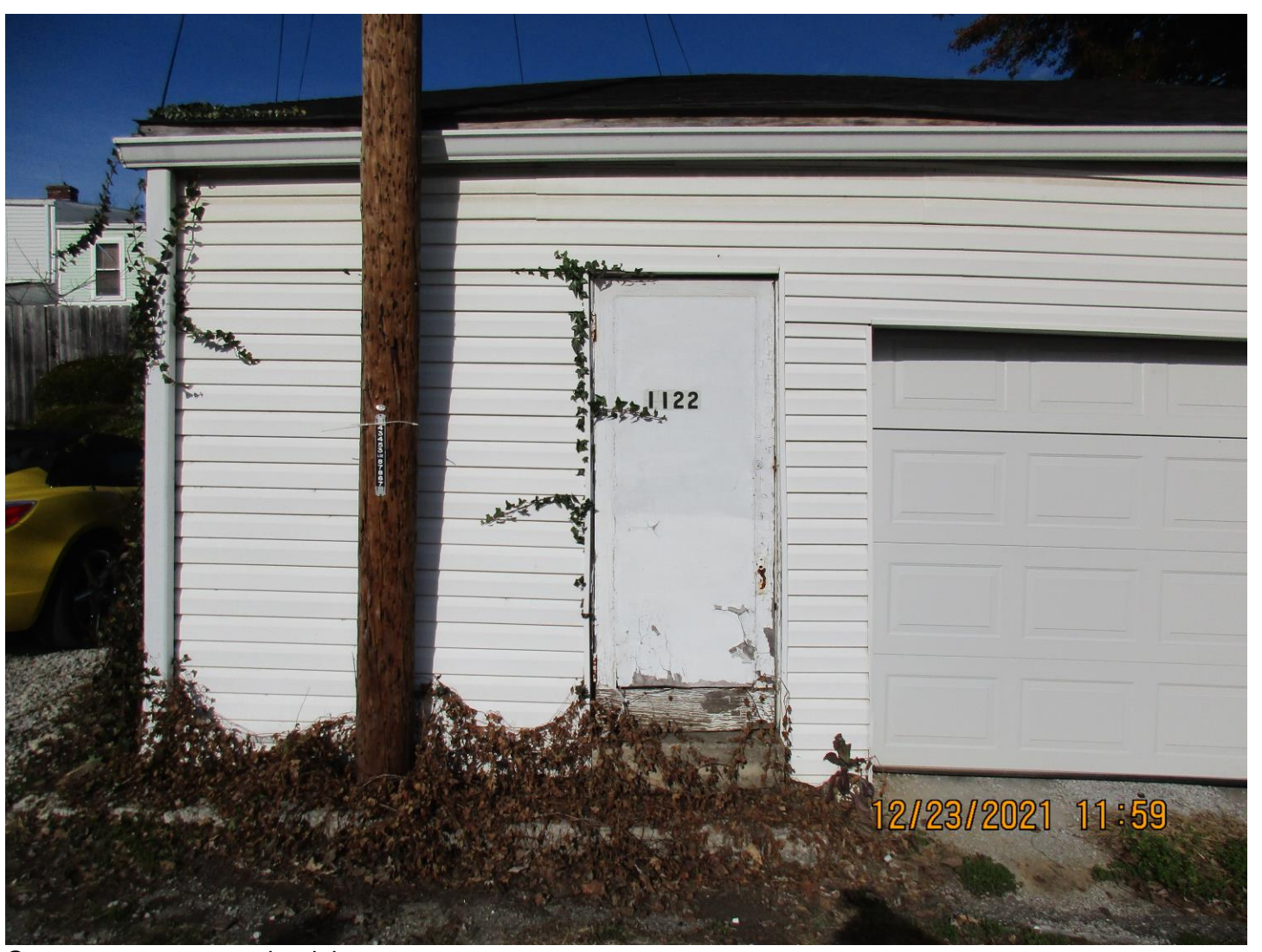
Garage on property to the right.