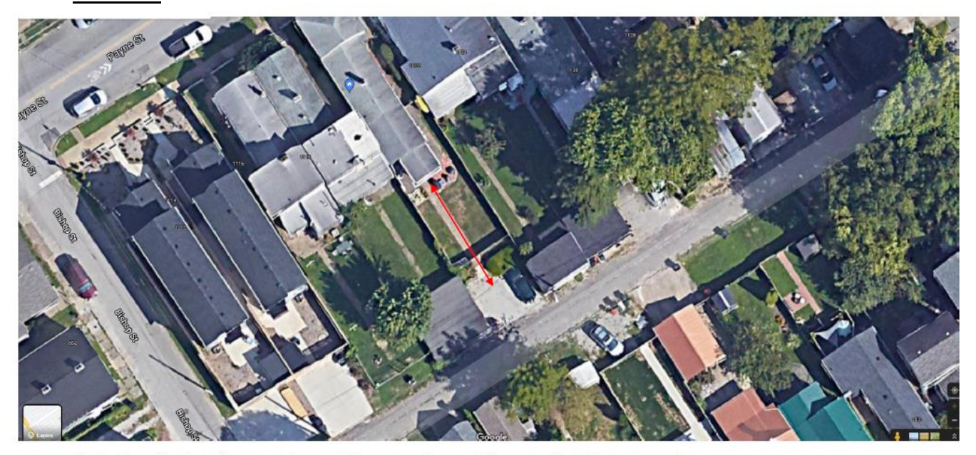
Distance from edge of back porch to start of projected location of carport (designated by red arrow) is 45 feet.