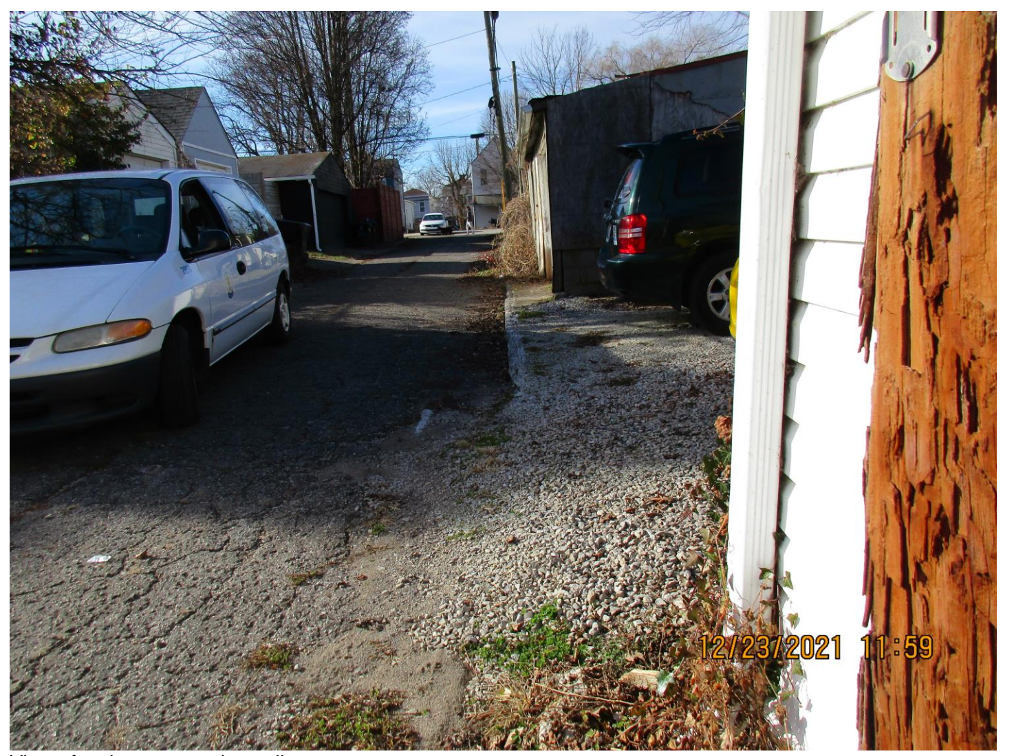
View of variance area along alley.