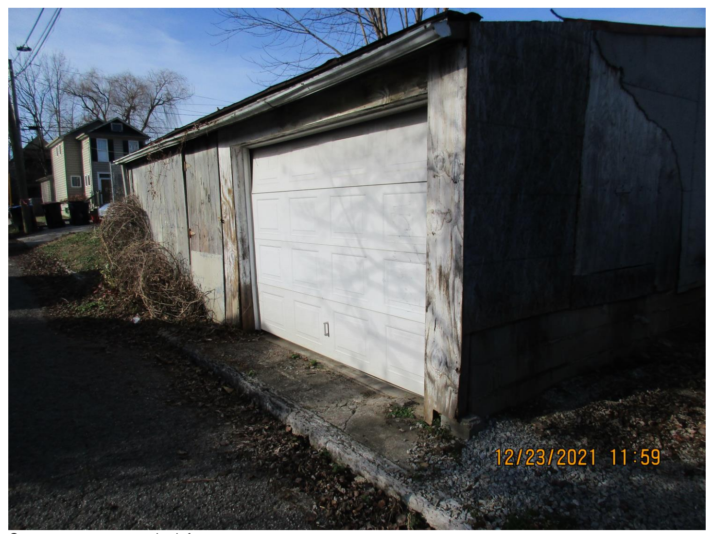
Garage on property to the left.