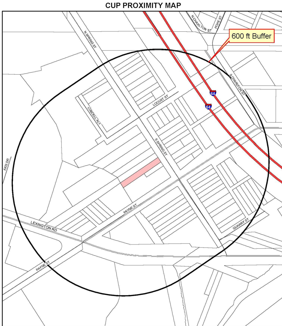
Case #22-CUP-0088 Map Created: 05/05/2022