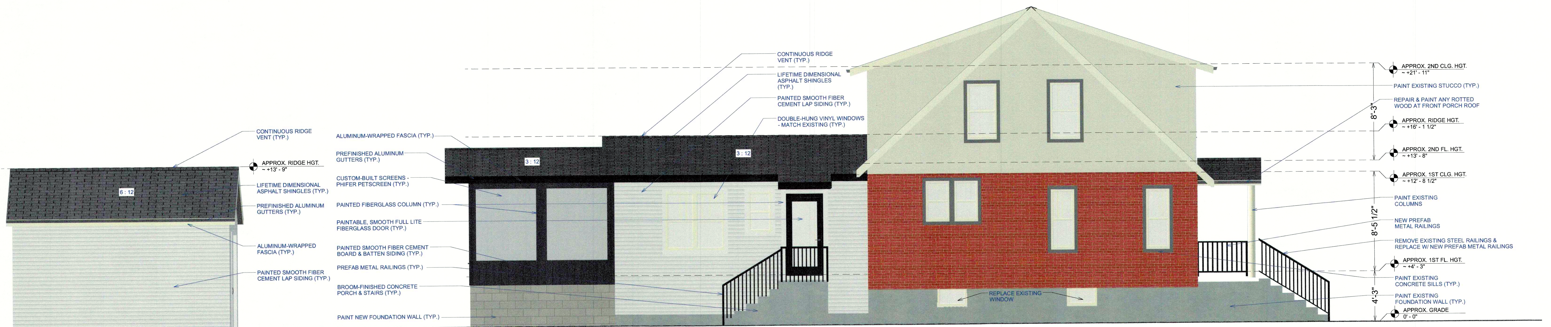
PROPOSED NORTHEAST-FACING EXTERIOR ELEVATION