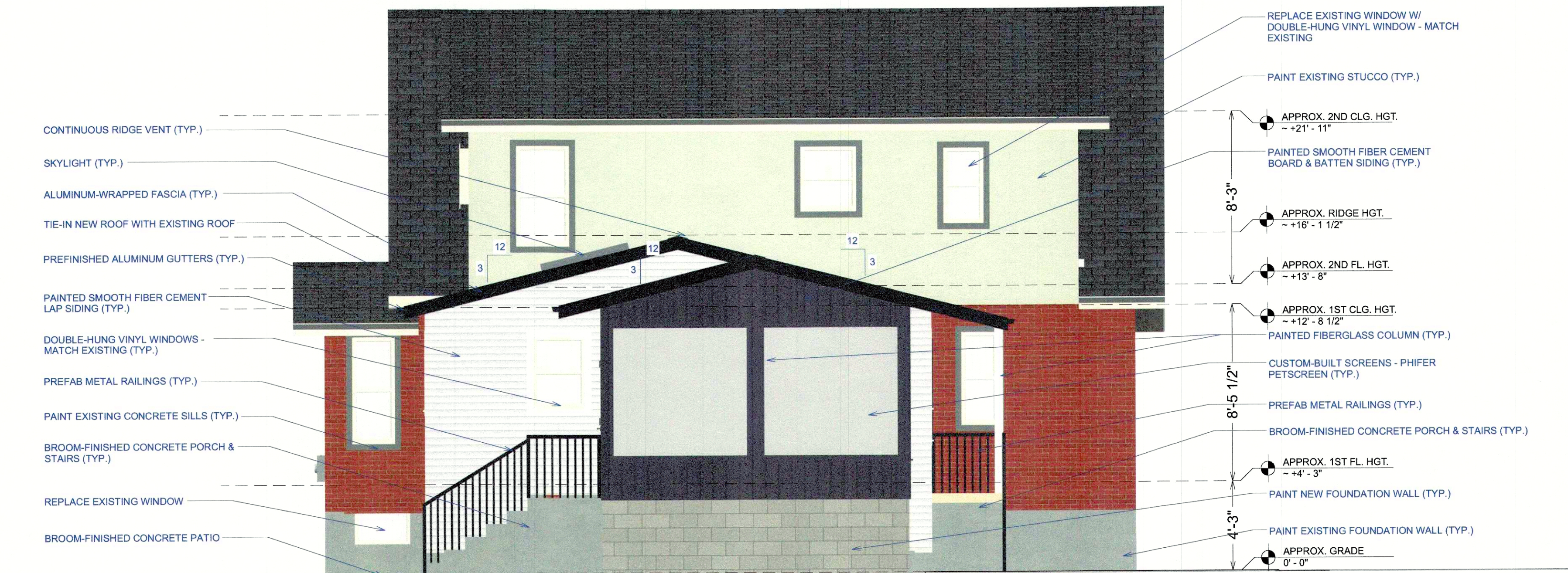
PROPOSED SOUTHEAST-FACING EXTERIOR ELEVATION