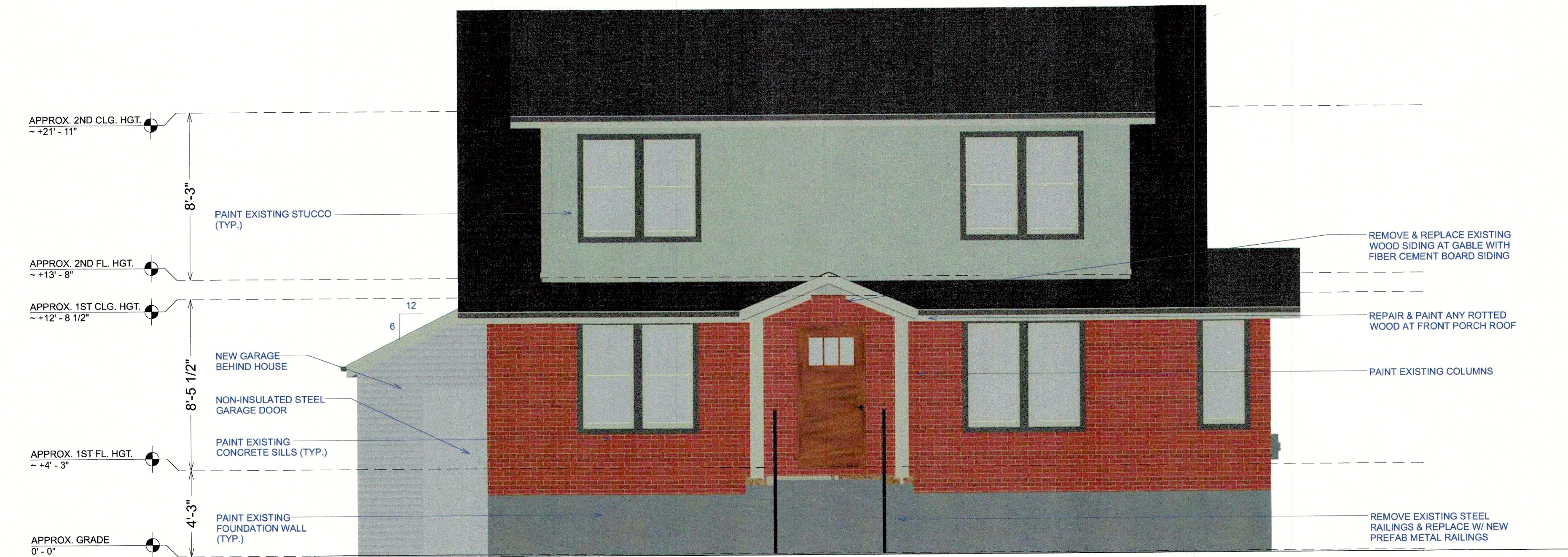
PROPOSED NORTHWEST-FACING EXTERIOR ELEVATION