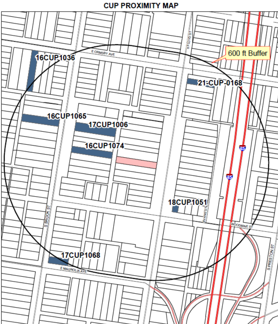
Case #22-CUP-0053 Map Created: 06/02/2022