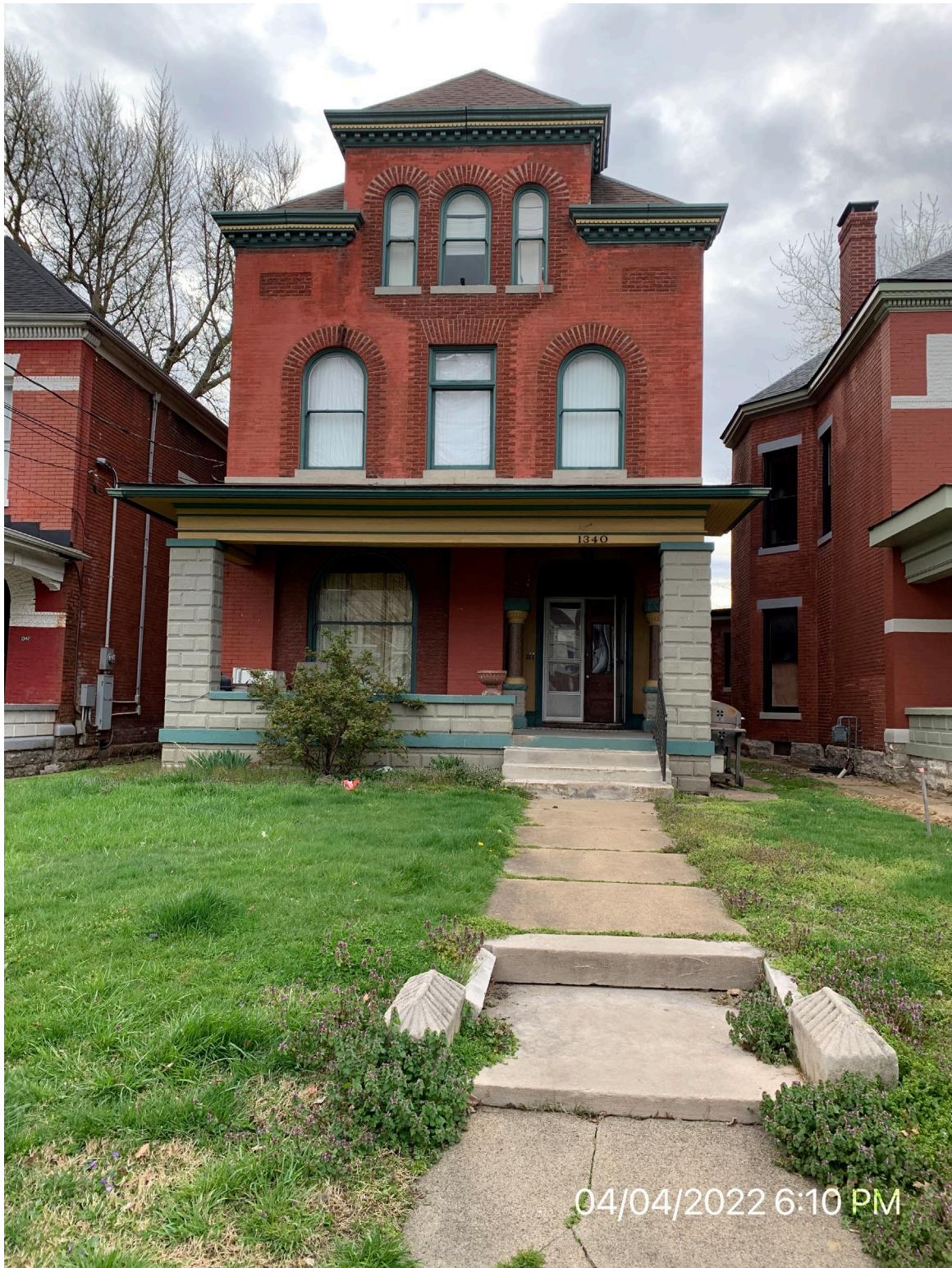
Property to the left.