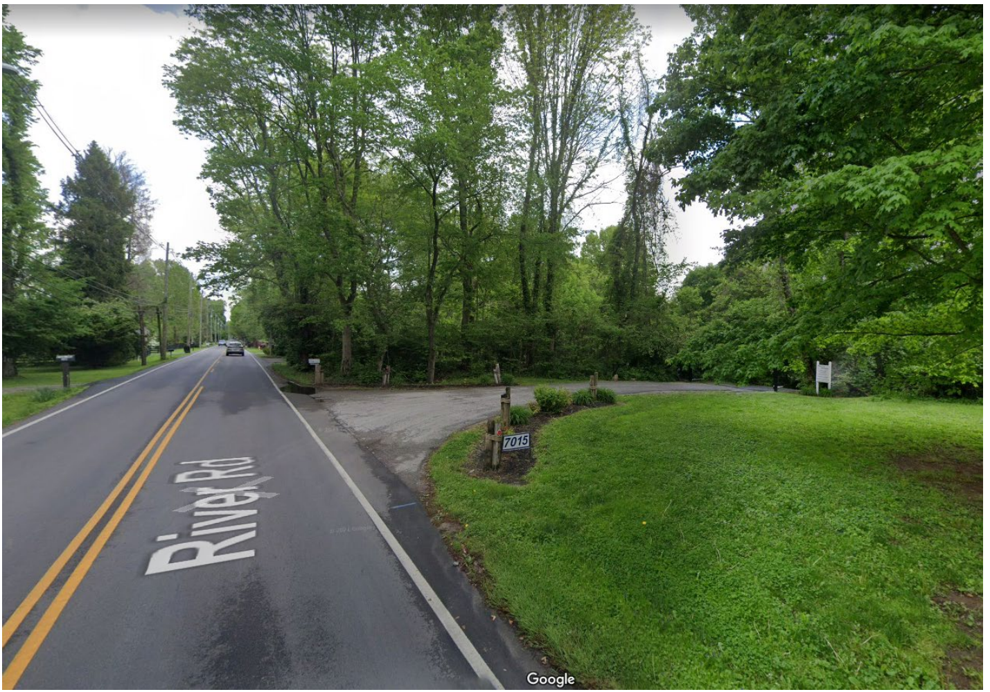
To the left of subject property, Google 2021.