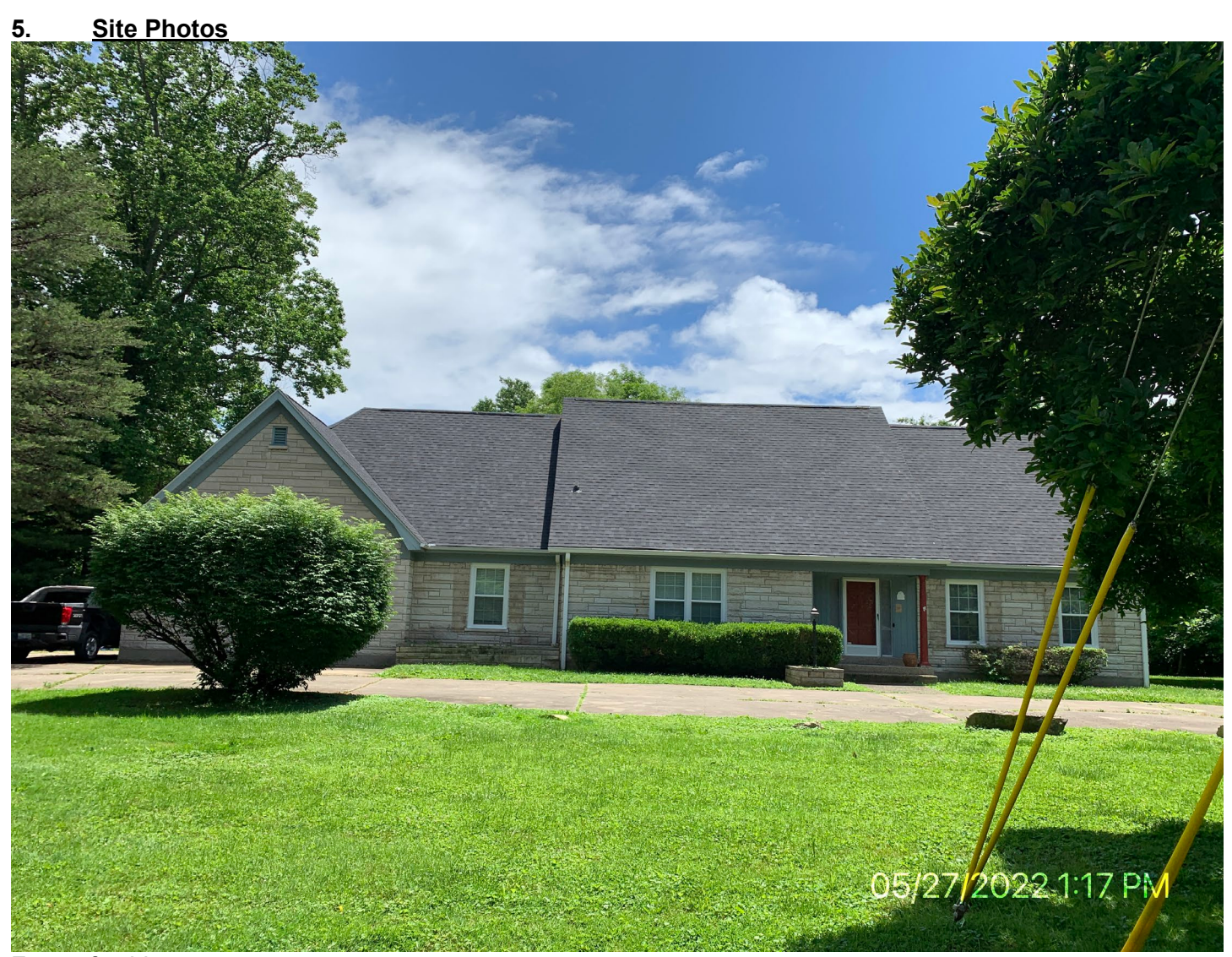
Front of subject property.