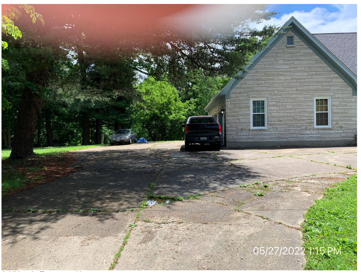
Additional off street parking.