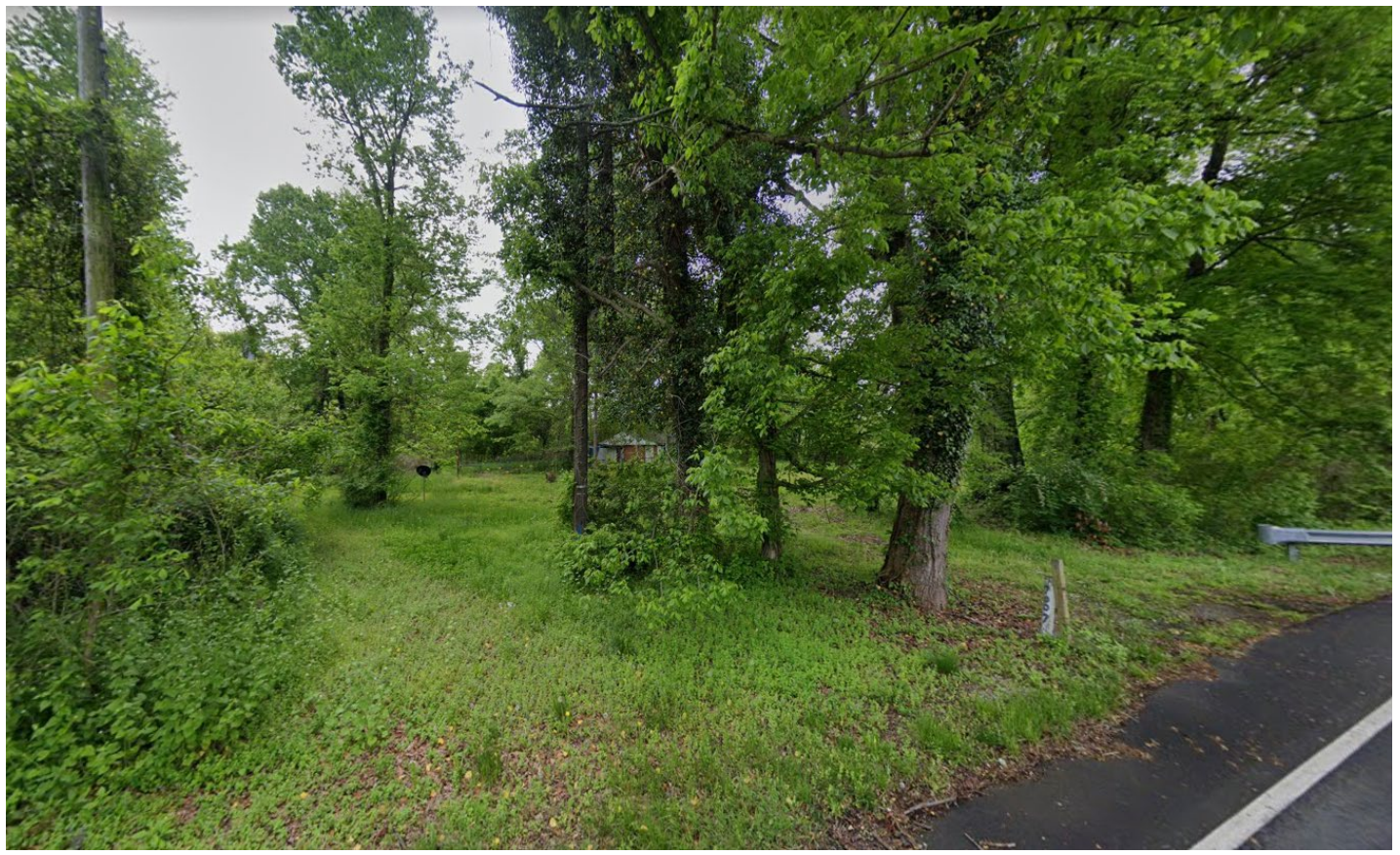
To the right of subject property, Google 2021.