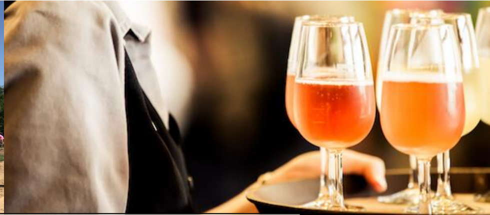
Licenses & Permitting