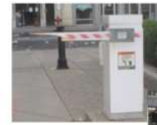
Metro Hall & Annex