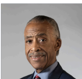
Rev. Dr. Al Sharpton Founder and President, National Action Network (NAN)