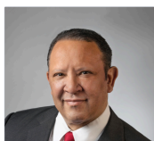
Marc H. Morial President and CEO, National Urban League

Our External Diversity & Inclusion Committee is composed of national civic and business leaders who help us understand the critical needs of the diverse communities we serve and how to implement our programs to make a positive impact.