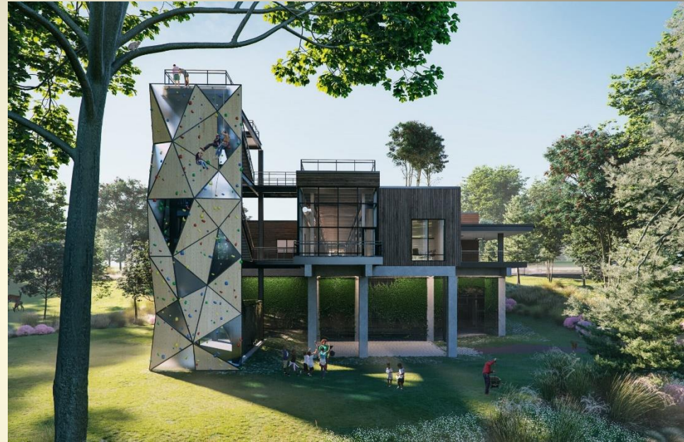
Rendering of the future Shawnee Outdoor Learning Center

Petersburg Park Tennis Lighting: $180,000 Petersburg Park Skate Park: $140,000 Southwick Community Center Roof: $200,000 Russell Lee Park Pickleball/Tennis Courts: $200,000 Hays Kennedy Park Cricket Pitch Improvements: $50,000 Champions Park Disc Golf Course: $30,000 Shawnee Outdoor Learning Center funding: $2.5 million Aquatics: $2.5 million (for comprehensive study and implementation of study results) Total capital budget (est.): $5.8 million