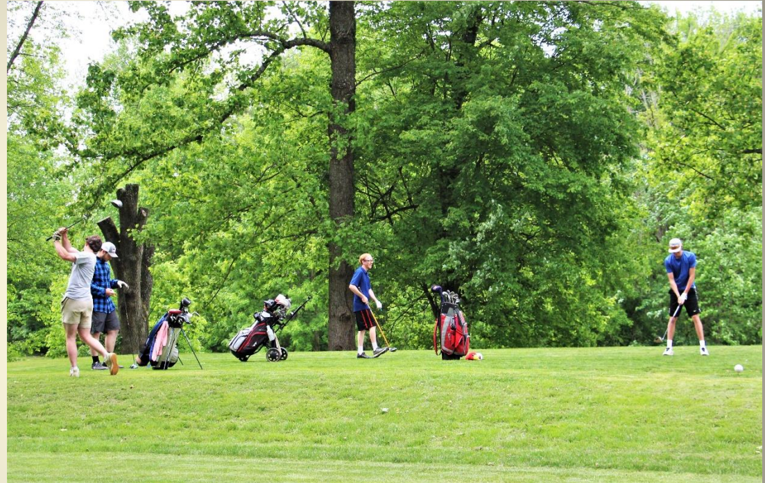
Bobby Nichols Golf Course