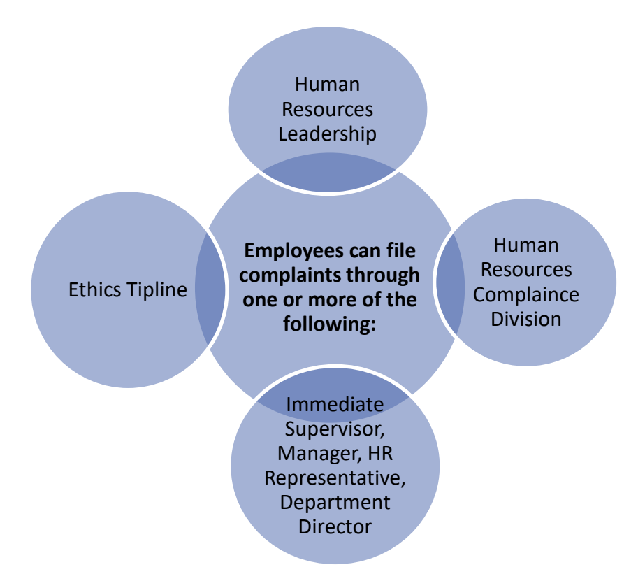
Illustration 1: Methods for Filing Employee Complaints

The Compliance Division of HR employs two investigators that are responsible for performing EEO investigations. Louisville Metro Government employs over 5,000 employees across 24 departments, of which, approximately 1,700 are non-union employees, and any EEO complaints filed by non-union employees would be handled by these two investigators. Due to the size of the workforce and the Compliance Division of HR's resource constraints, a shared responsibility between HR and LMG departments was adopted for investigating employee complaints. According to Louisville Metro Government Standard Operating Procedure 80.02(3), "Complaints that do not claim discrimination based on a protected class, as defined by Louisville Metro Government or applicable federal, state, or local regulations, shall be redirected to the complaining employee's department director or designee to determine the appropriate action and shall not be investigated by the Department of Human Resources." However, the general oversight responsibility ultimately rests with HR.