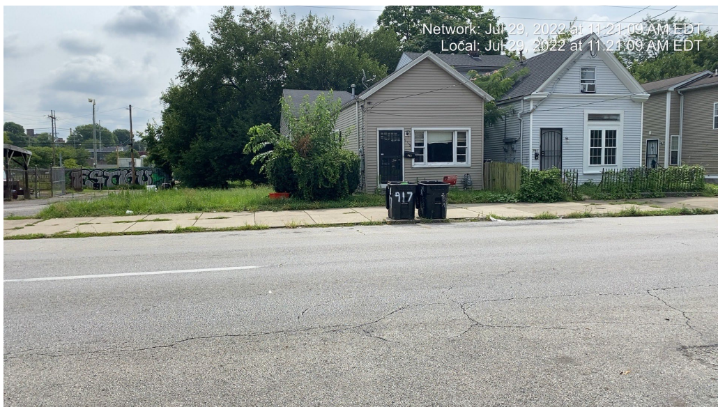
Properties across the street