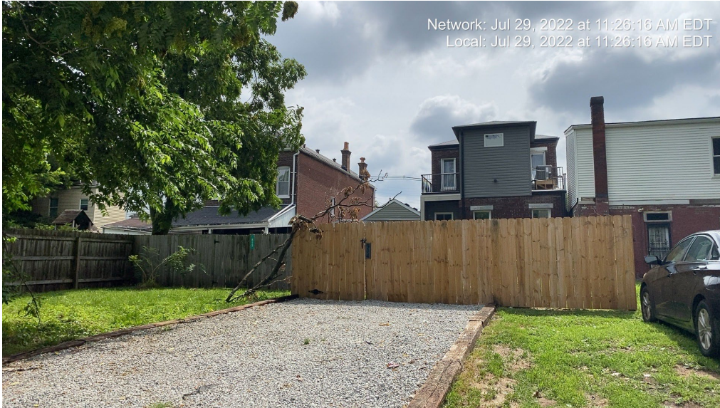
Existing parking pad off the alley