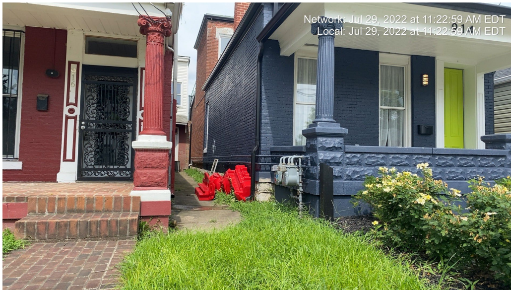
Adjacent property to the Left