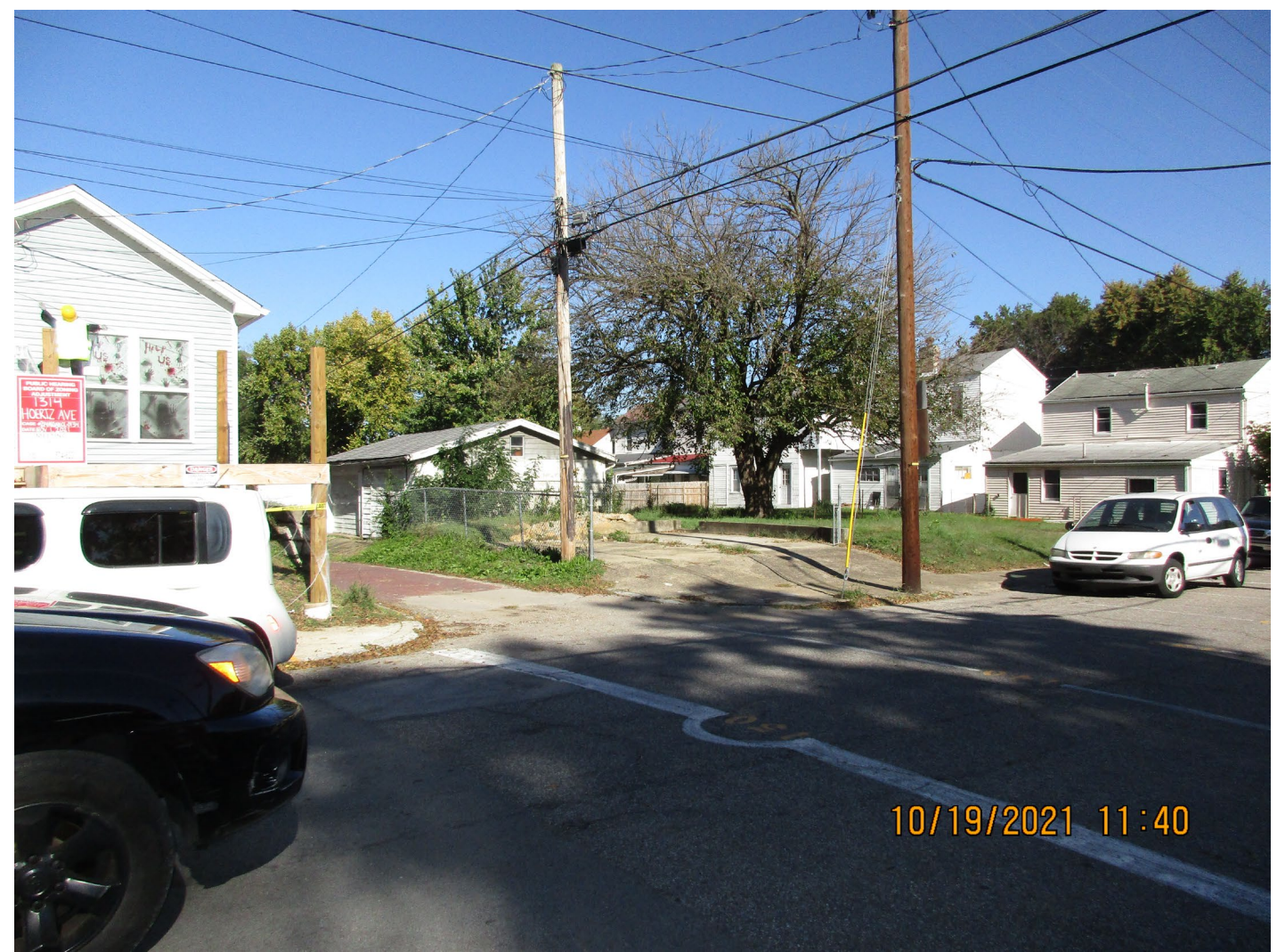
Alley and properties to the right.