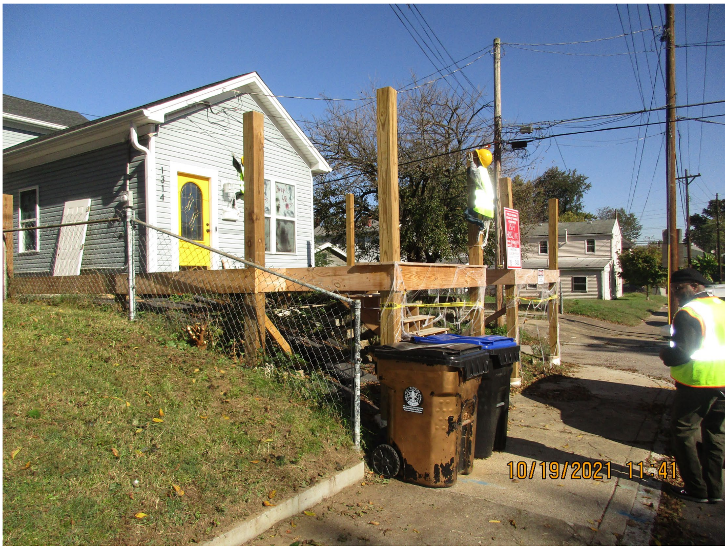
View of deck from Hoertz Ave.