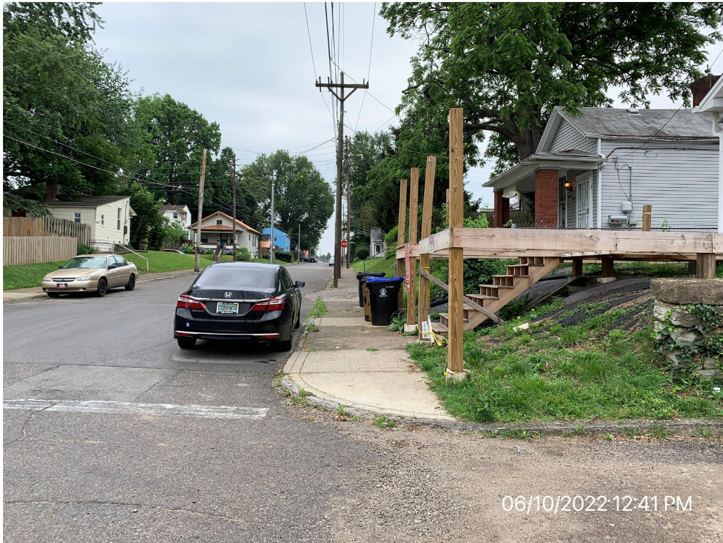
View of deck from intersection of alley and Hoertz Ave.