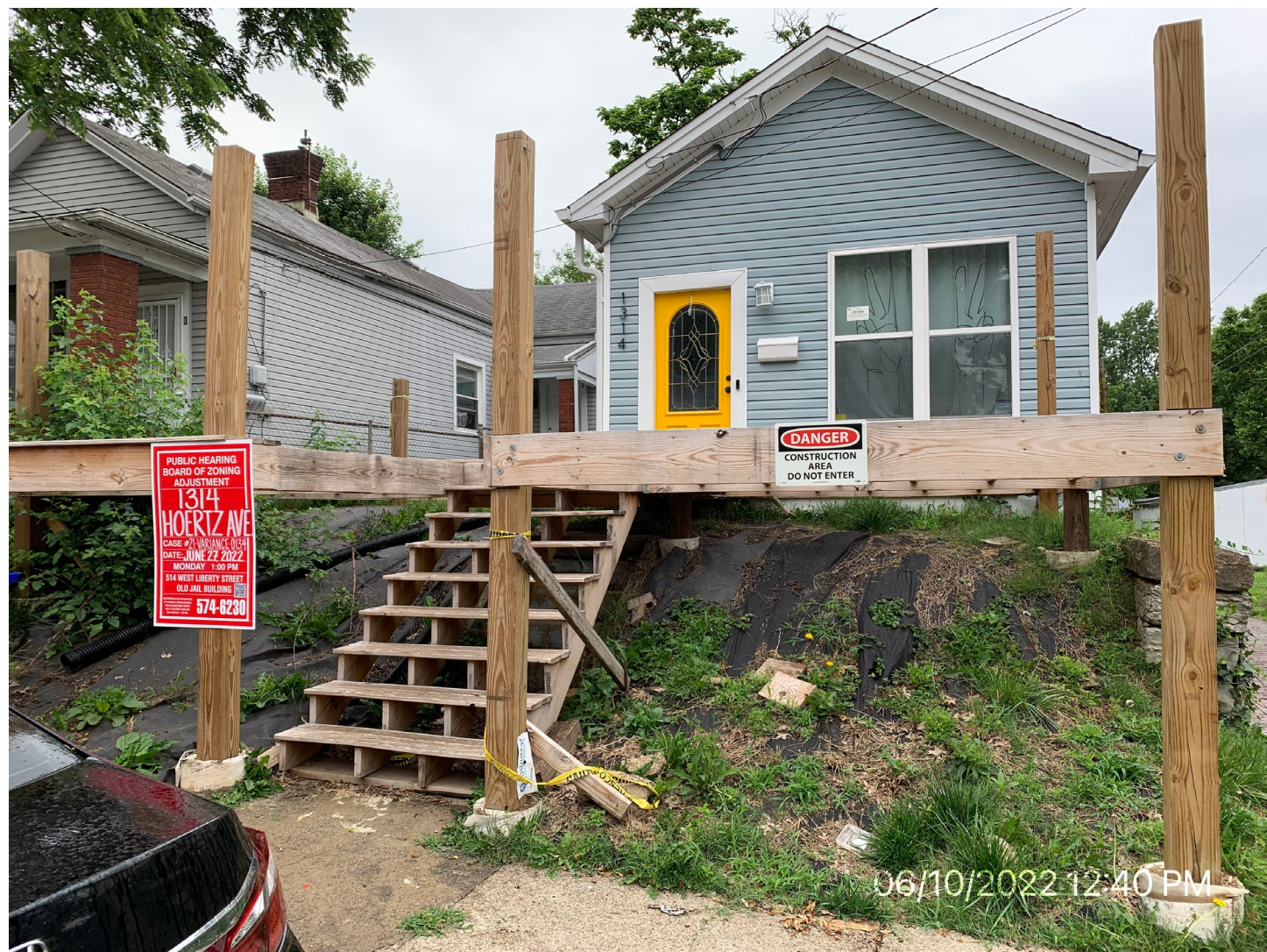
Front of subject property and variance area.