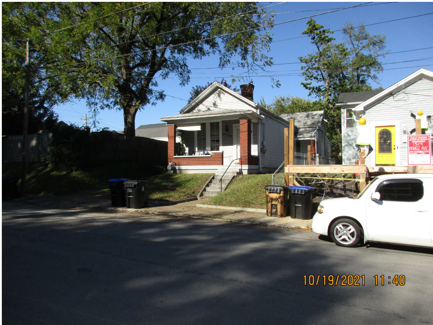
Property to the left.