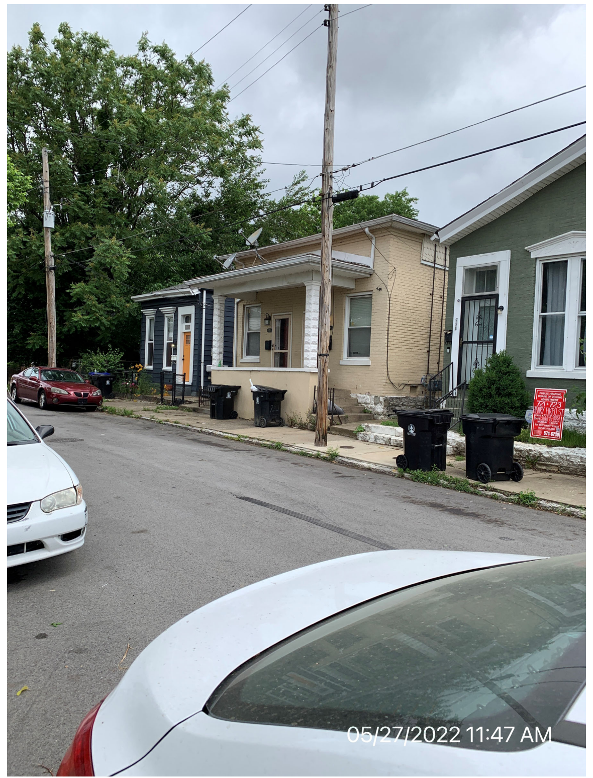
Propertes to the left.