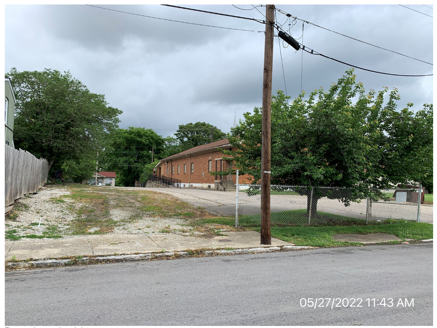
Properties to the right.