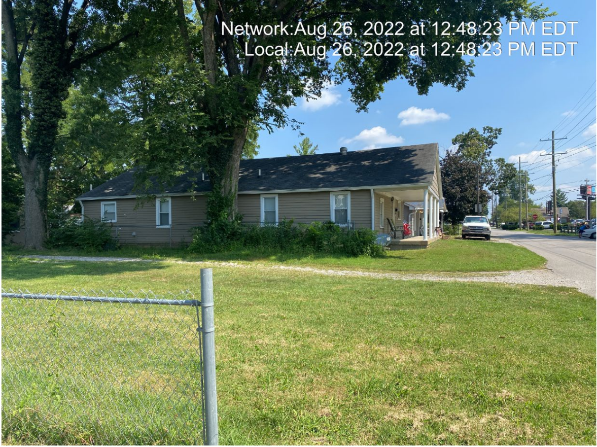
Propety to the right.