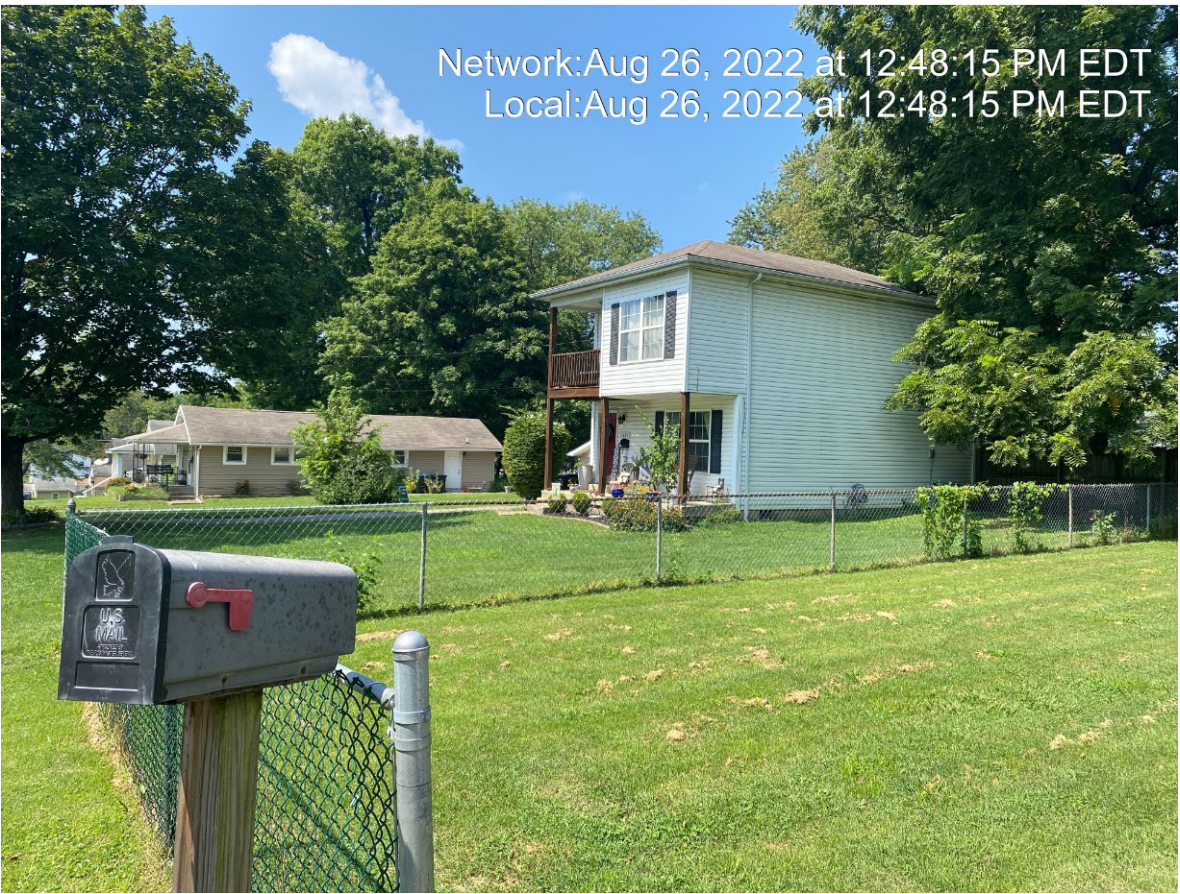
Property to the left.