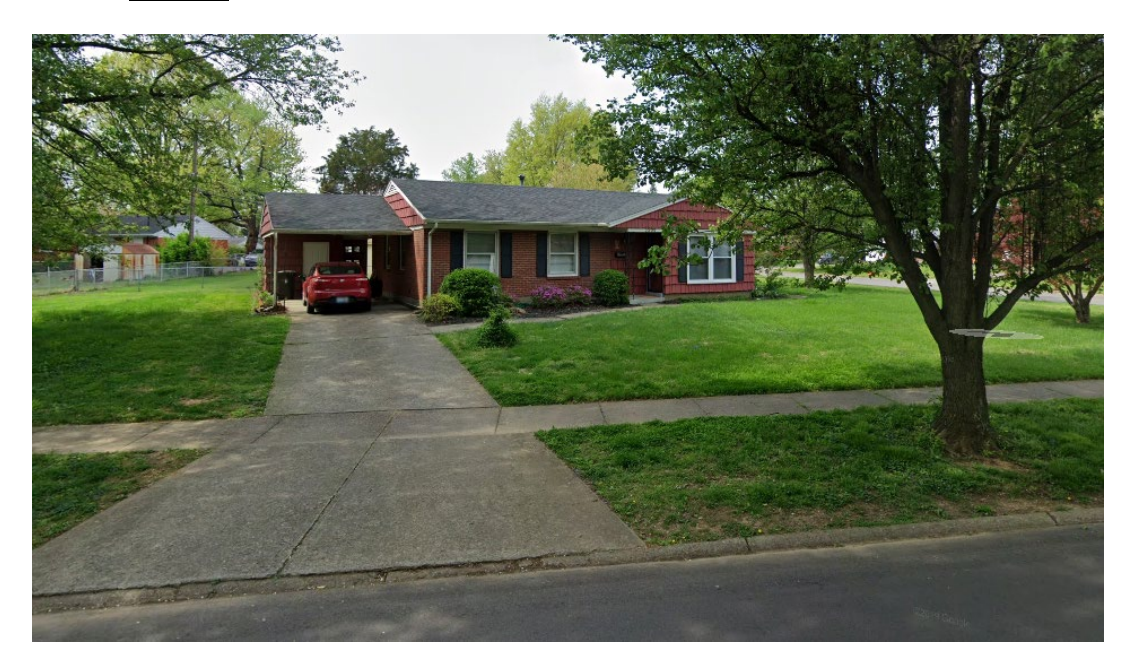
Front of subject property