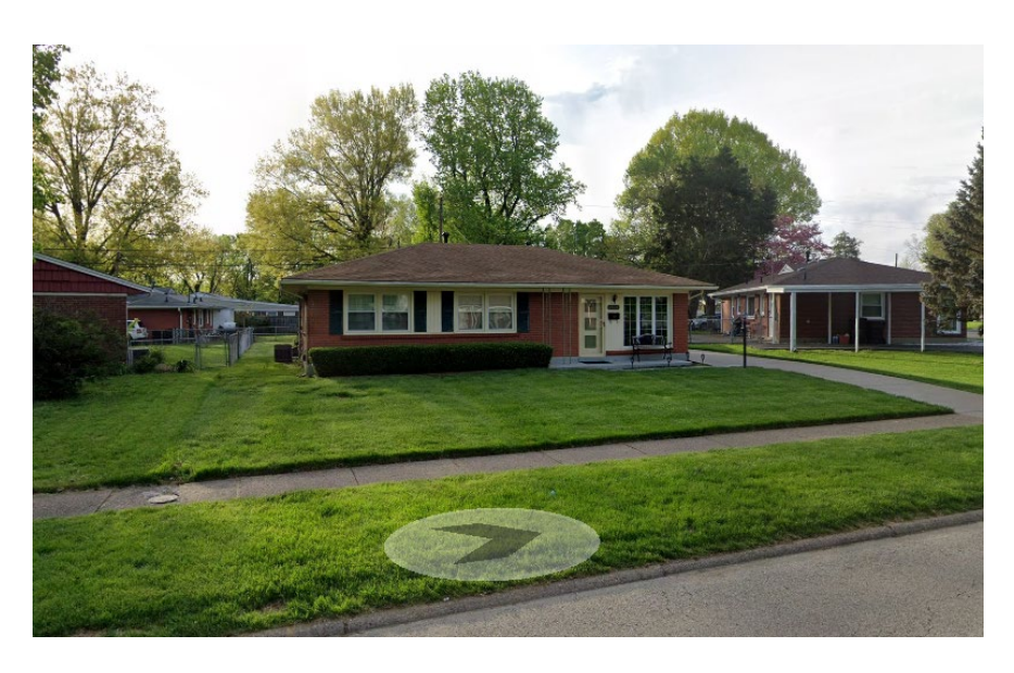
Property to the right (off Meadow Dr.) (Google Street View)