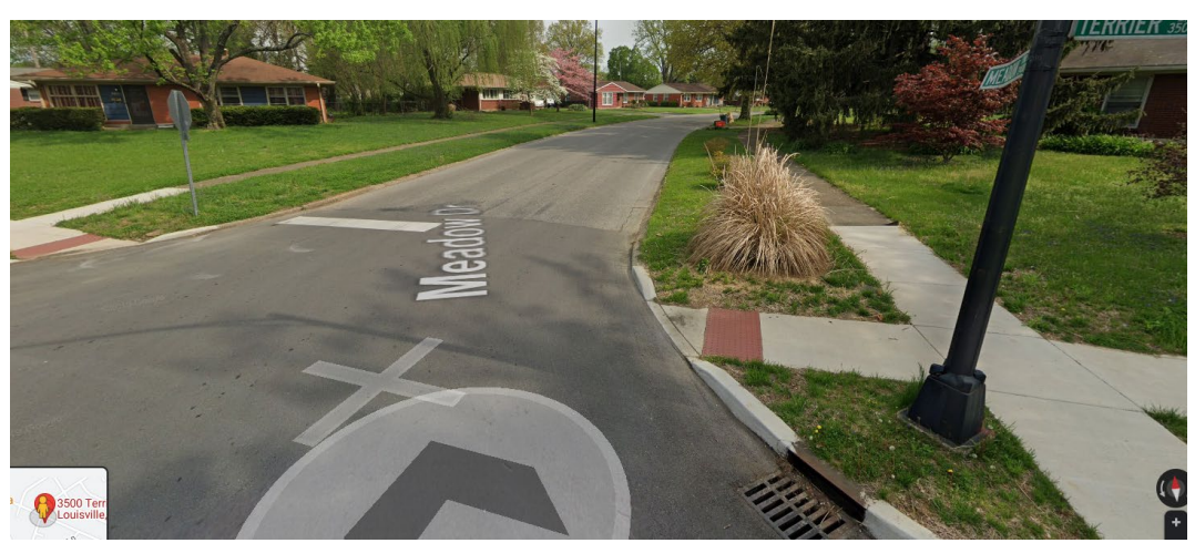
Across the street at the street corner (Google Street View