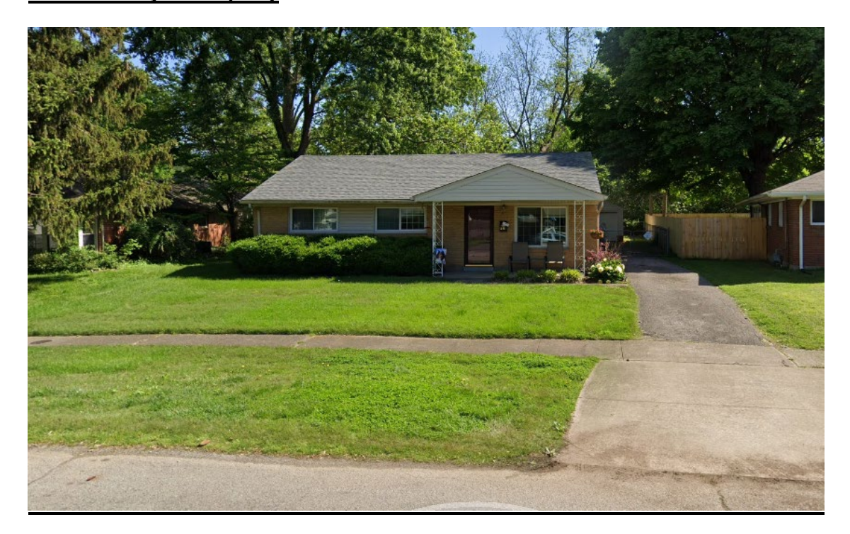
Property to the Left