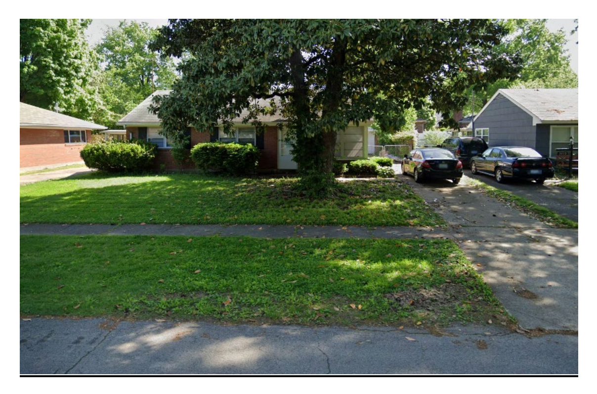
Property to the Right