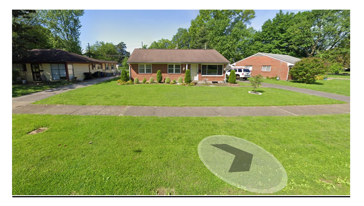
Properties Across the Street