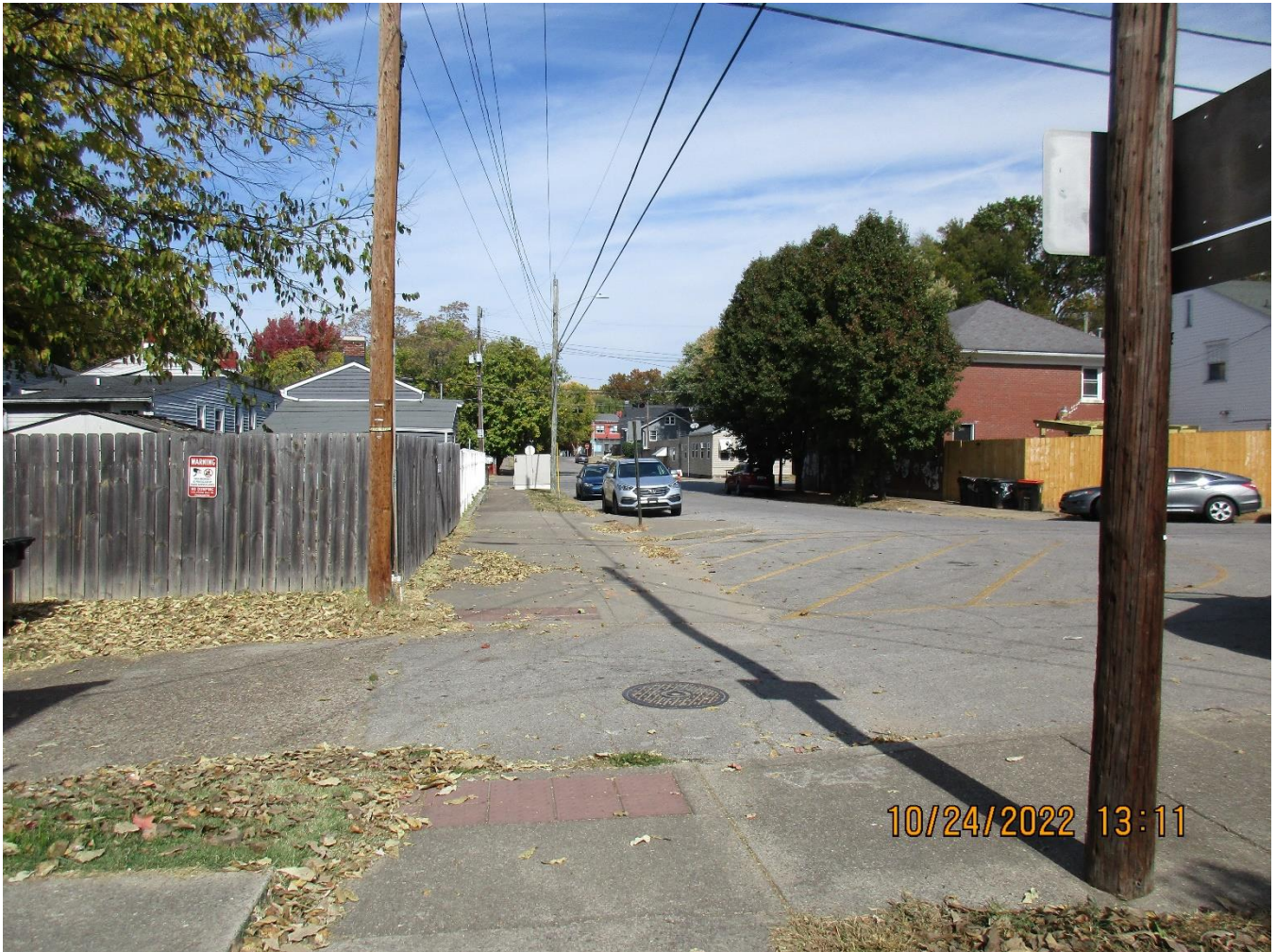
View from subject property looking north on Swan St.