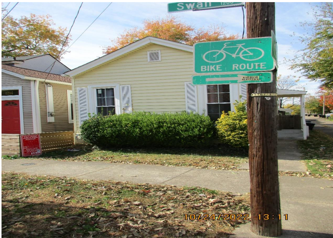
Property to the right of subject site