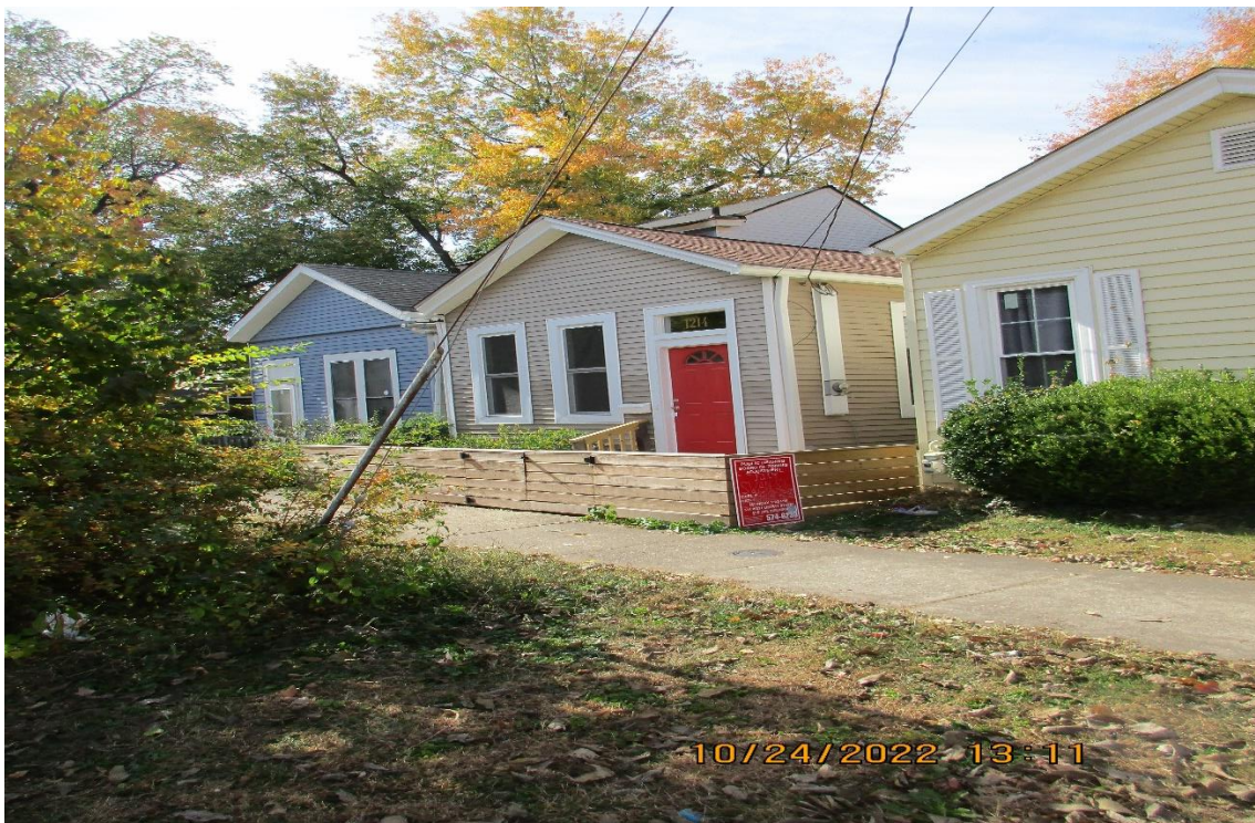
View of subject property from Swan Street