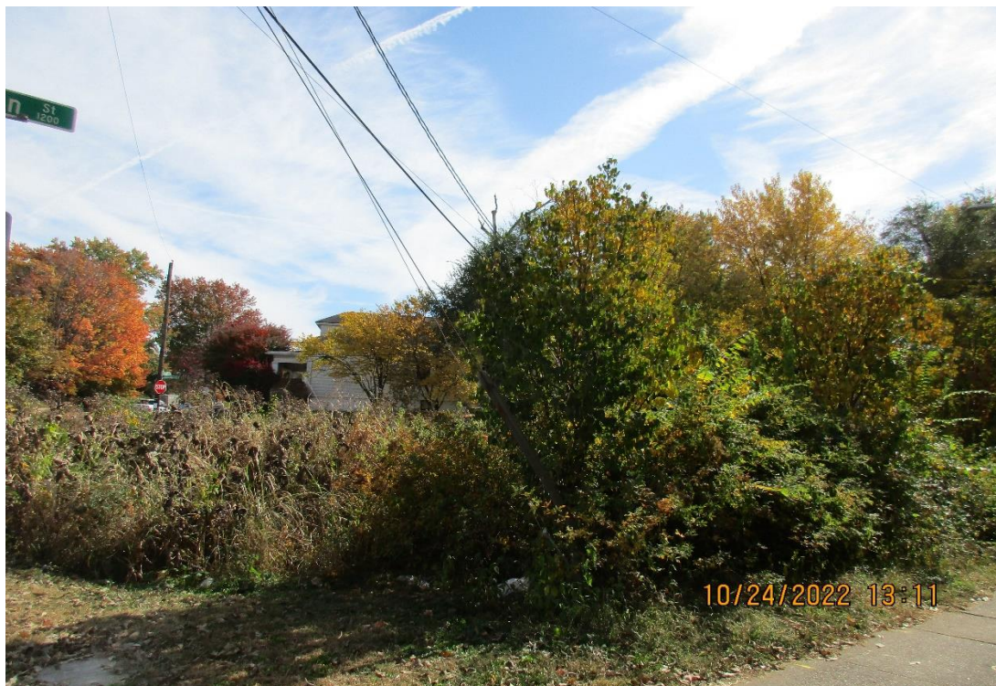
Rain Garden located in front of subject property