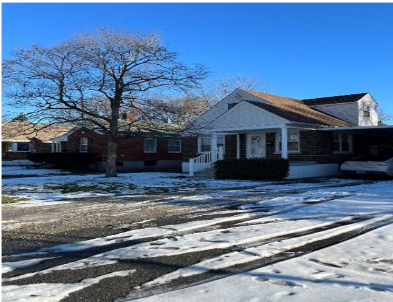
Left of subject property