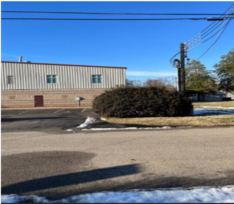
Across street from subject property.