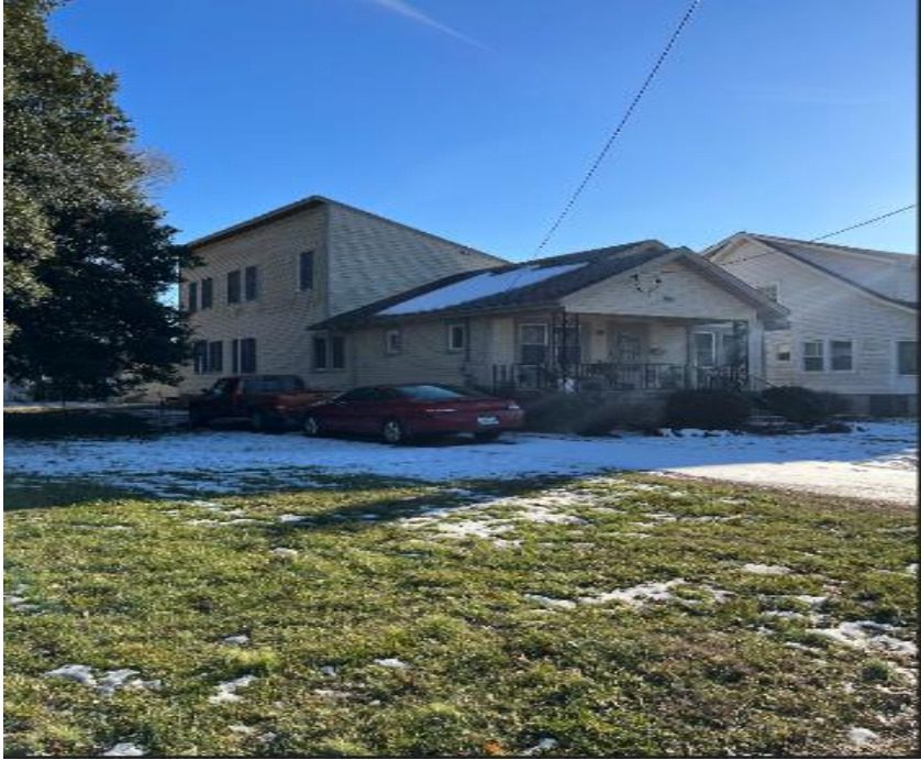
Right of subject property.