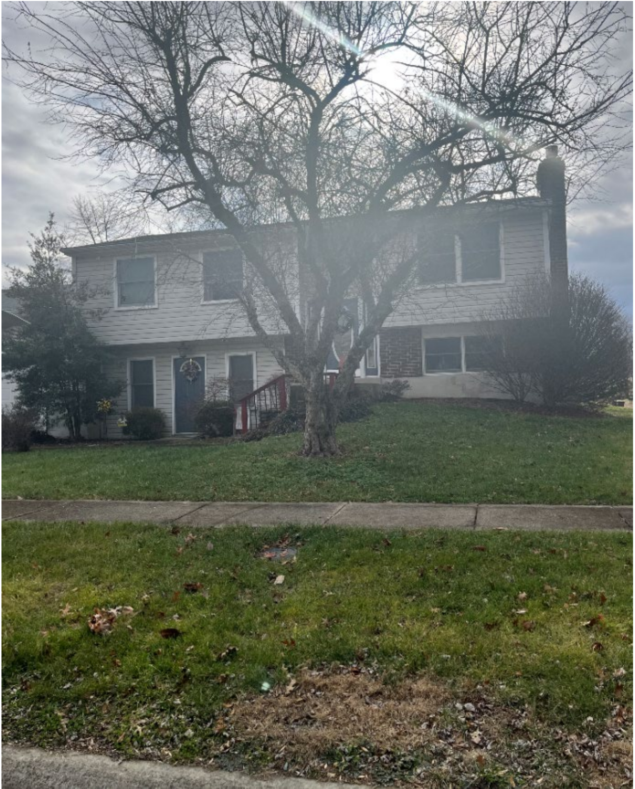
Across Kiki Ct. from subject property.