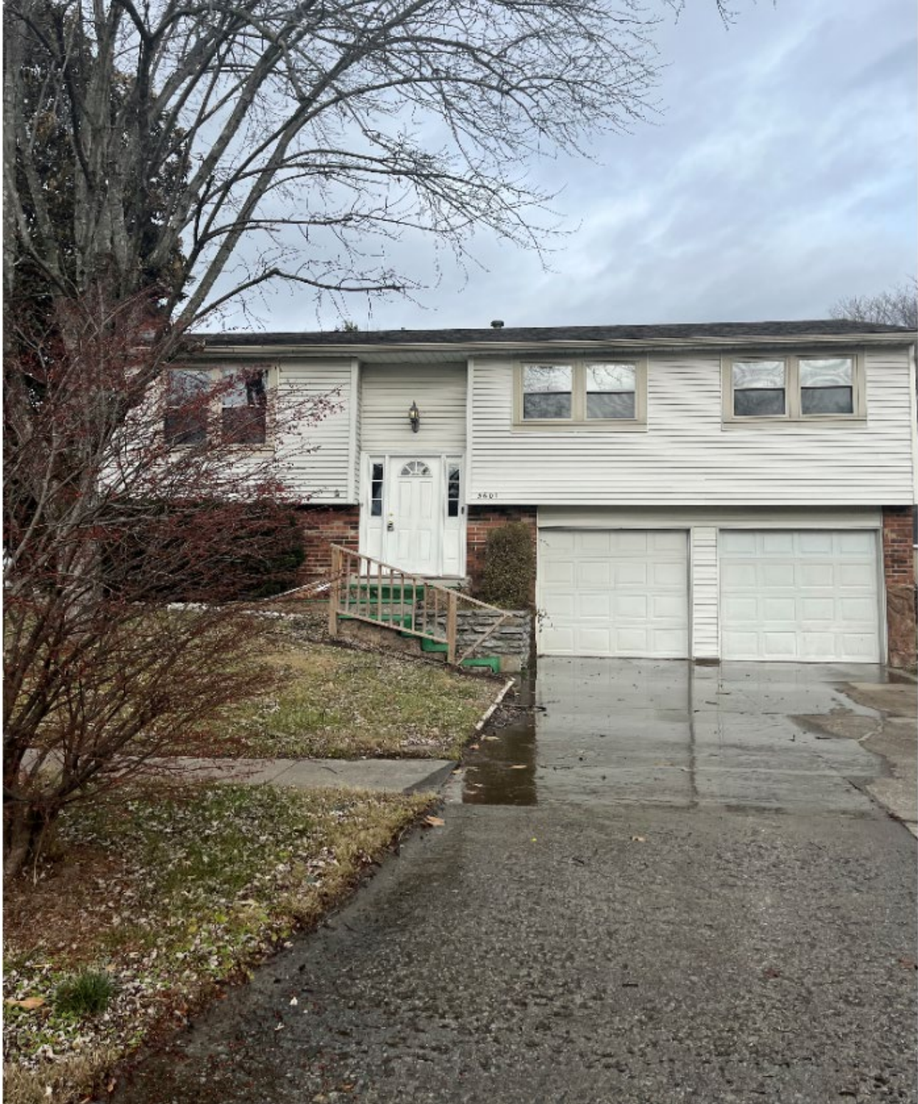
Front of subject property and available off street parking.