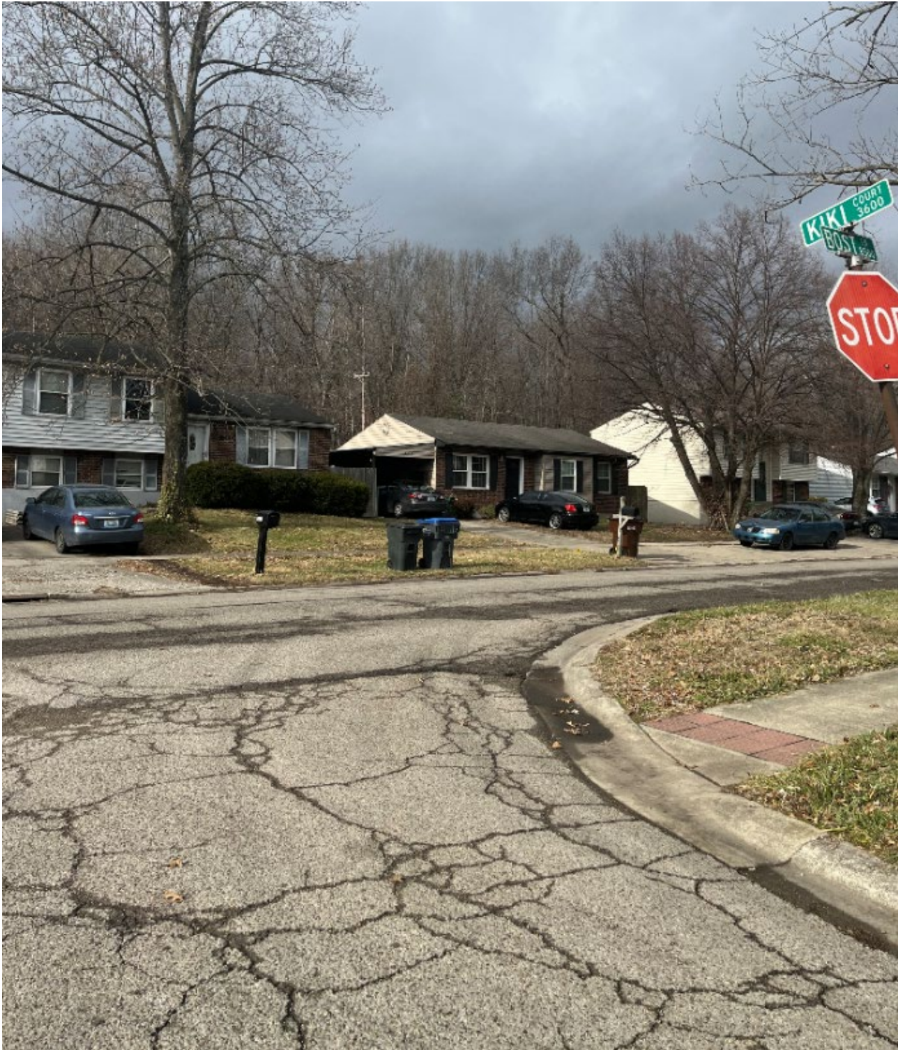
To the left of subject property.