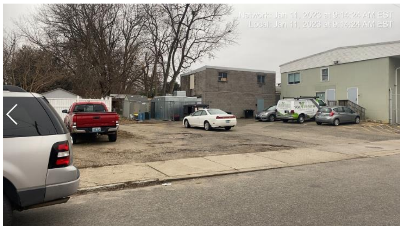
Properties across the street from the subject site.