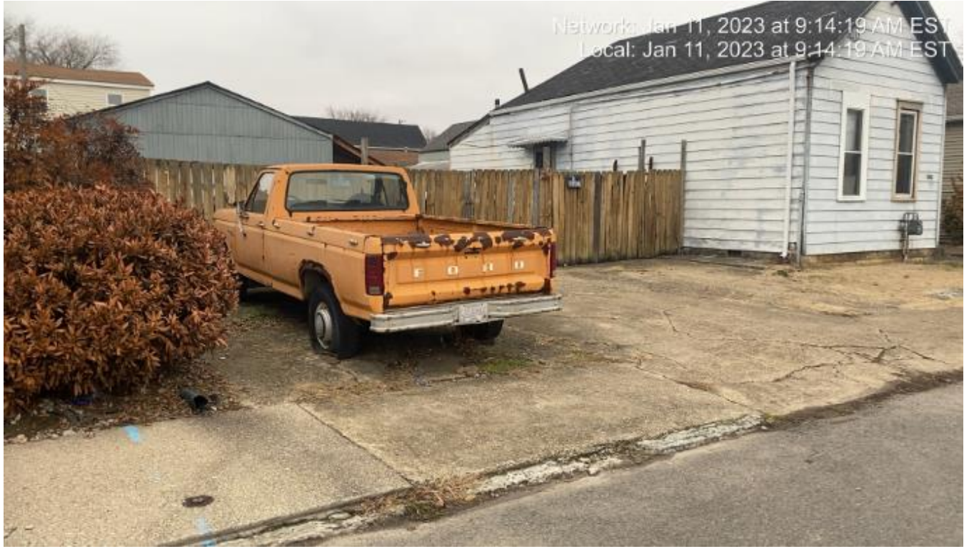
Property to the right of subject site