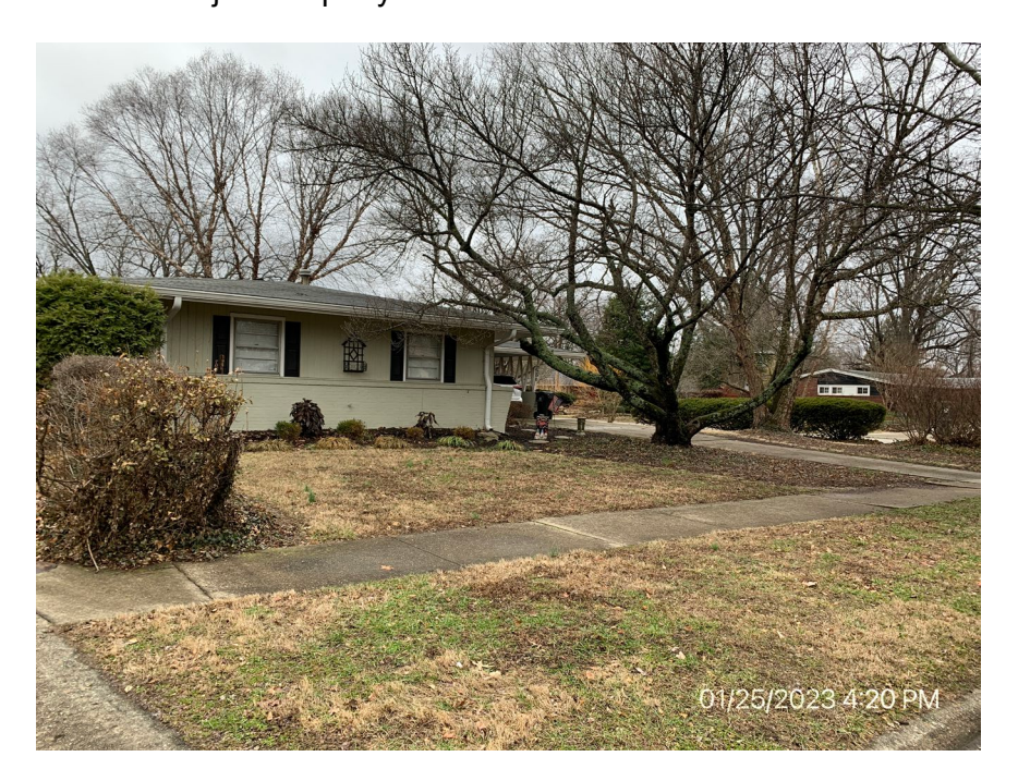
Adjacent Property to the Right