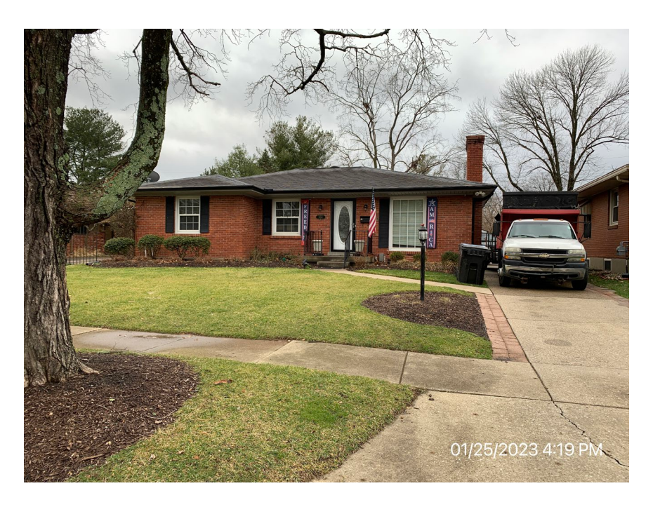
Adjacent Property to the Left