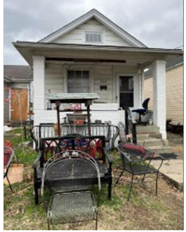
Property to the right