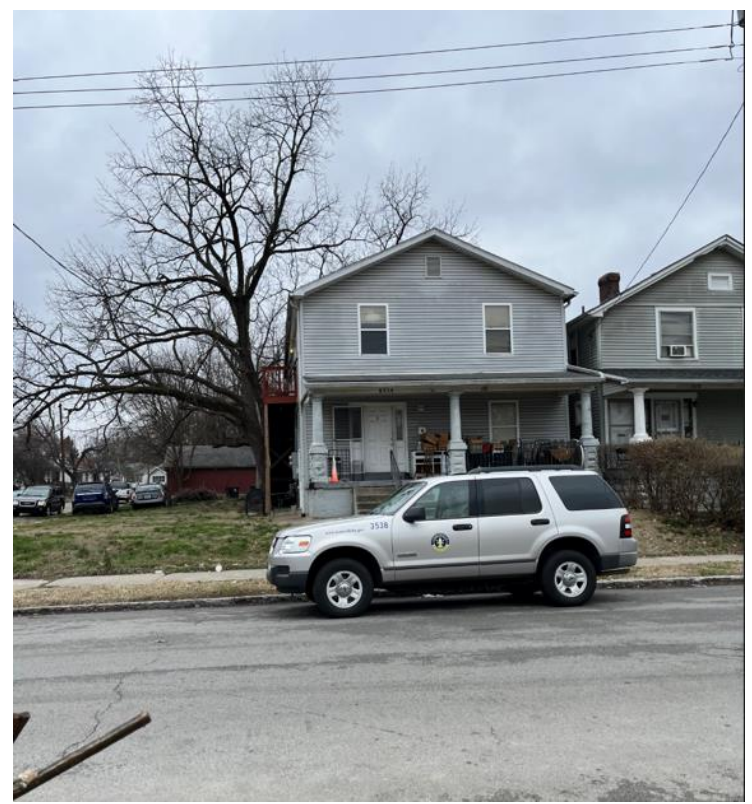
Across the street