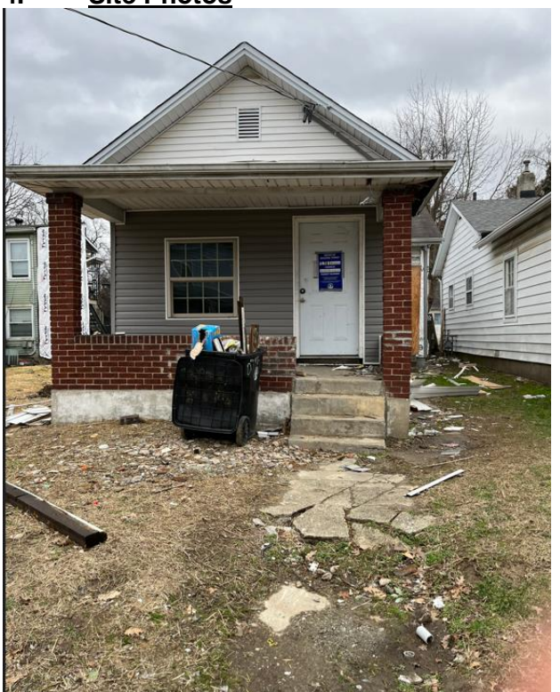
Front of house