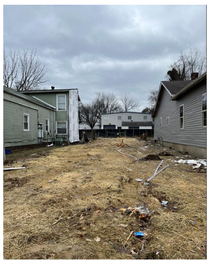
Property to the left (vacant)