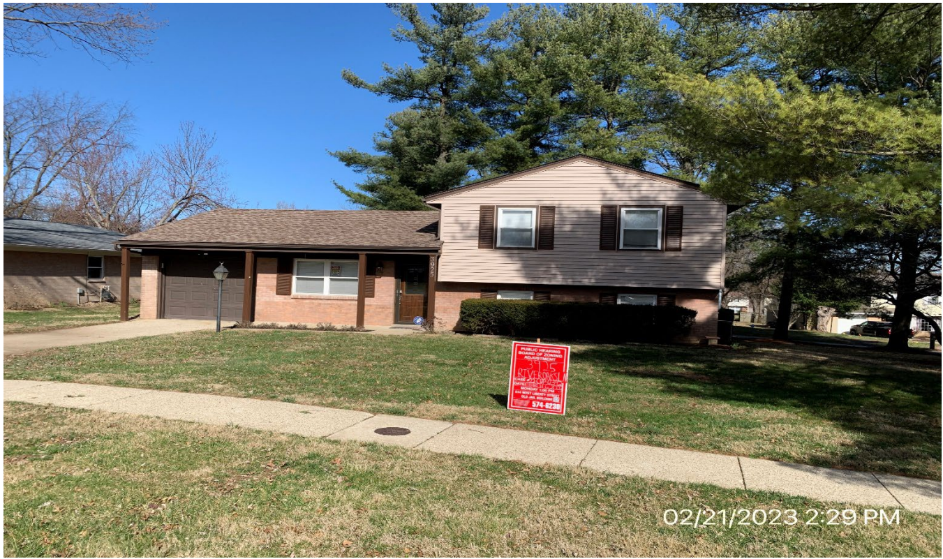
Front of subject site.