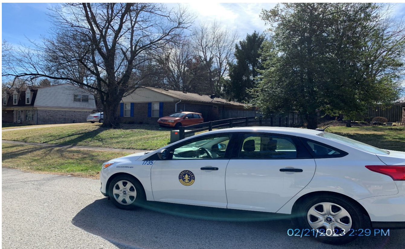
Across Riveroaks Lane.