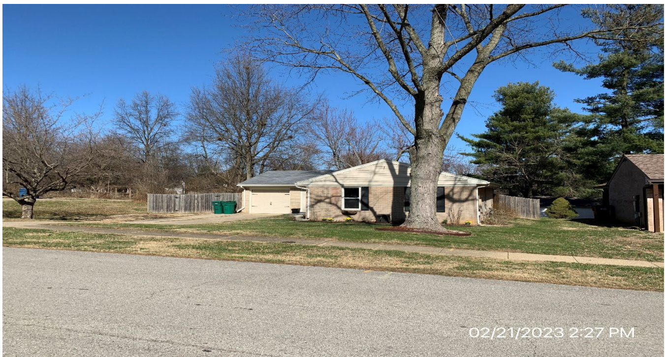
To the left of the subject site.