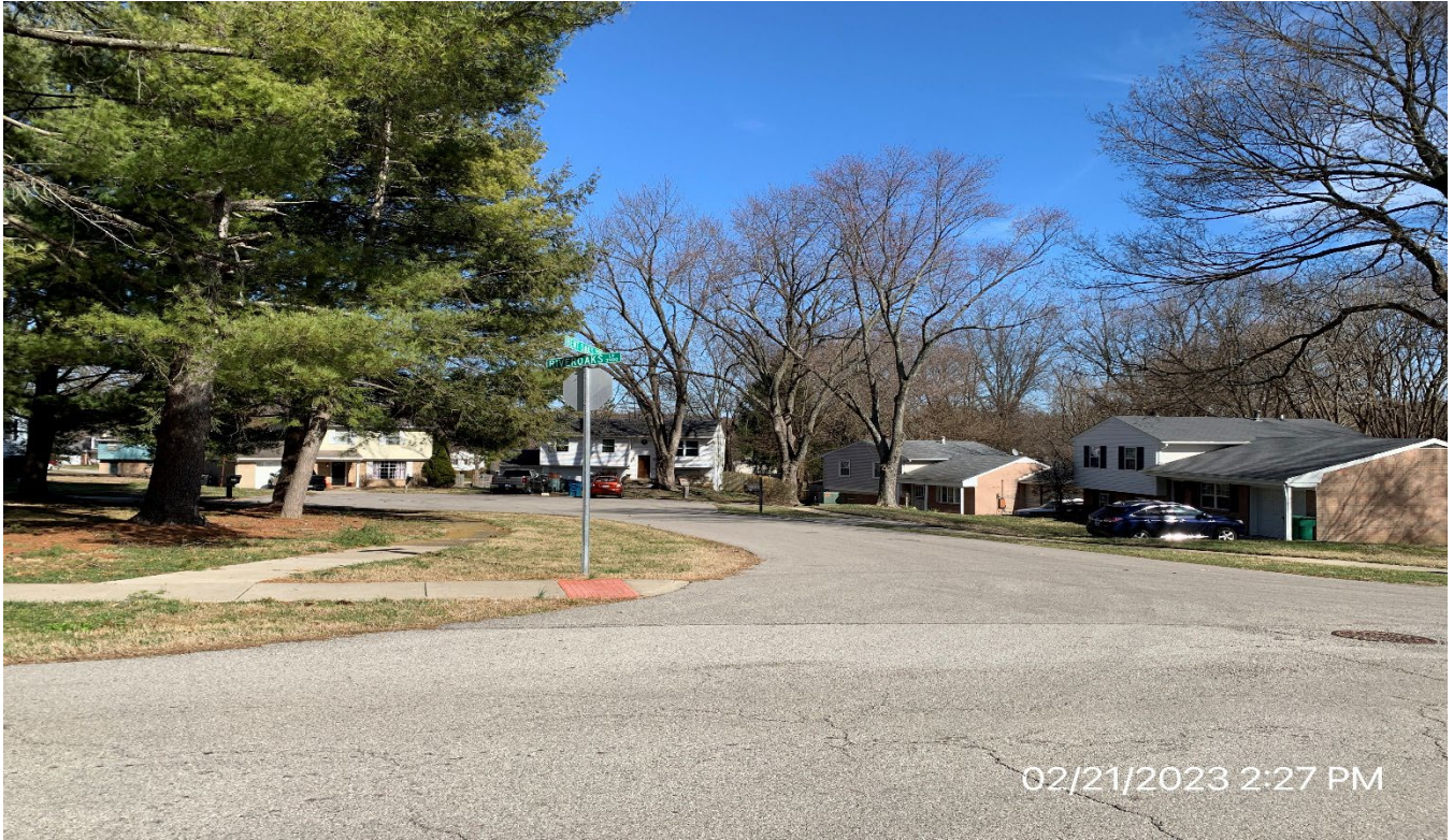
Properties to the right of subject site.