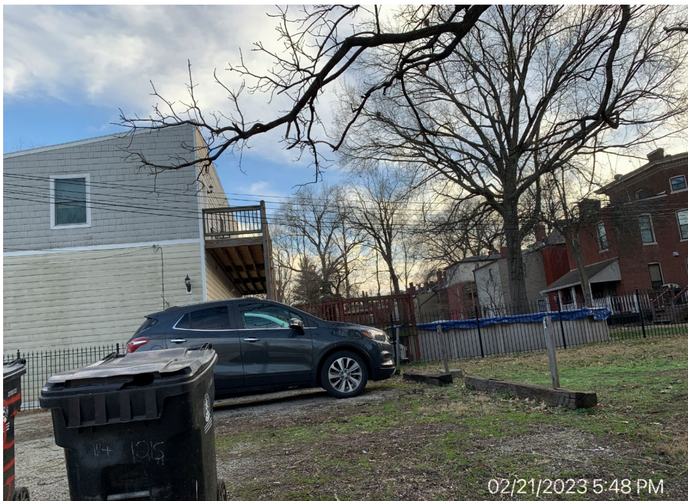
View of carriage house from side.