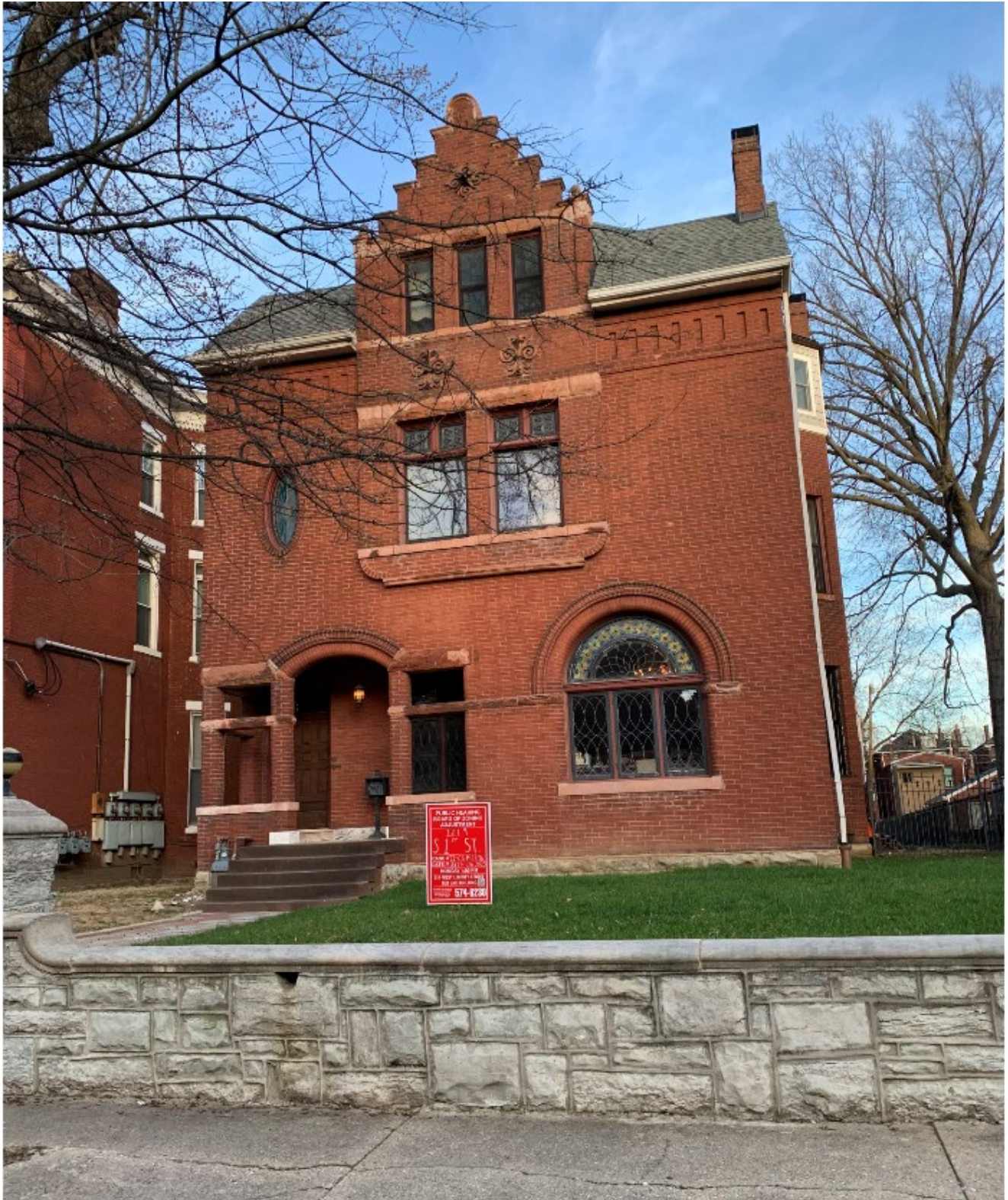
Front of principal residence.