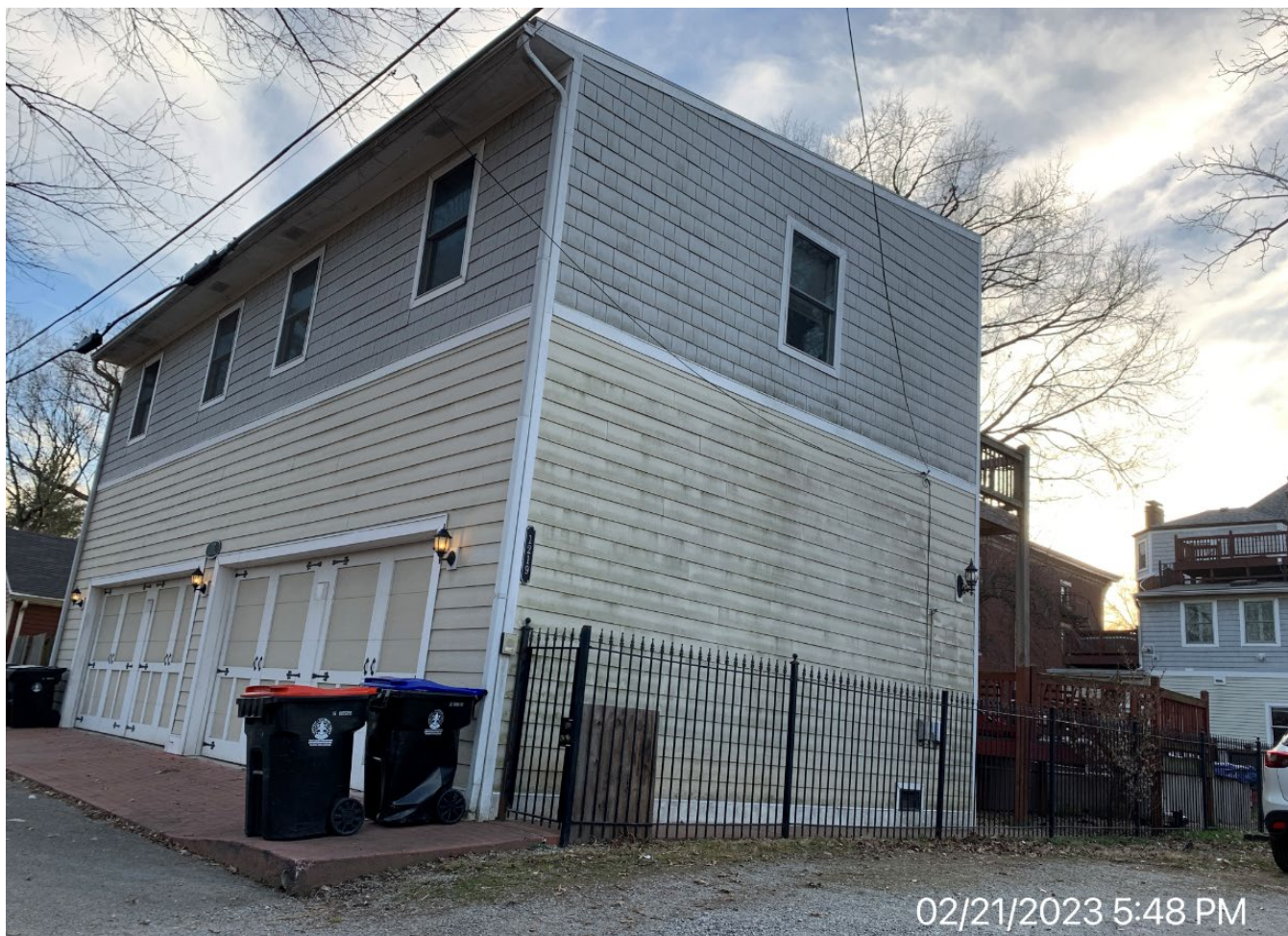
View of carriage house from alley.