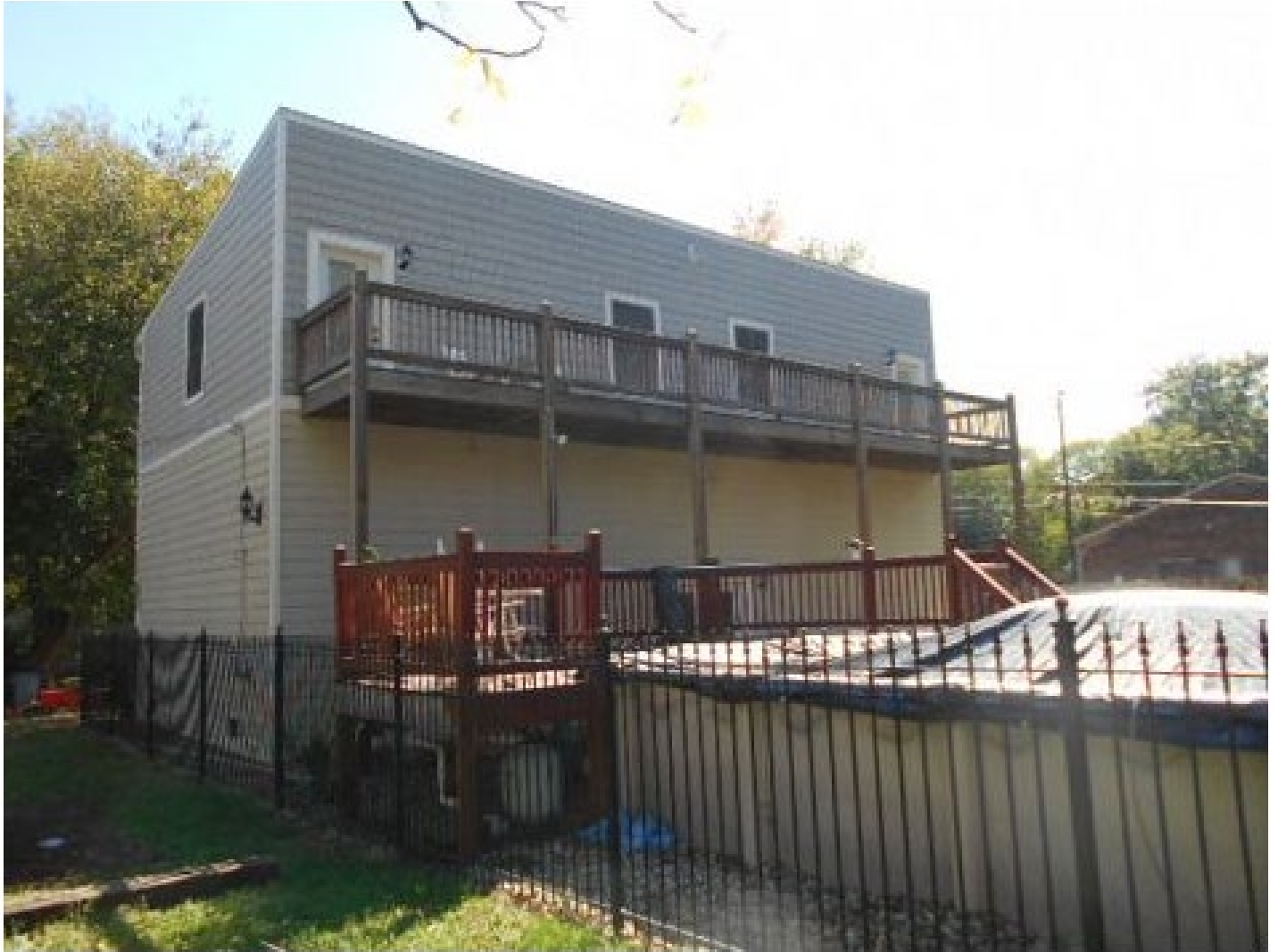
Front of carriage house, (source PVA).