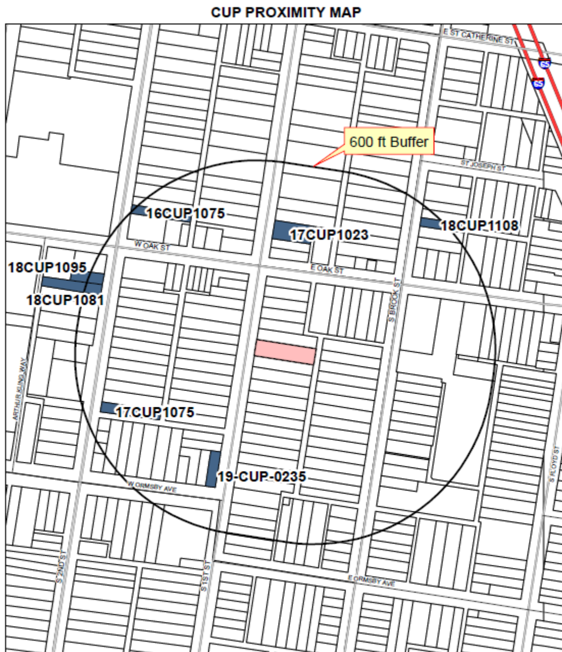
Case #22-CUP-0396 Map Created: 02/23/2023