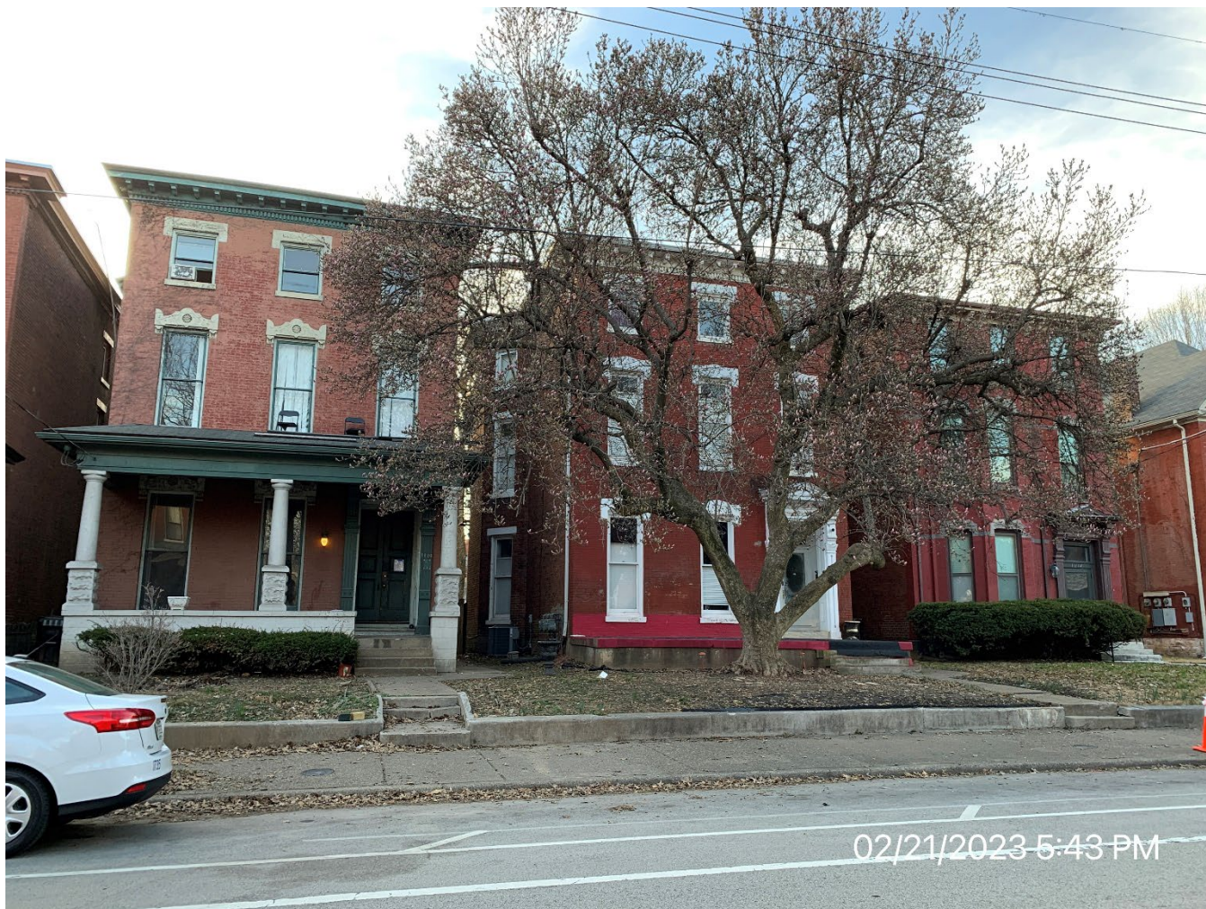
Across S 1 st St. from subject property.