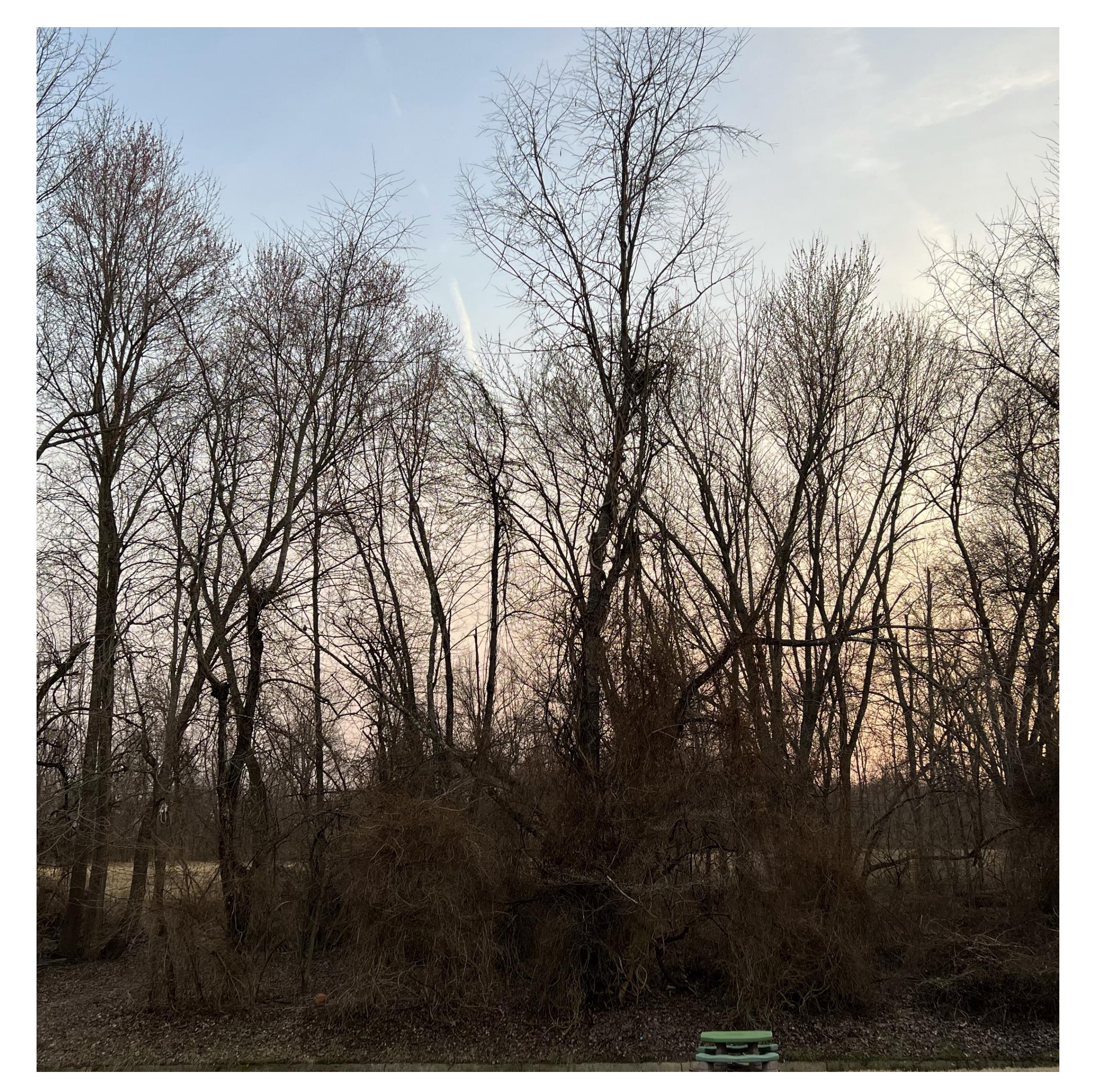
3210 Huberta Drive - view from back porch

LDG has indicated no plans to keep these mature trees on their side of the property.