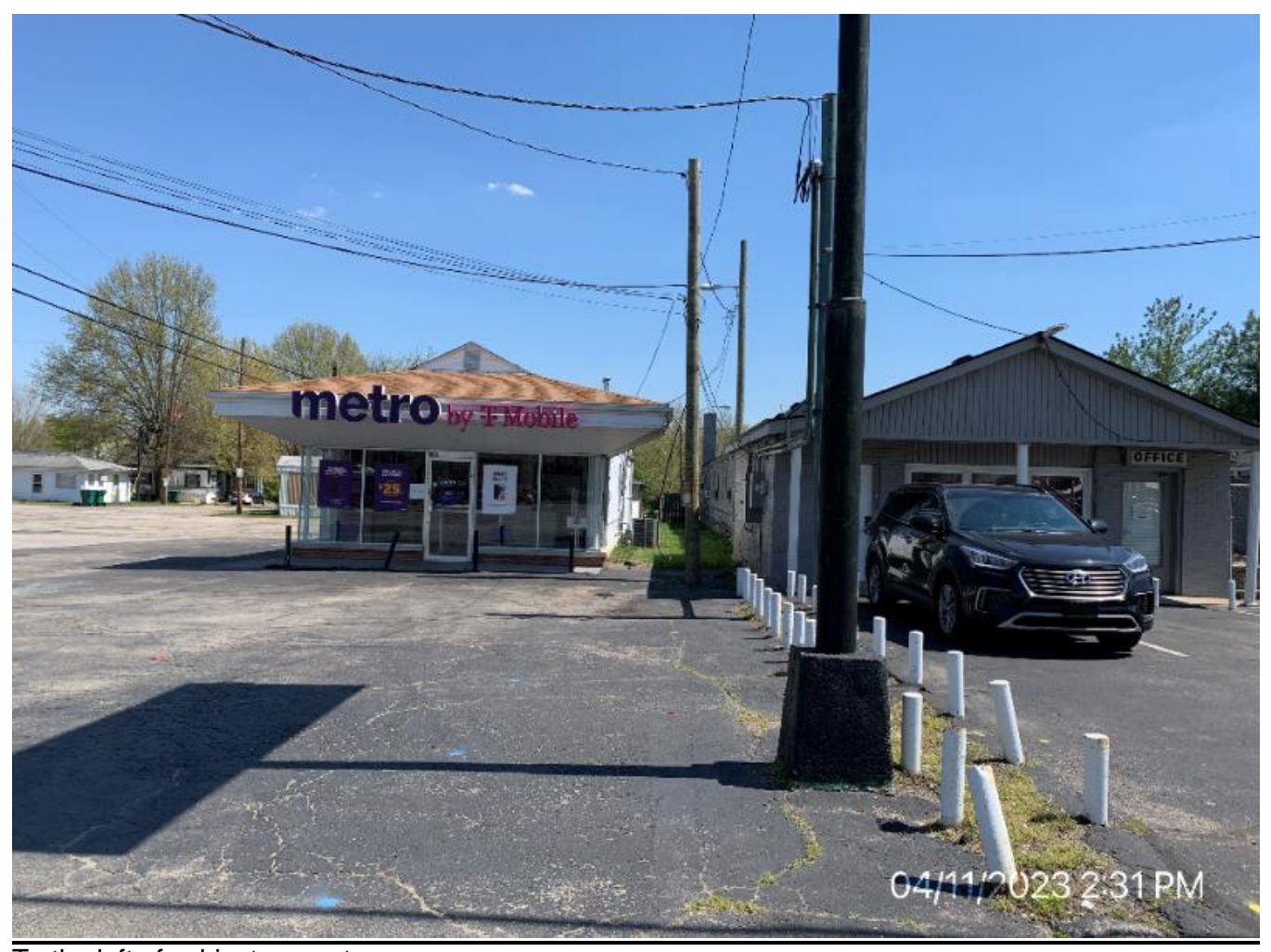
To the left of subject property.