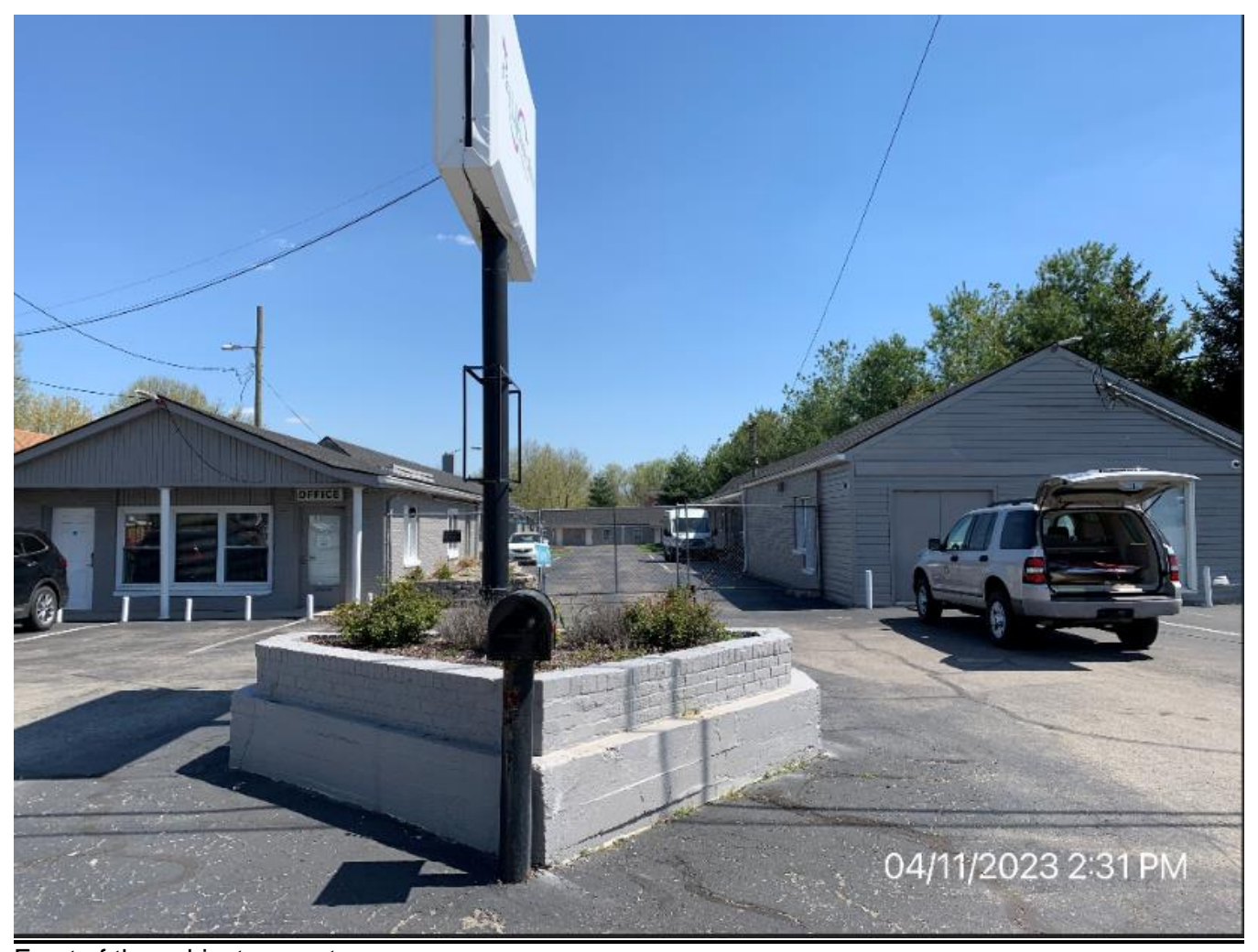
Front of the subject property.