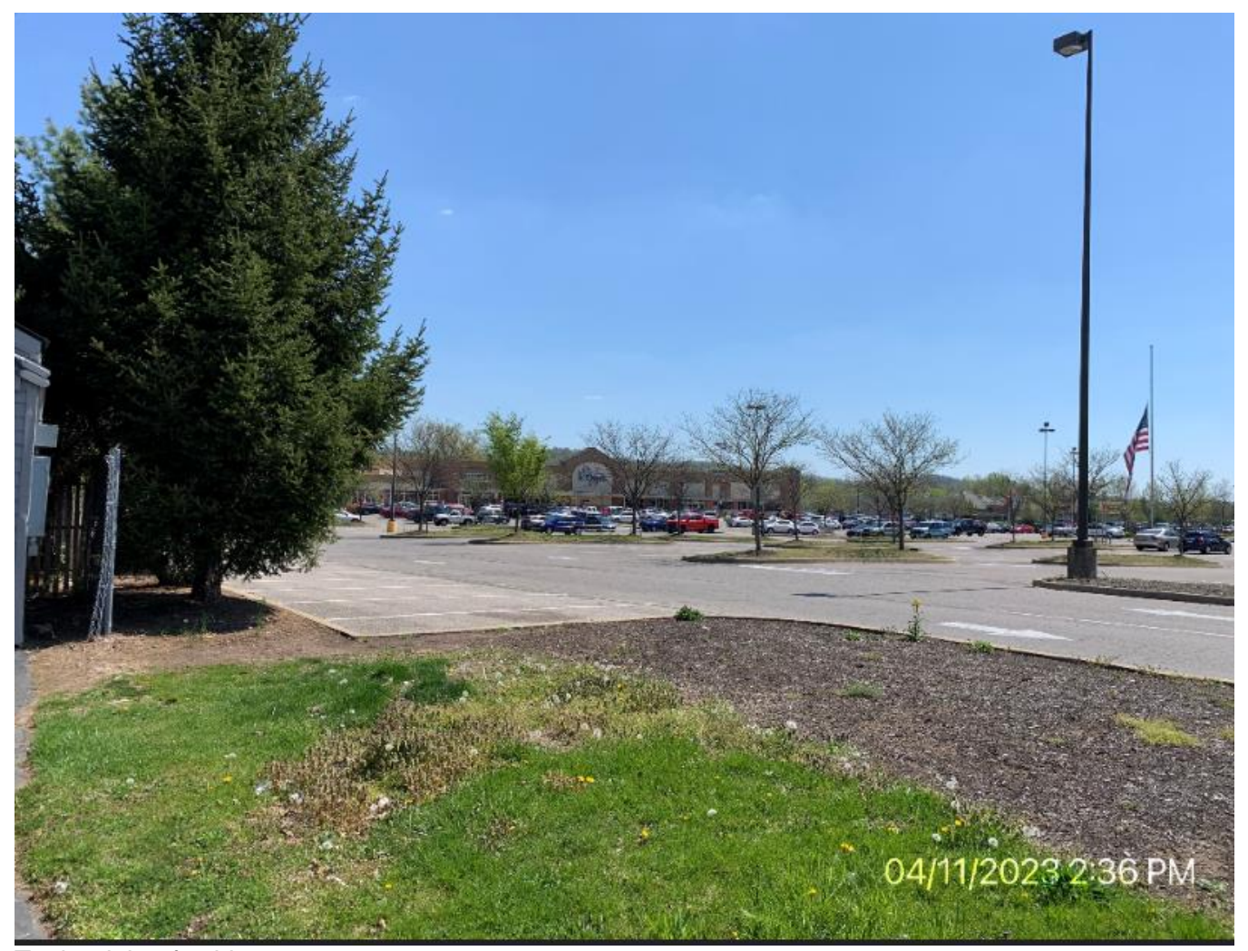
To the right of subject property.