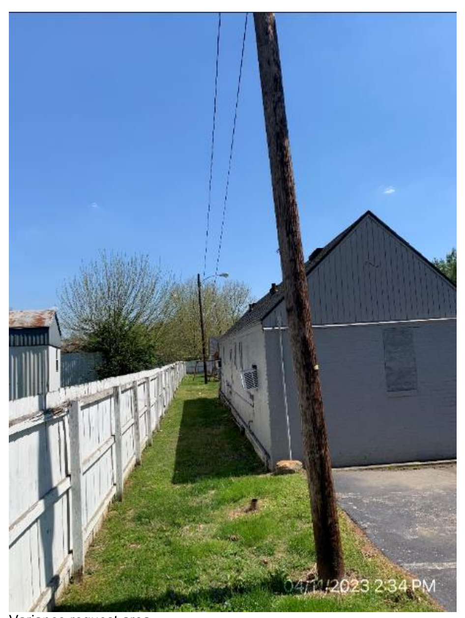
Variance request area.