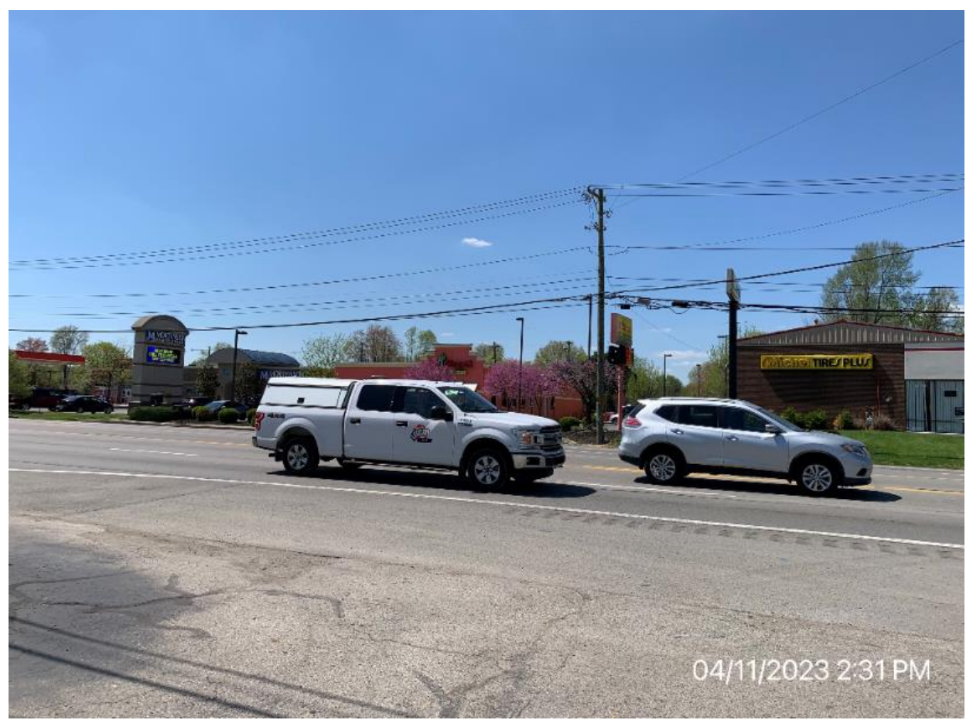
Across the street from the subject property.