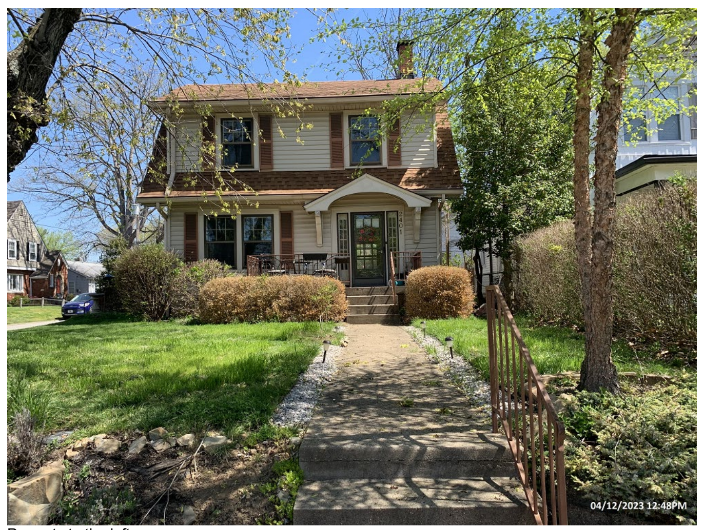
Property to the left.