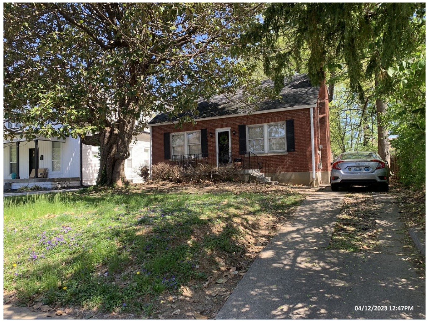
Property to the right.