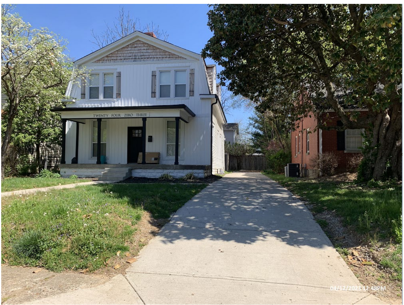
Front of subject property and off-street parking.