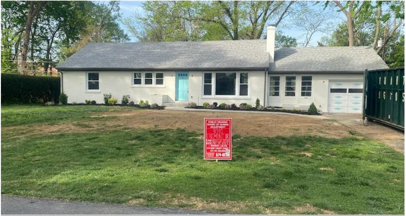
Front of subject property.