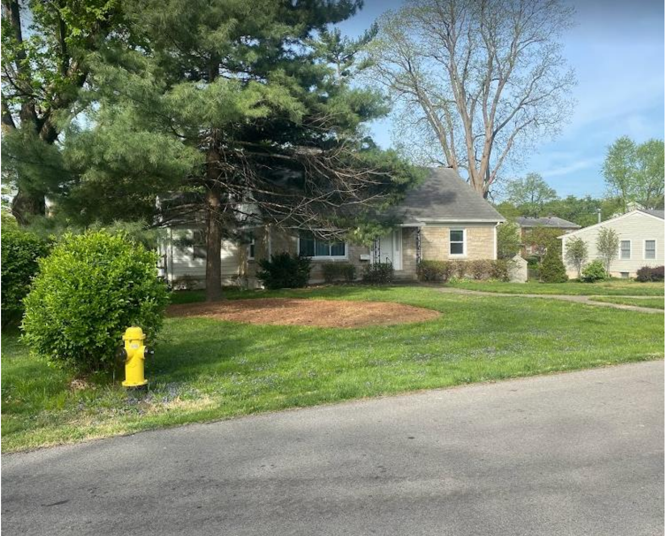
To the right of the subject property.