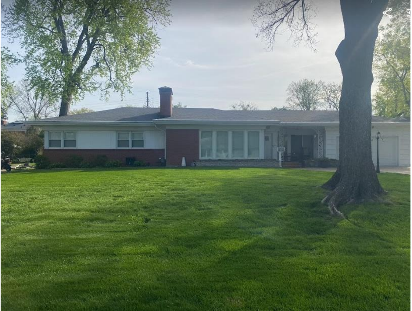
Across the street.