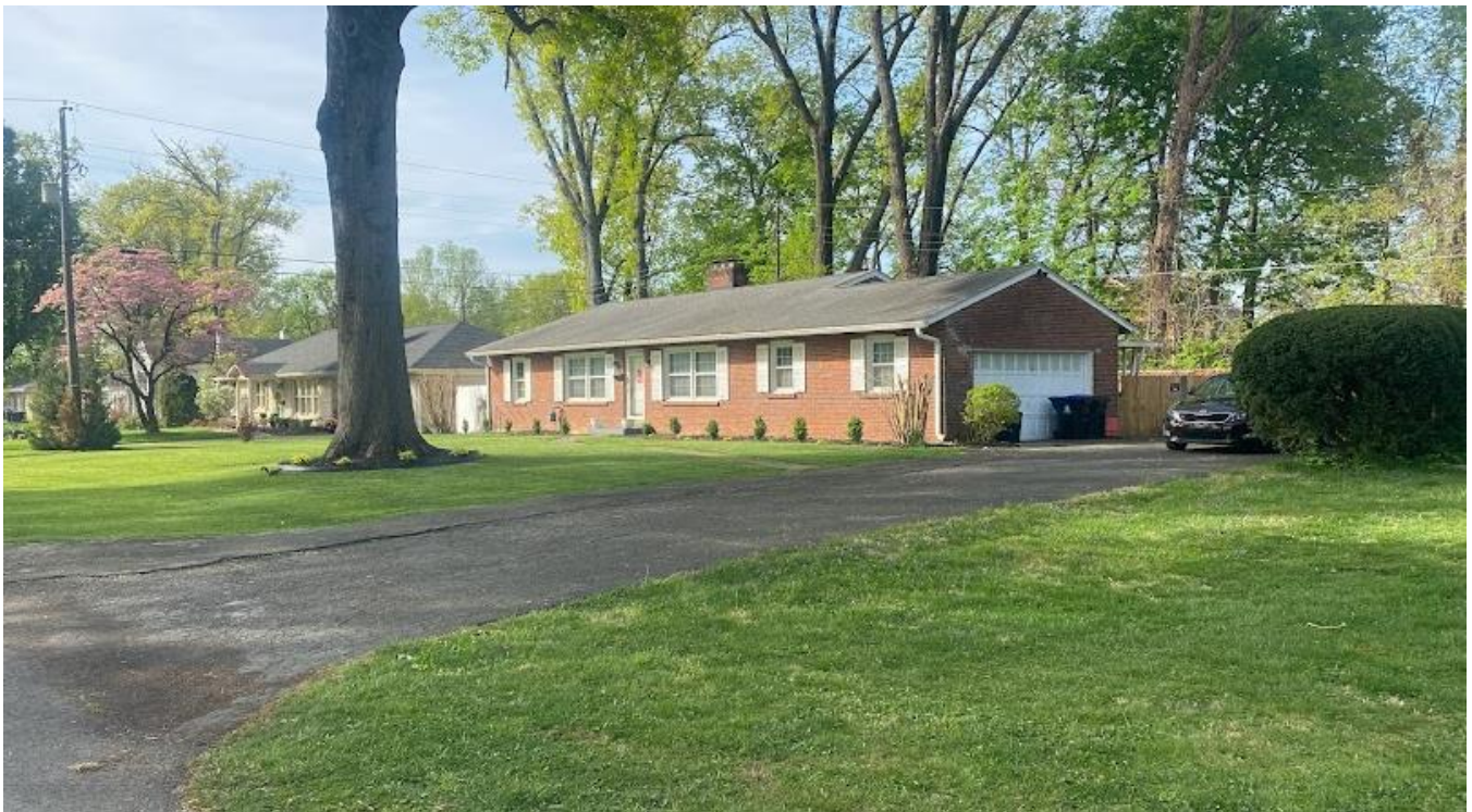
To the left of the subject property.