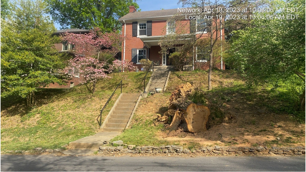
Adjoining property to the left