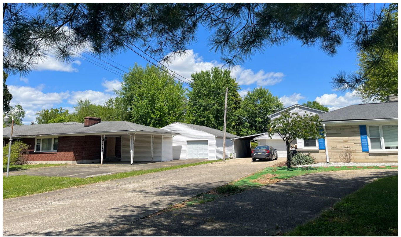
To the left of subject property