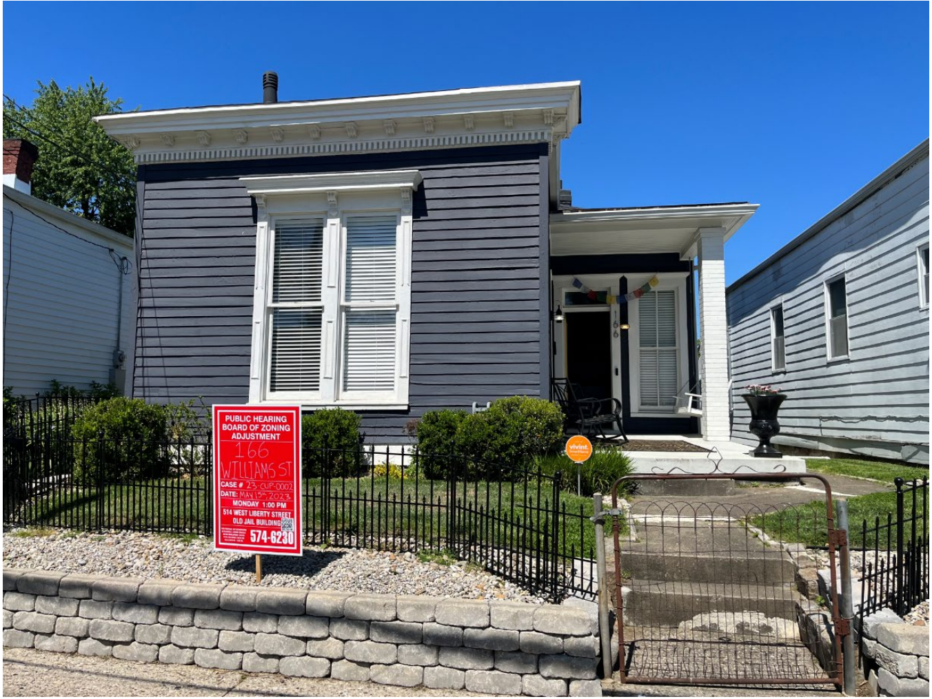
Front of subject property.