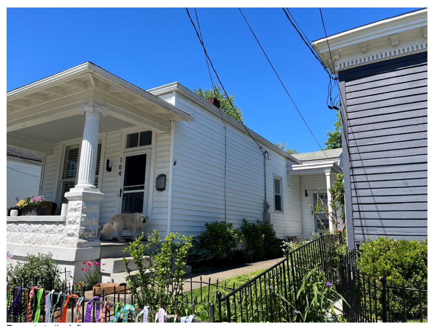
Property to the left.