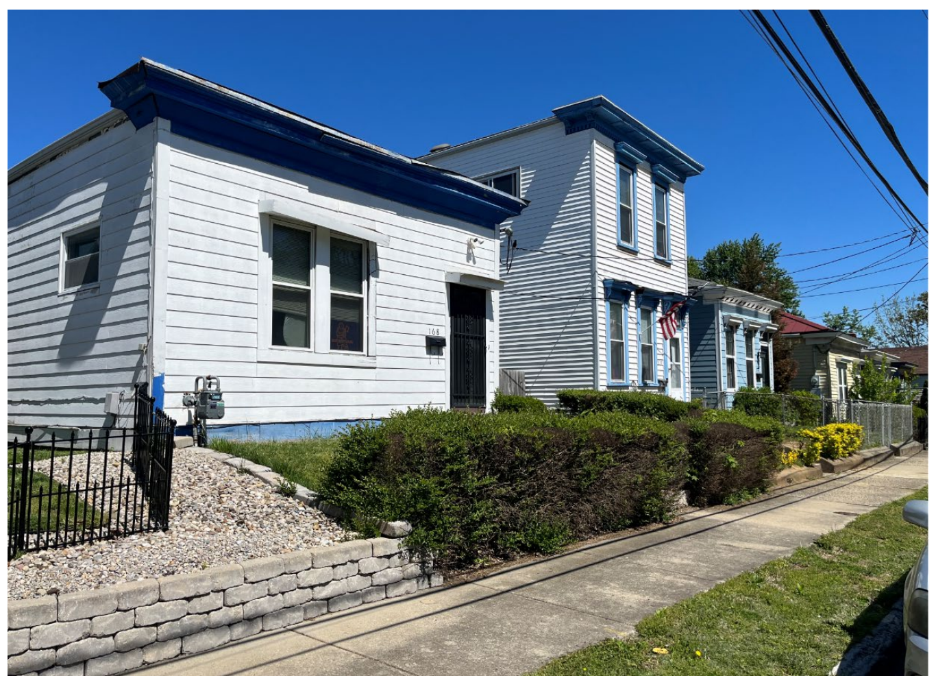
Property to the right.