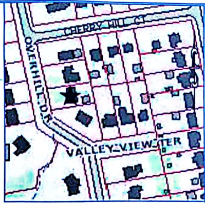
Location Map No Scale