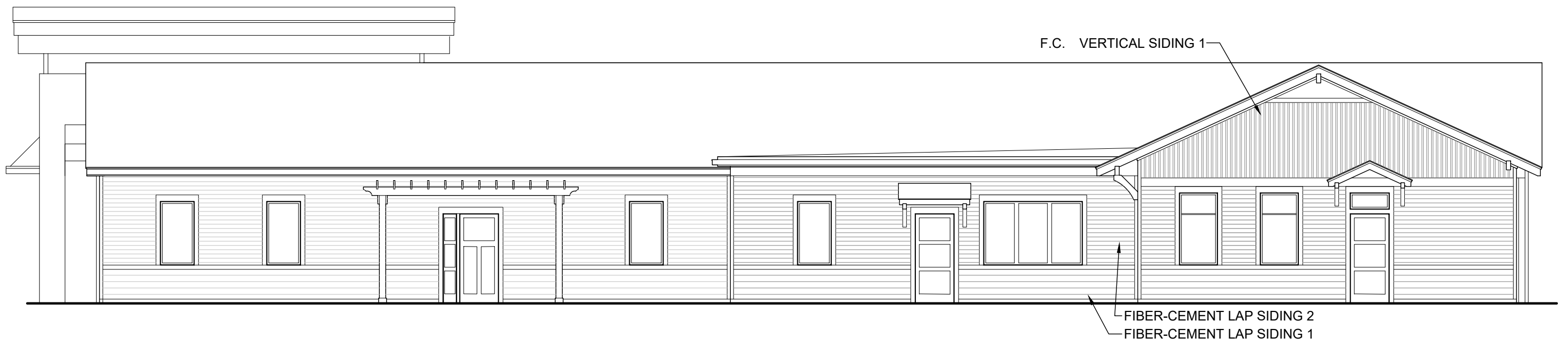
3 SOUTH ELEVATION 1/8" = 1'-0"