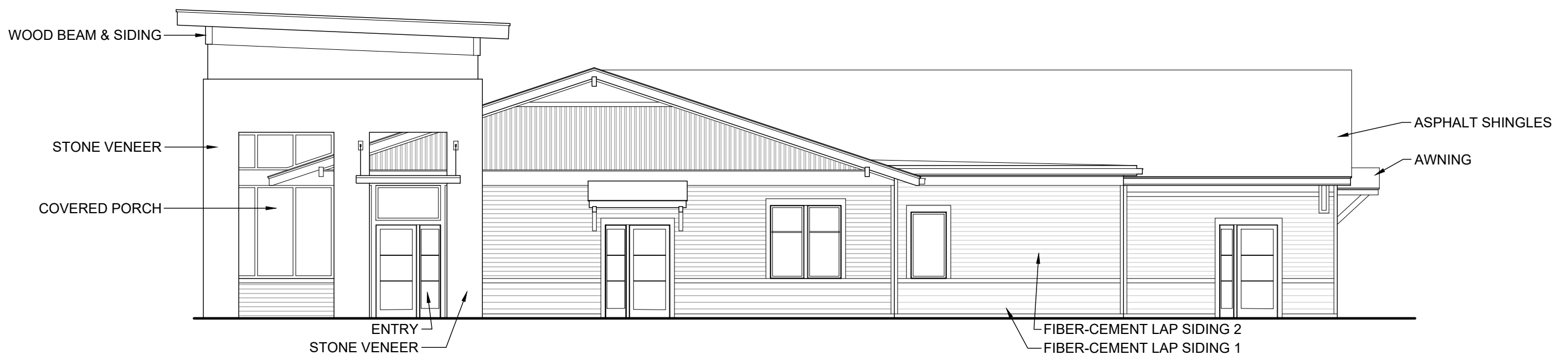
2 WEST ELEVATION 1/8" = 1'-0"