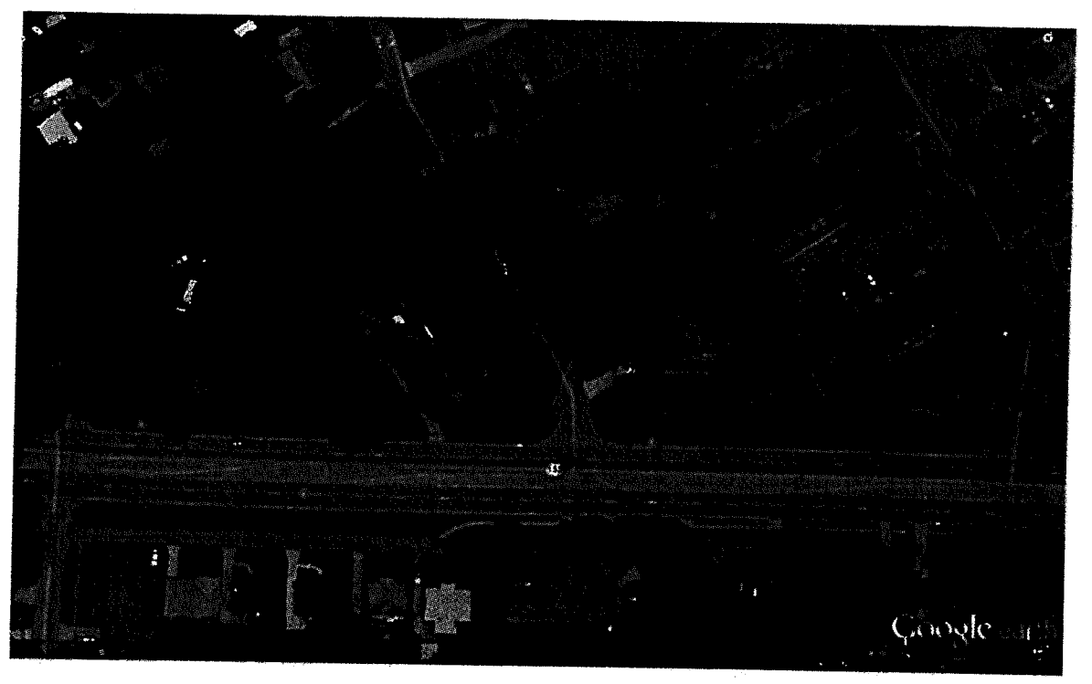
City of Meadowview – Proposed Site