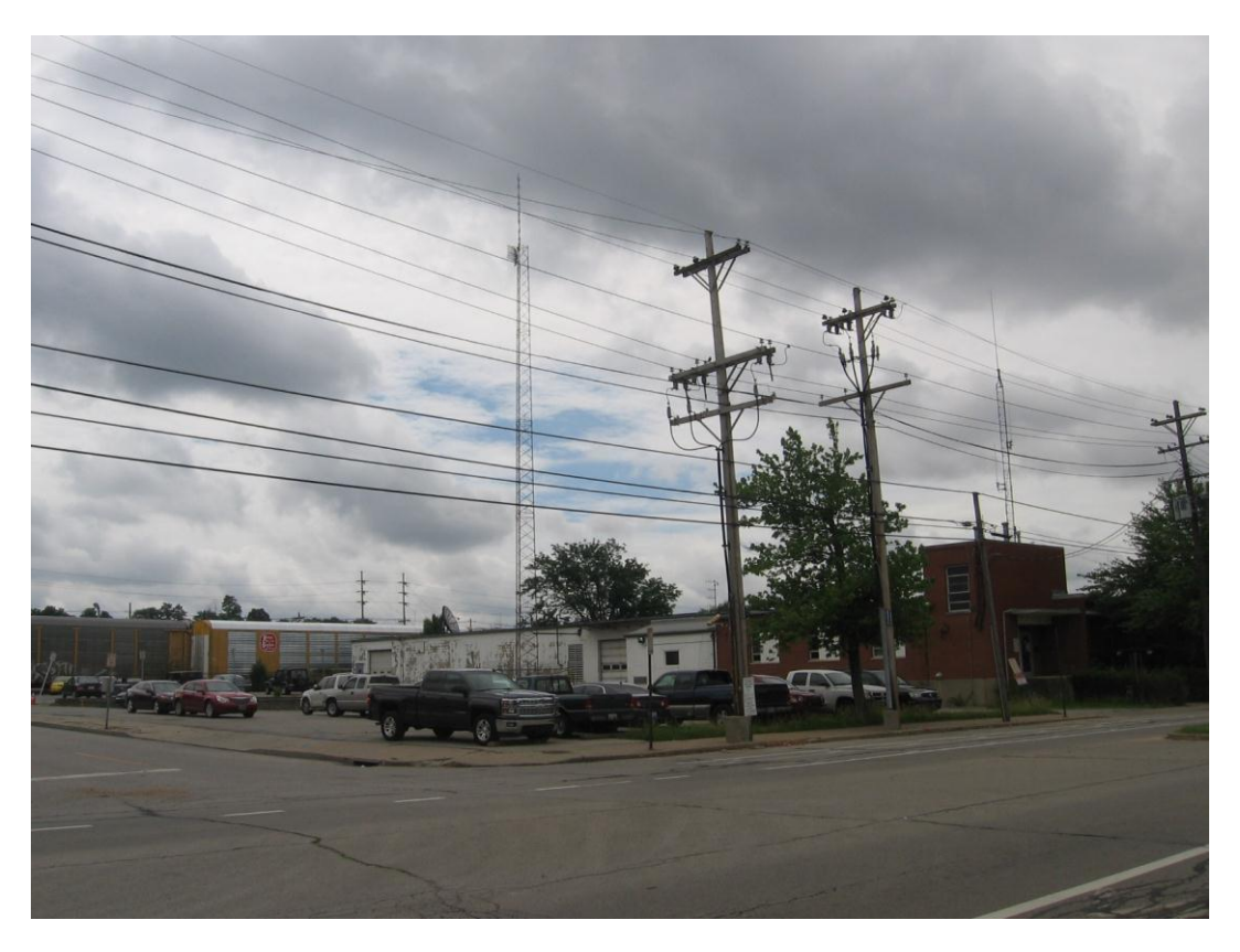
Subject site at corner of South Brook and East Bloom Streets