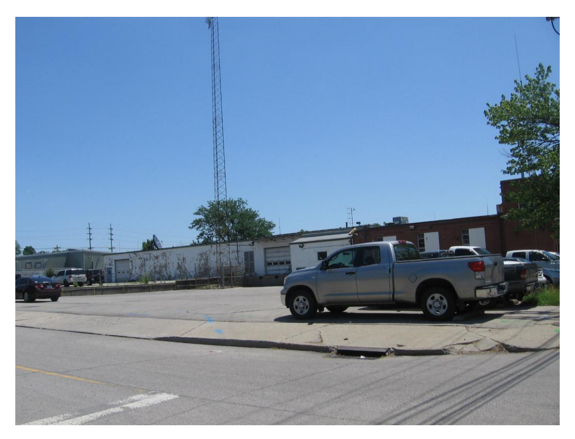
Adjacent property to the south. Building to be removed.