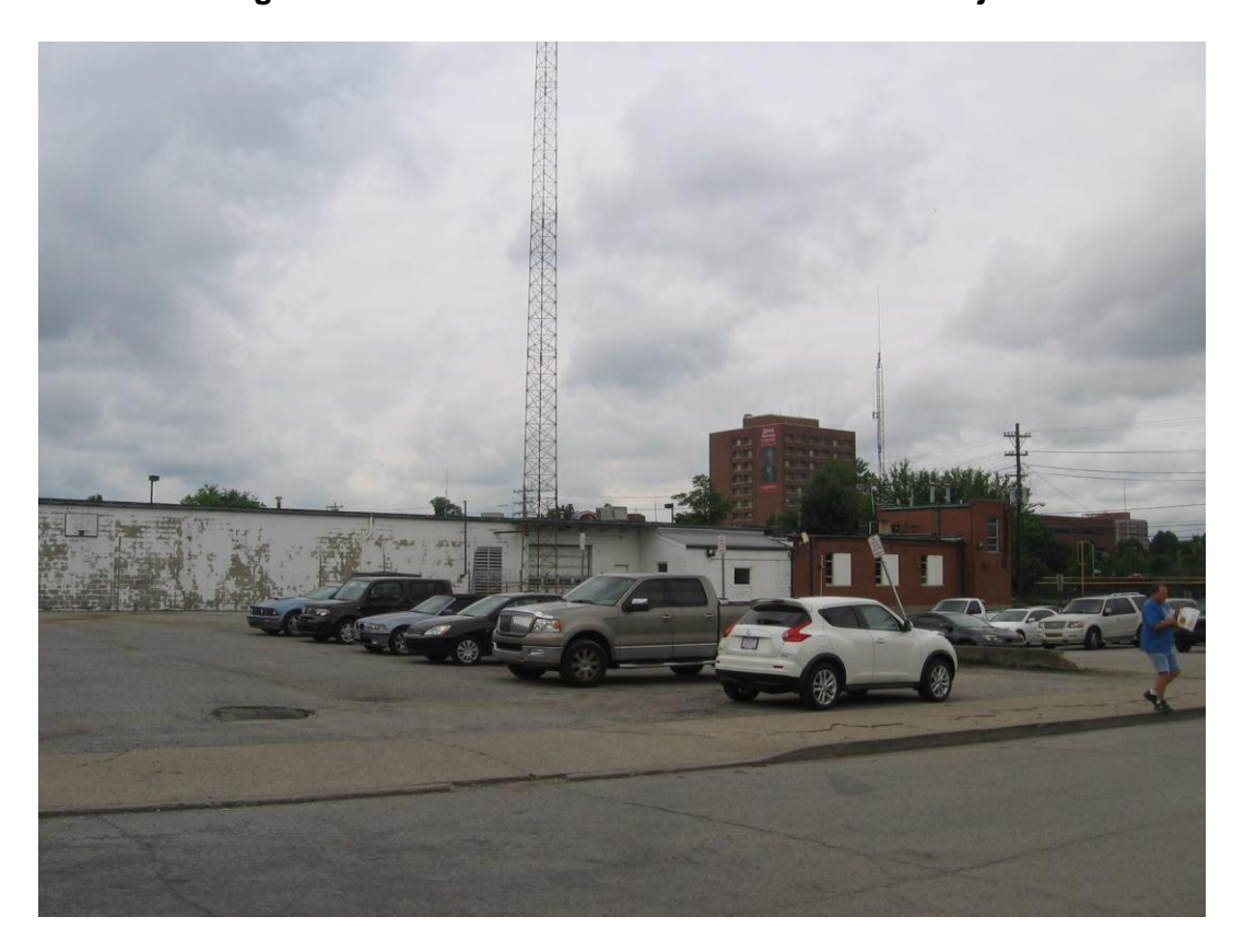
Looking from East Bloom south into subject site