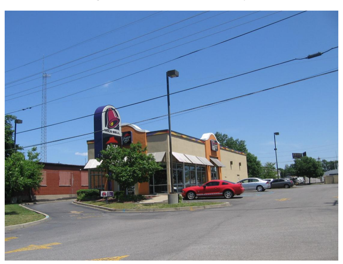
Existing Taco Bell at 1817 South Brook Street which is being replaced