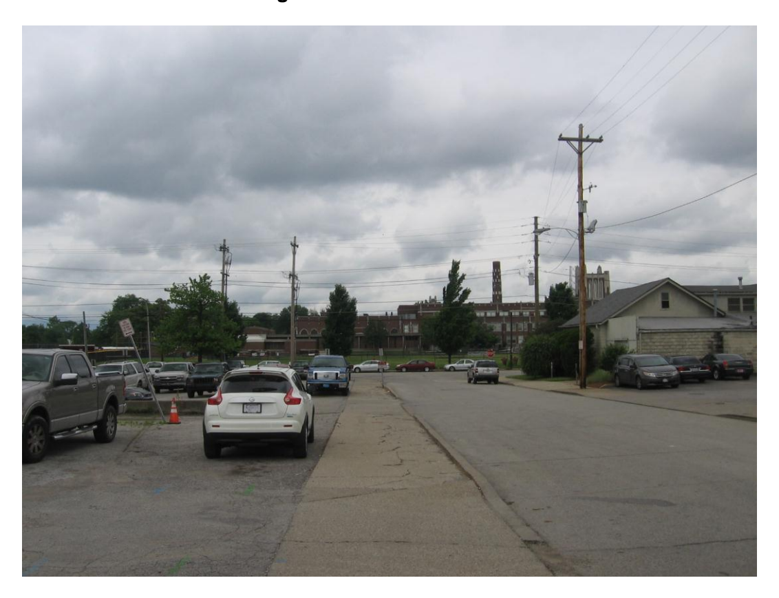
Looking west from East Bloom Street