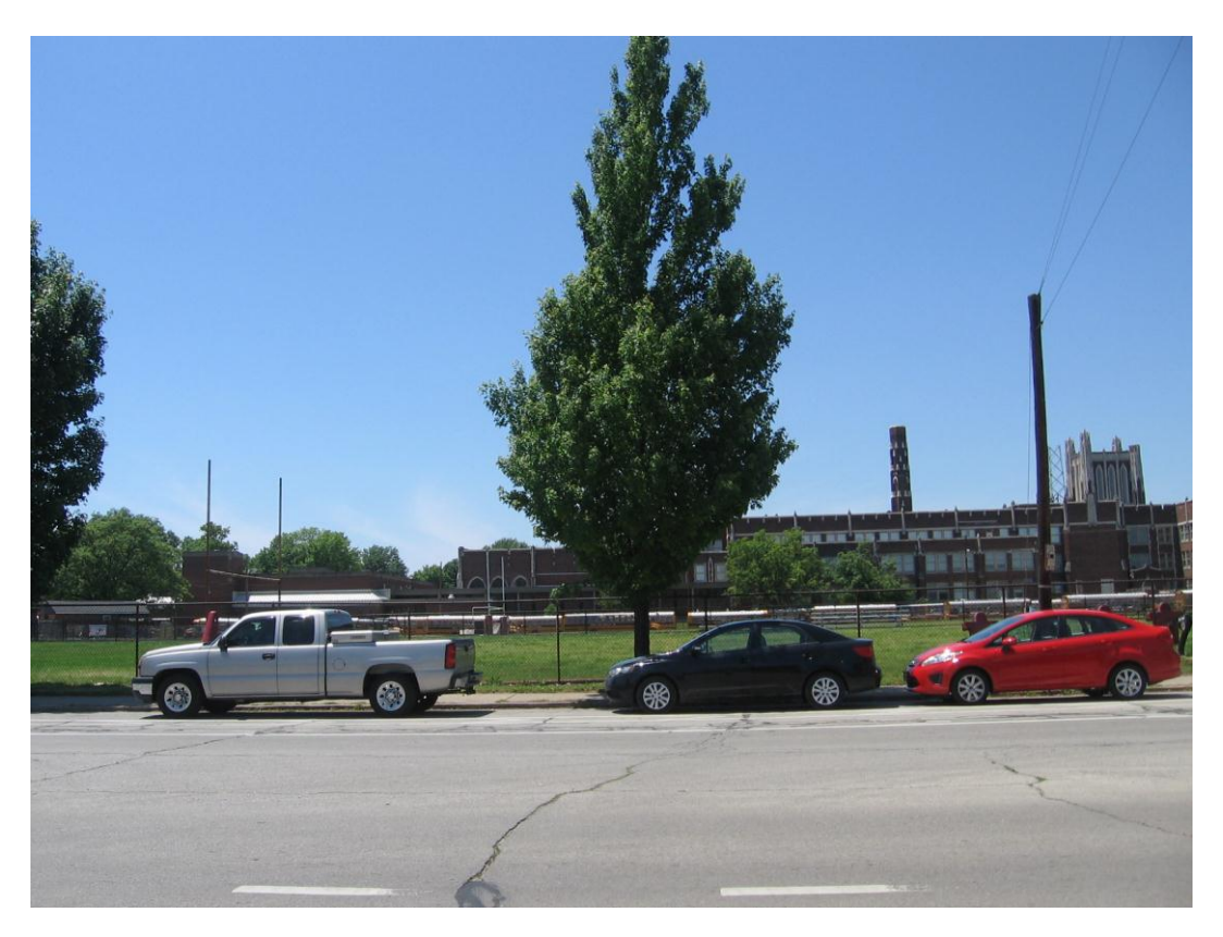
Adjacent property to the west