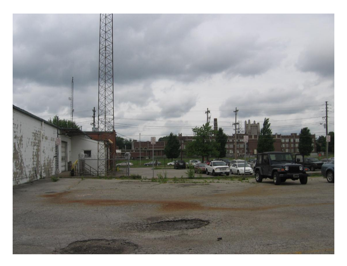
Looking west from the interior of the subject site