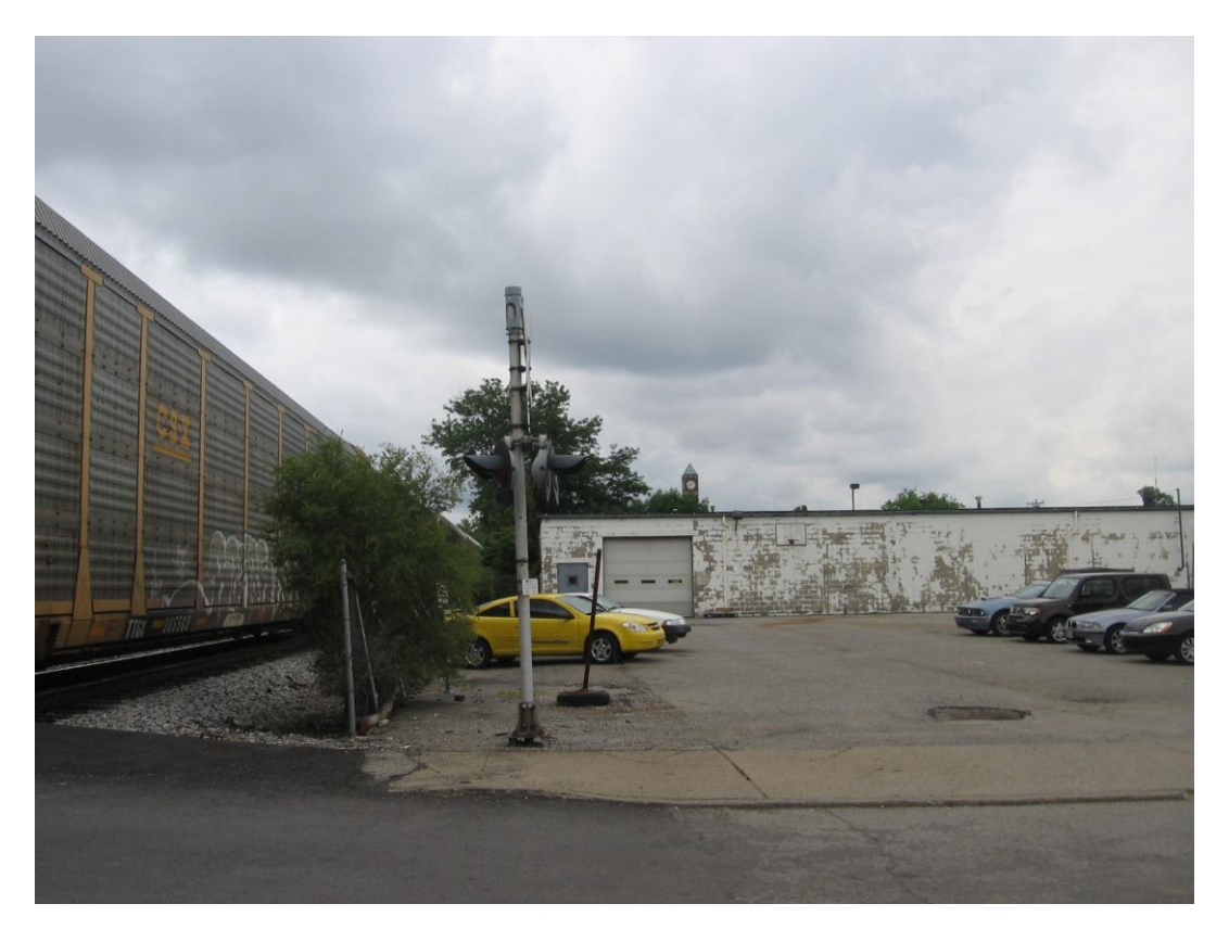
Looking south from East Bloom Street into rear of subject site