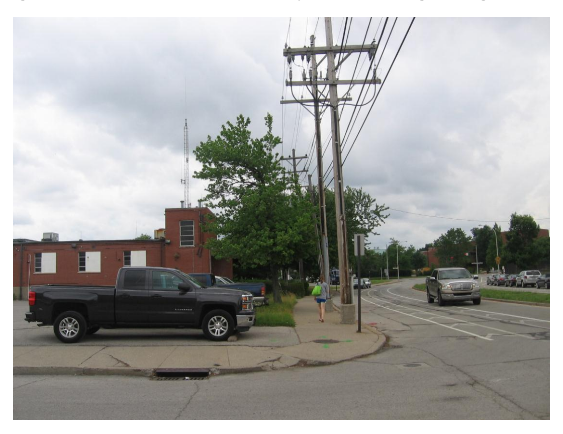
Looking south down South Brook Street