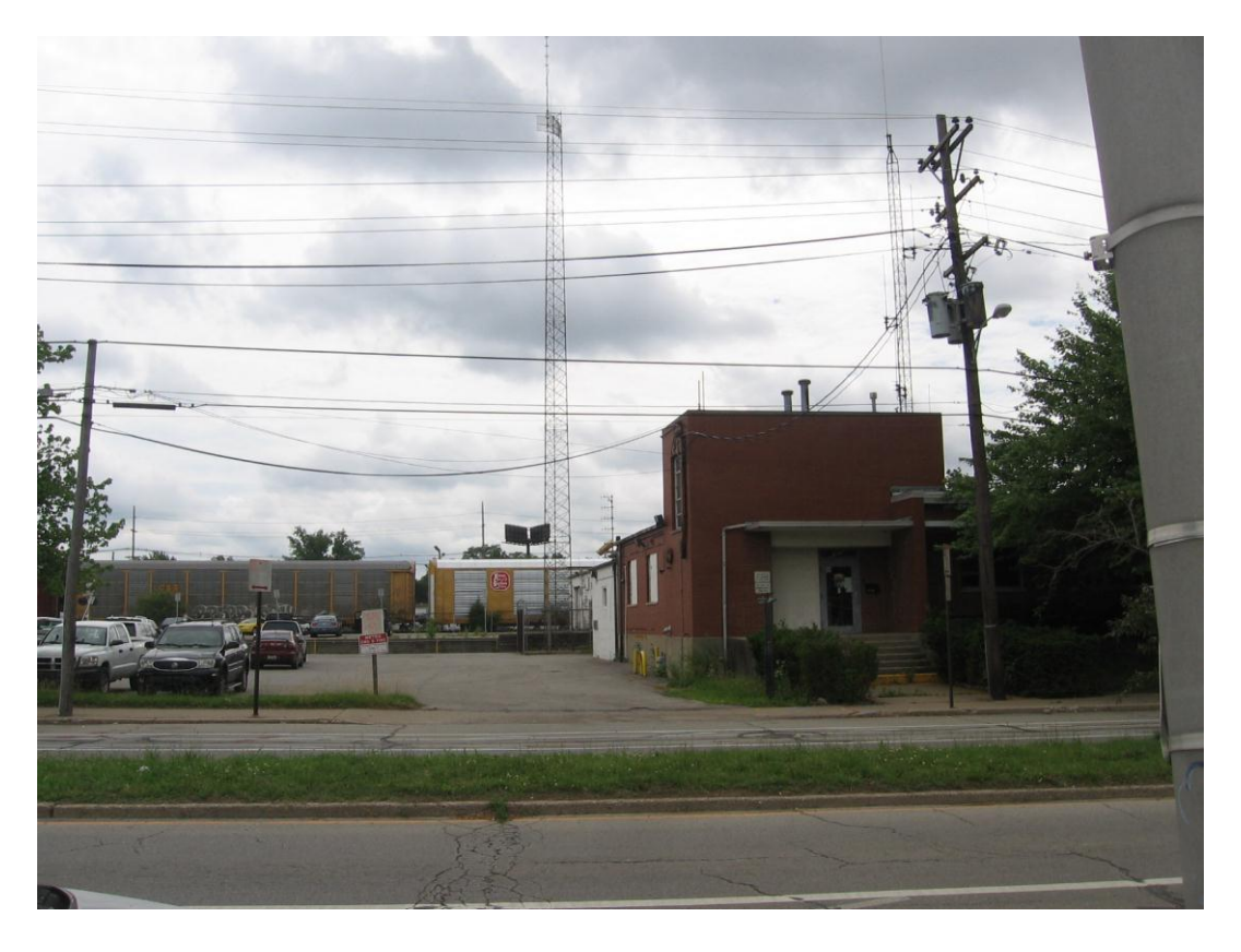
Looking from South Brook Street east into subject site. Existing building to be removed