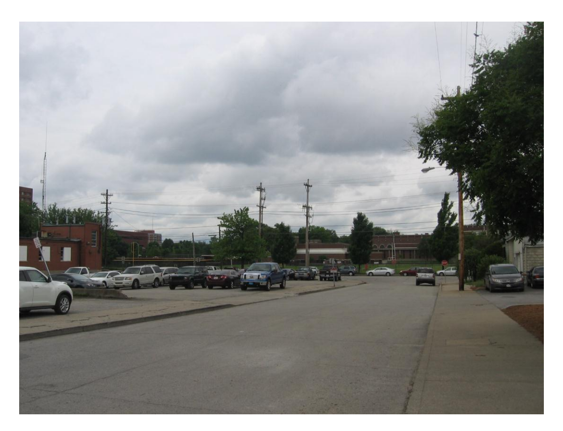
Looking west from East Bloom Street