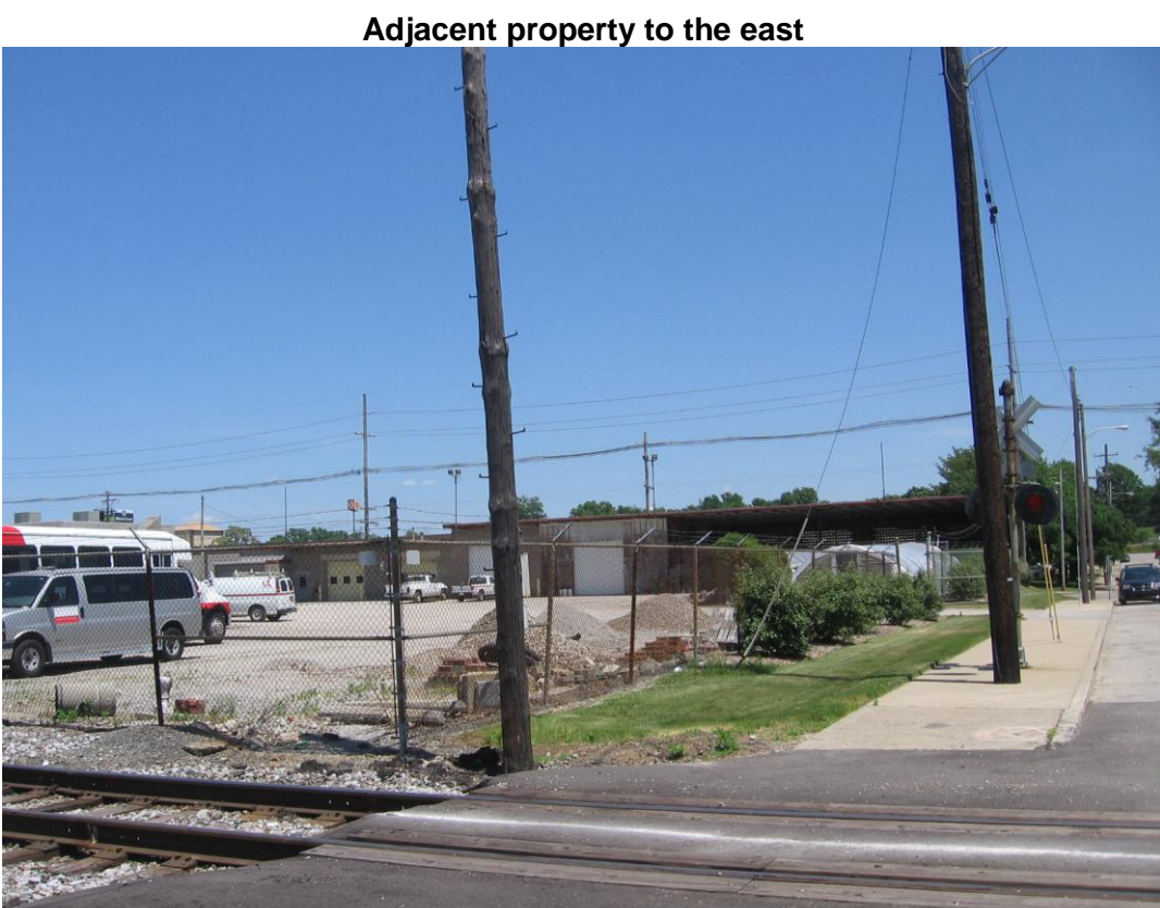
Adjacent property to the northeast