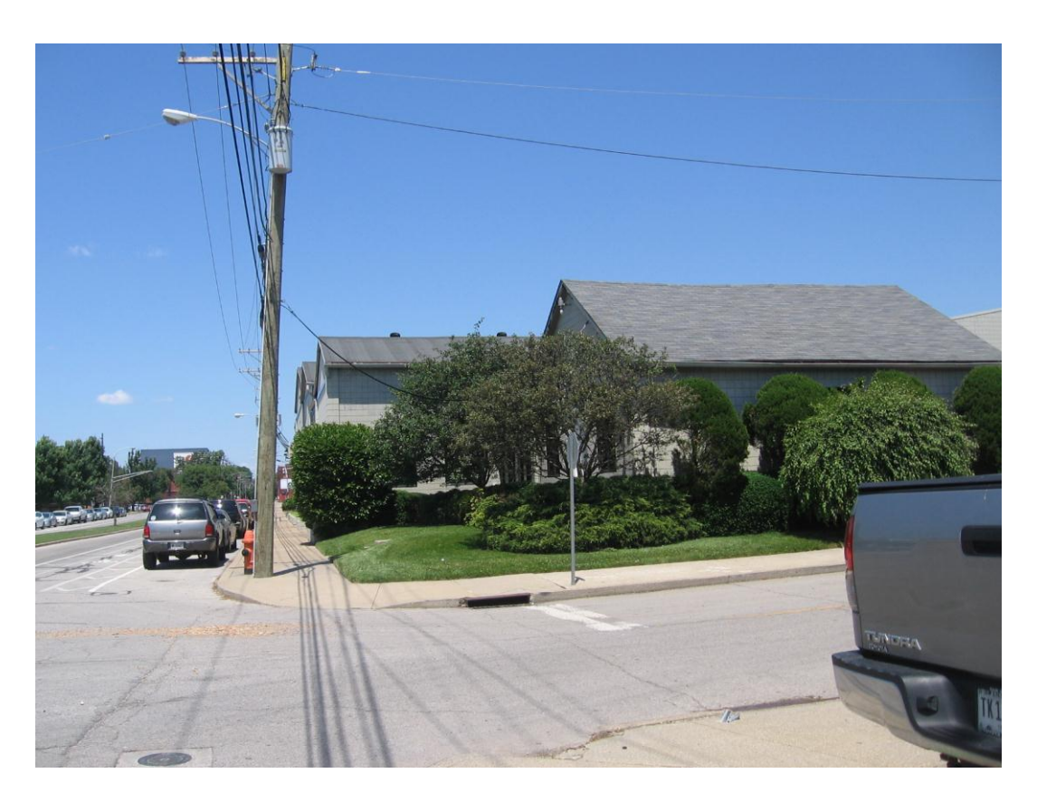
Adjacent property to the north