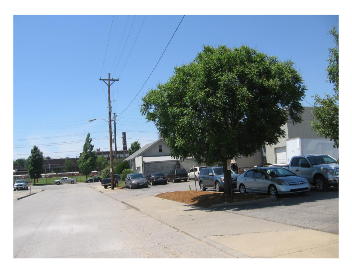
Adjacent property to the north (rear parking lot)