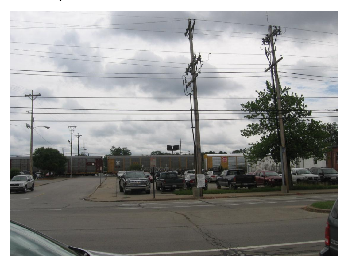
Looking from South Brook Street east into subject site