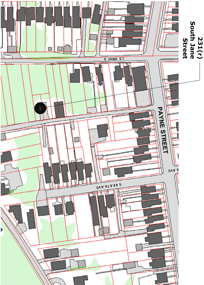
02 SITE CONTEXT SCALE: not to scale