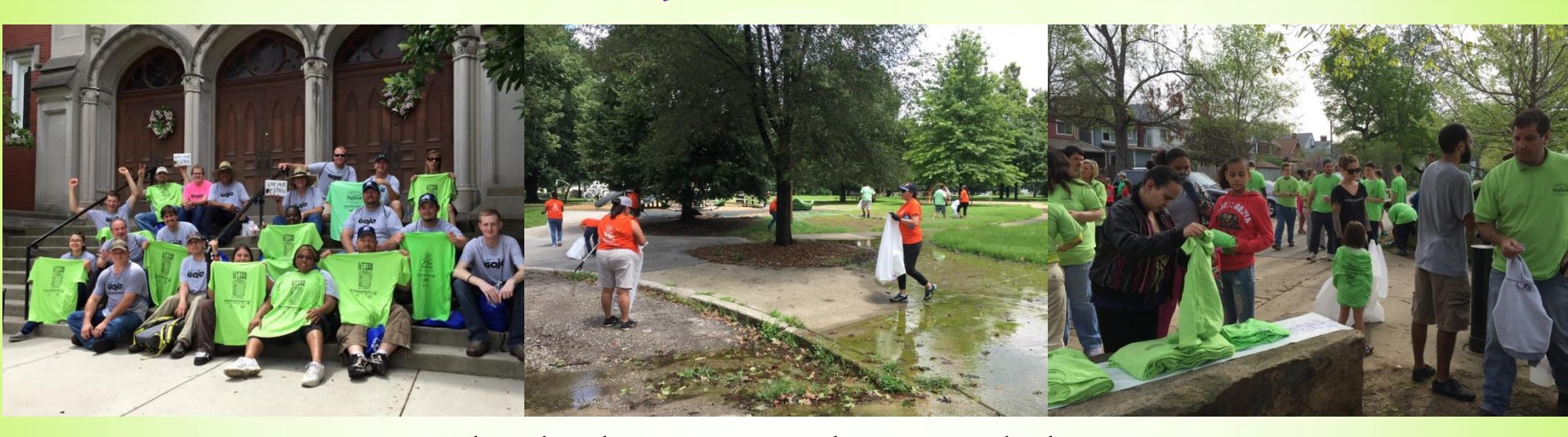
Brightside Champion & Volunteer Led Cleanups

Brightside Champions have hosted several cleanups in and around their Districts as a direct result of the Cleanliness Assessment - most notably in Metro Council Districts 4, 5, and 6. Many of our Champions have also taken more active roles in the conversations with community leaders regarding litter and litter education practices in their areas.