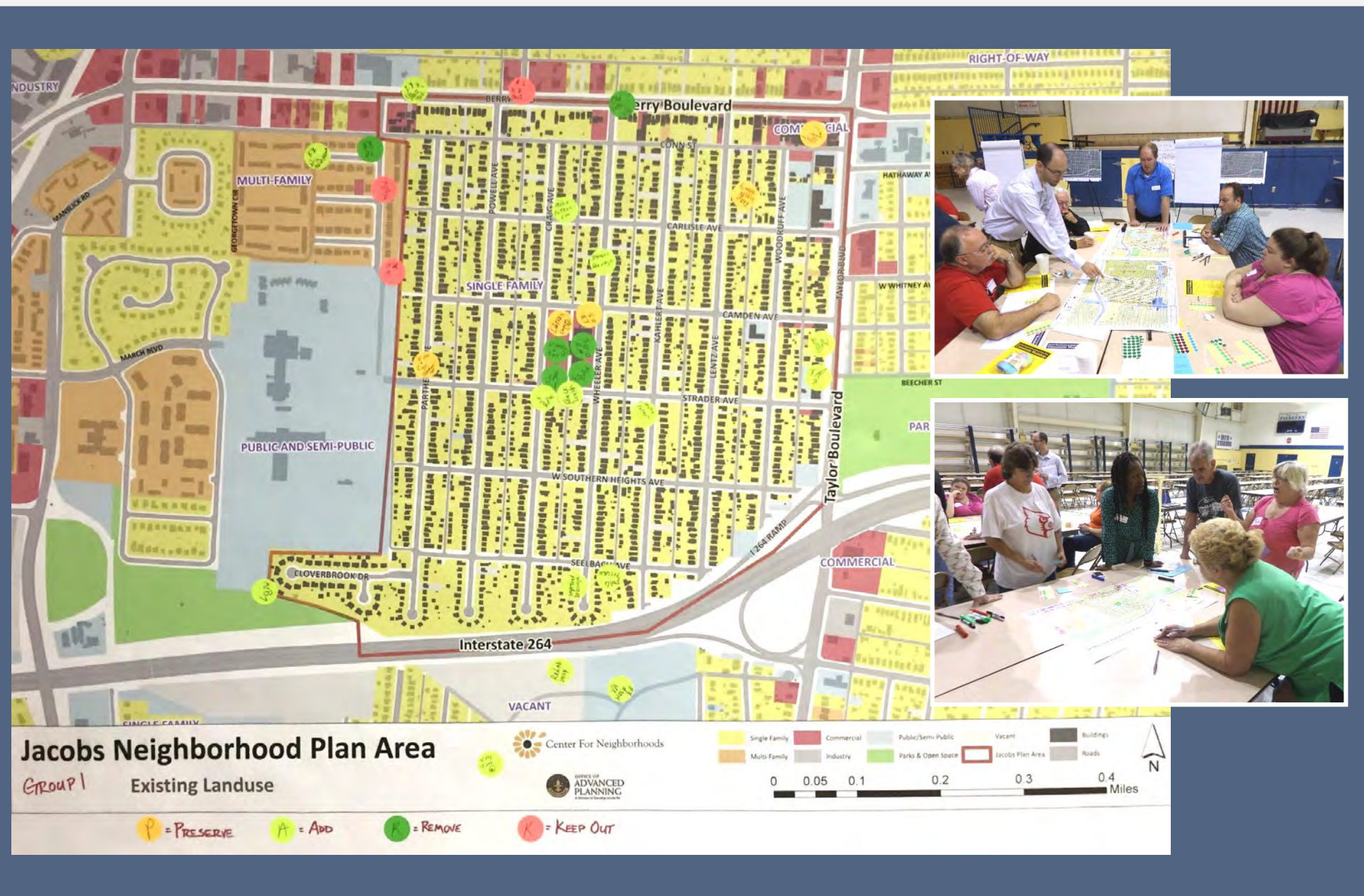
Jacobs Neighborhood Plan: Landuse & Community Form