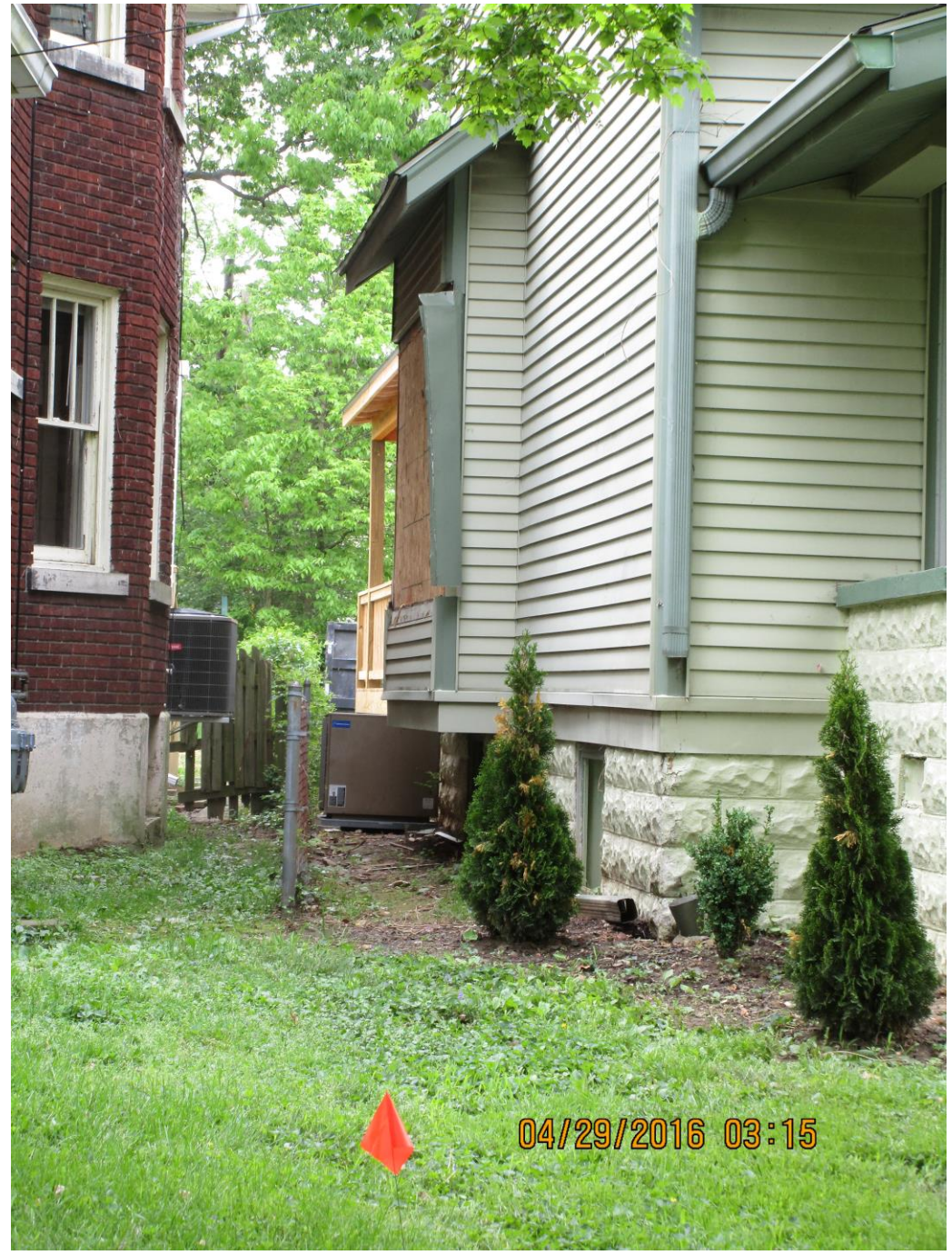
Looking down the property line between 154 and 156 Pennsylvania Ave.