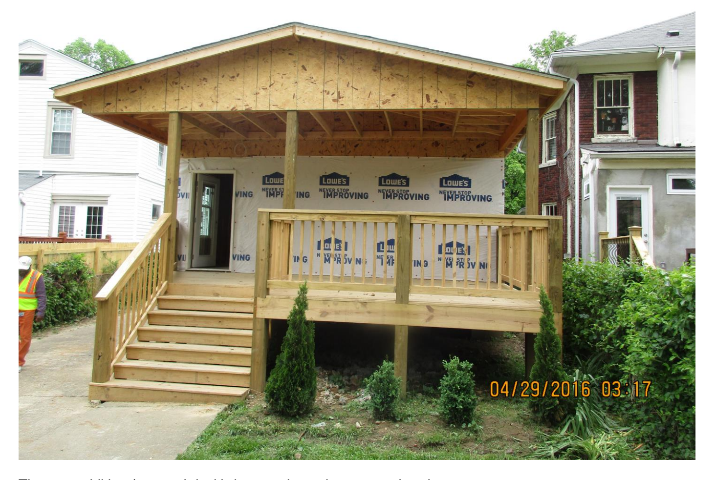
The rear addition (covered deck) that was issued a stop work order.