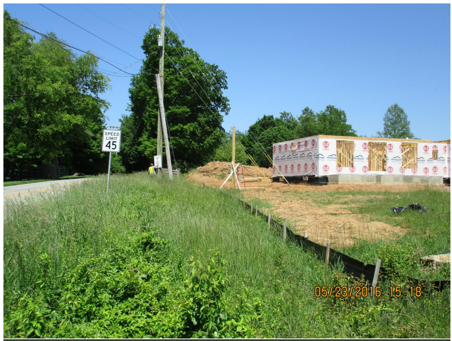
Looking North down Aiken Road at the setback of the house.