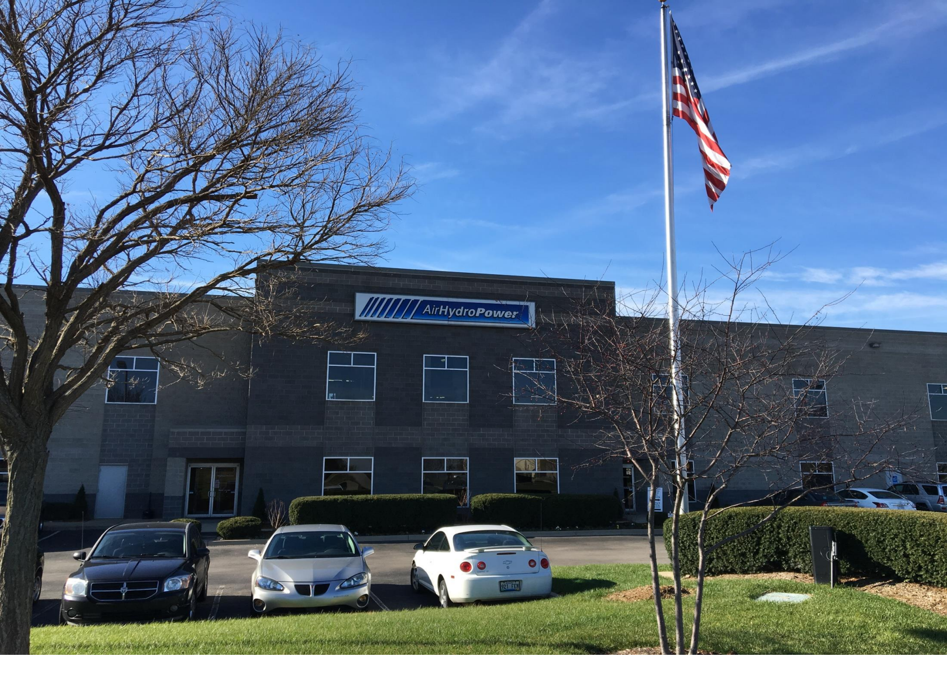
2550 Blankenbaker Parkway