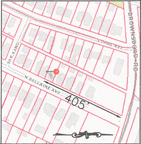
Location Map No Scale

A variance of the minimum side yard from 3 feet to 1.2 feet in LDC Table 5.2.2 on the East side yard.