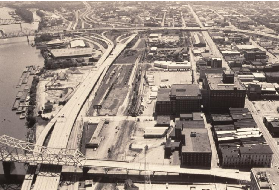
Before Waterfront Development