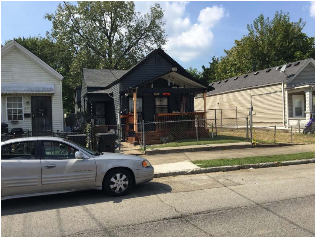
Side View-418 N. 24 th Street