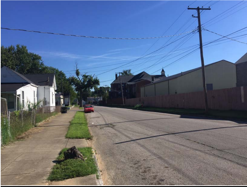
Street View South-24th Street