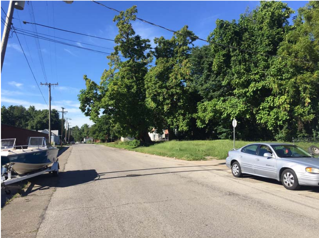
Front View-418 N. 24 th Street

Resolution No. 14, Series 2016 Landbank Meeting Date: September 12, 2016 Property Address: 420 N. 24 th Street