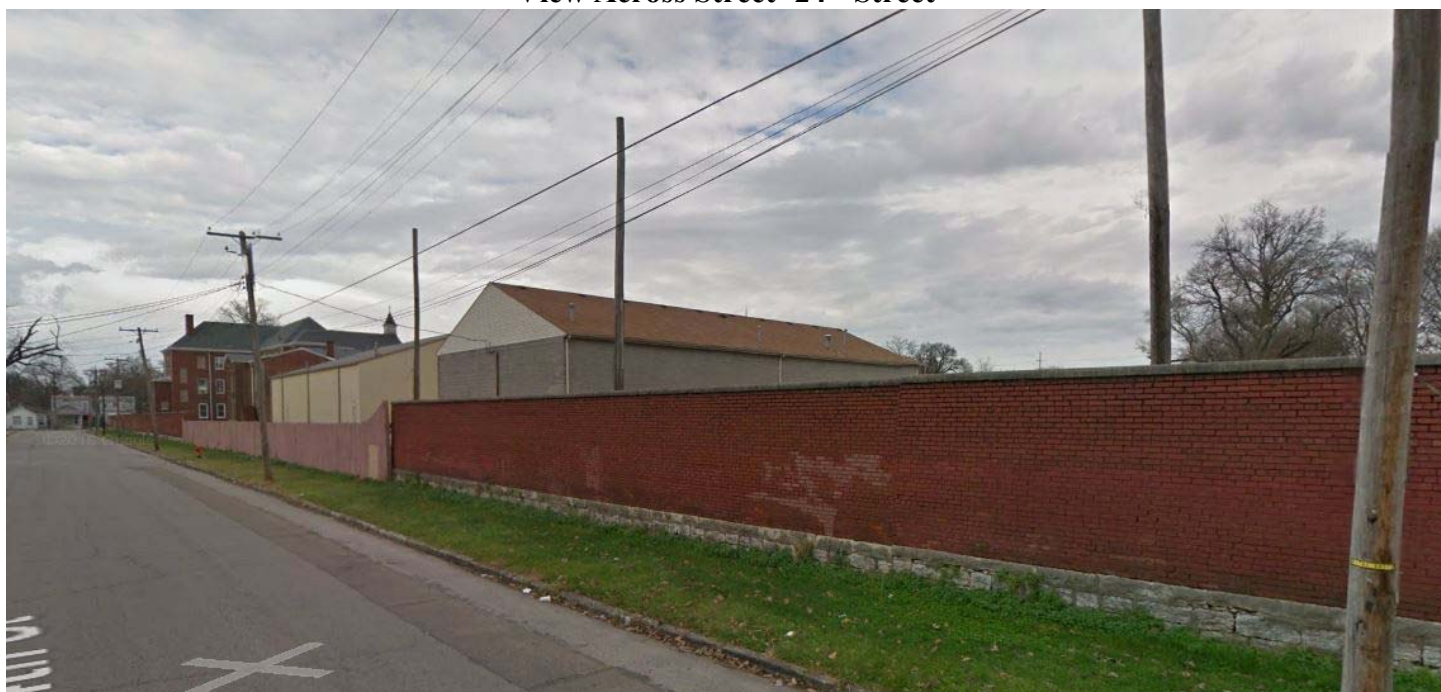
Street View North-24th Street

Resolution No. 14, Series 2016 Landbank Meeting Date: September 12, 2016 Property Address: 420 N. 24 th Street