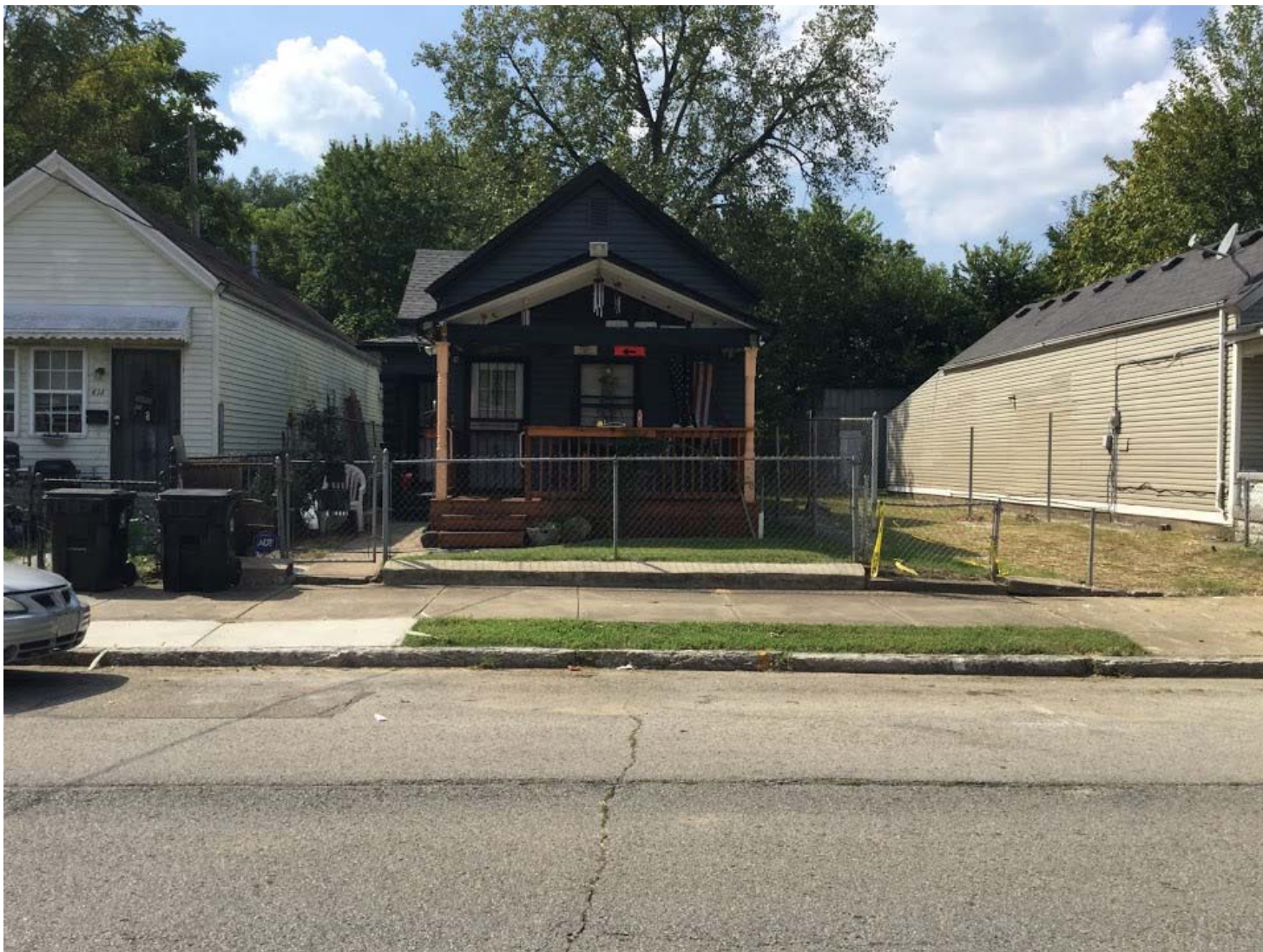
Side View-418 N. 24 th Street

Resolution No. 14, Series 2016 Landbank Meeting Date: September 12, 2016 Property Address: 420 N. 24 th Street