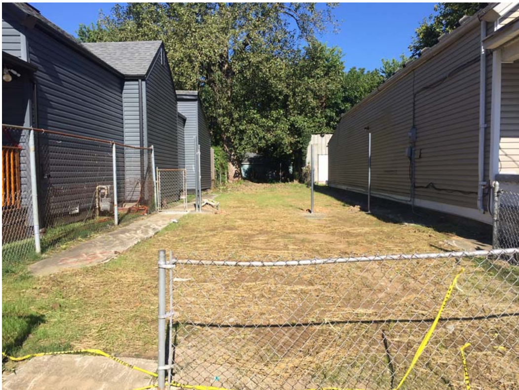
View Across Street- 24 th Street